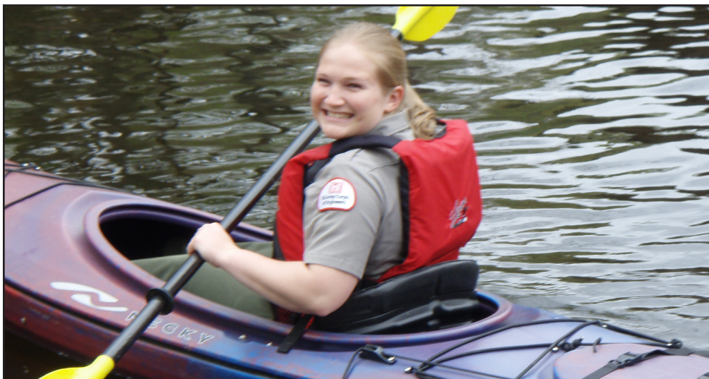
Paddling on Rhode Island's Blueways

Based on the completed Trail Management Plan, establish a Friends of Tillinghast Pond and build their capacity to organize trail work and other events and to raise awareness and appreciation for the management area.