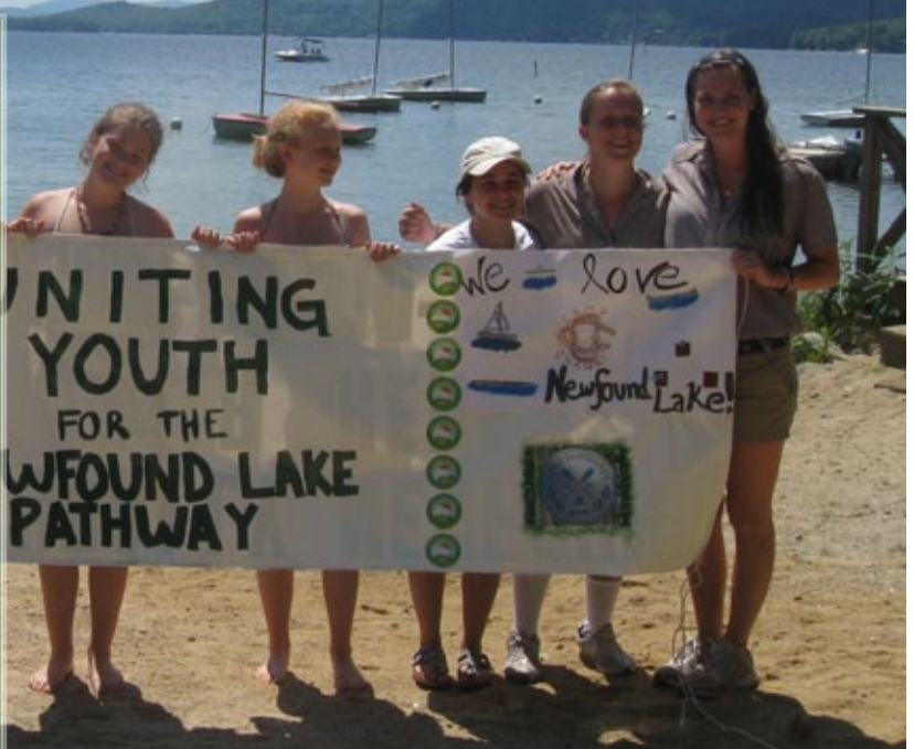
Newfound Lake Relay