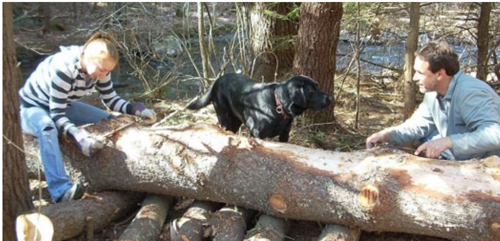
Trail Building Volunteers

Develop a vision and plan for this long-distance trail by providing leadership and coordination, building capacity amongst local groups, and craft an action plan for the trail.