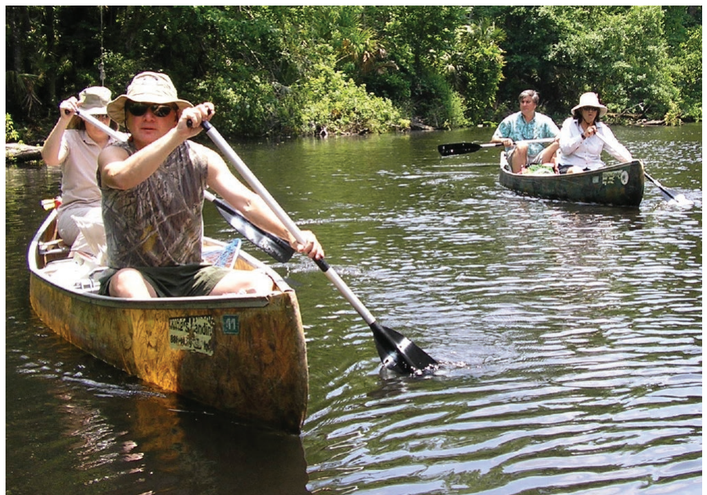
Canoeists paddle along Rock Springs Run, part of the Wekiva River System.

Continue to provide technical assistance for the project and help with oversight and coordination of the Wekiva River Advisory Management Committee.