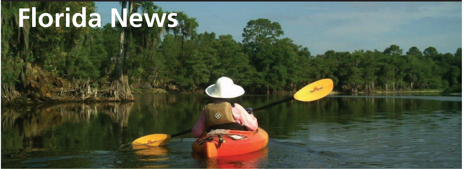
Paddling along the St. Johns River.