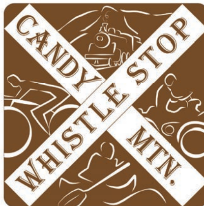
The Candy Mountain Whistle Stop logo highlights the true multi-use nature of the trailhead.