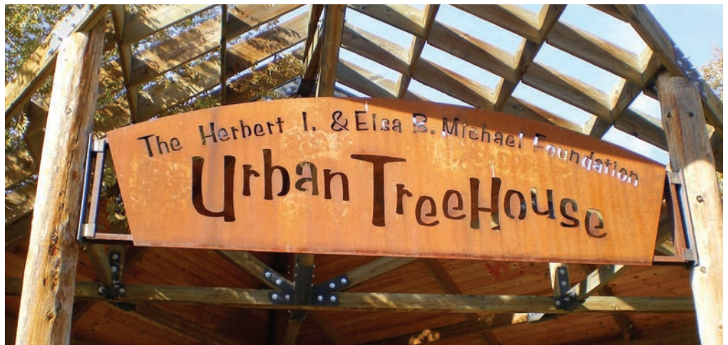
A current environmental education site along the Jordan River.

Implement trail and interpretive signage along the Jordan River Parkway Trail with involvement from Salt Lake City, Salt Lake County, Jordan River Commission, and the Utah Natural History Museum. The signage will attract trail users and provide a missing educational component for an enhanced trail experience.