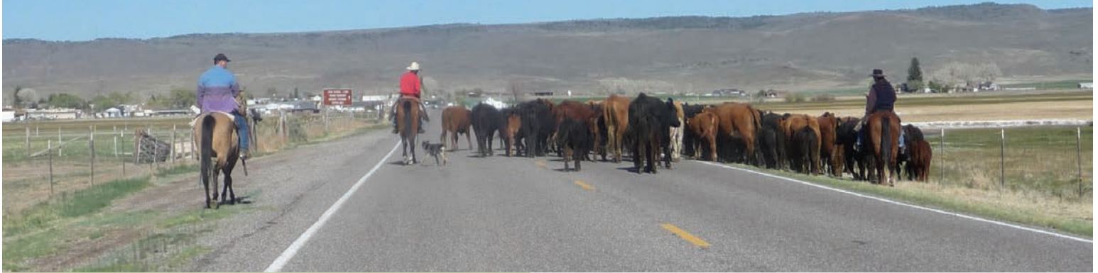
One of the many considerations of trail planning in rural Utah.