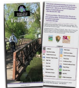
The Trail Map highlights access points, restoration areas, transit connections and other amenities.

The Jordan River Parkway Trail has been constructed in phases over the last several decades. RTCA is currently working with stakeholders to finish one of only four remaining trail gaps. Also, as part of the America's Great Outdoors initiative and with the help of a talented Landscape Architect intern from Utah State University, RTCA worked with Salt Lake County and the Jordan River Commission to produce the first complete map of the trail. The map is expected to increase community awareness of recreation access, improve opportunities for physical activity, and is already in it's second printing!