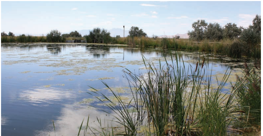
An urban fishery is one of the potential recreation opportunities being planned for the Big Bend Restoration project.