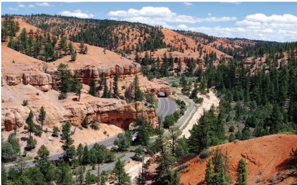
Red Canyon Trail adjacent to Scenic Byway 12 and the Dixie National Forest.

Coordinate and develop a partnership of local, state, federal, and non-profit organizations. Facilitate partner meetings and define possible funding sources.