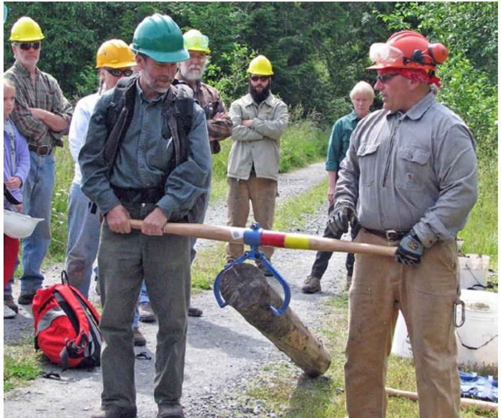
Members of Lopez Community Trails Network acquire new trail-building skills, thanks to local partners with the San Juan County Land Bank and BLM.

RTCA will help this community coalition create a potential 20-mile network of trails on Lopez Island that will connect key community destinations, including existing parks and trails, Lopez Village, and the ferry landing.