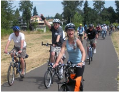
Intertwine partners are looking at ways to maintain and improve natural resources.