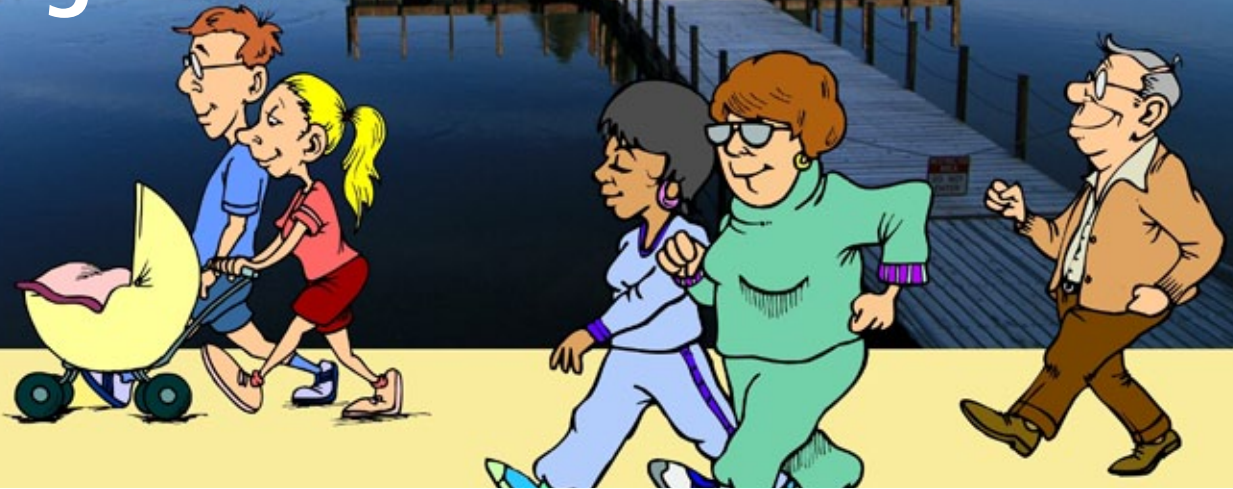
Spokane County's "Step Out and Get Moving!" brochure features eight great walks for people of all ages and abilities. Graphic: Spokane County Health Department