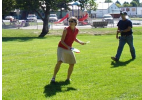
Chewelah City Park is part of a new trail master plan.