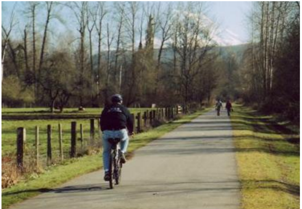
The Foothills Trail, near Mount Rainier National Park, is an important component of a county-wide system of trails and greenways.

The city of Roslyn wants to develop a plan for non-motorized recreation and trails that connects the city to regional recreation and wildlife networks and enhances both individual health and community livability. The project area includes over 300 acres and several miles of trails.