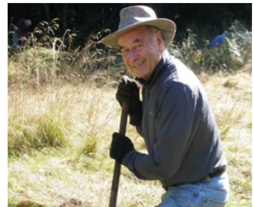
A volunteer plants trees on Nisqually Land Trust Forest Reserve property.

RTCA is helping trail partners develop a plan for a 70-mile recreational boating route along the Pend Oreille River. Key goals are to preserve habitat, boost the local economy, and establish destinations for research and education within the river corridor.