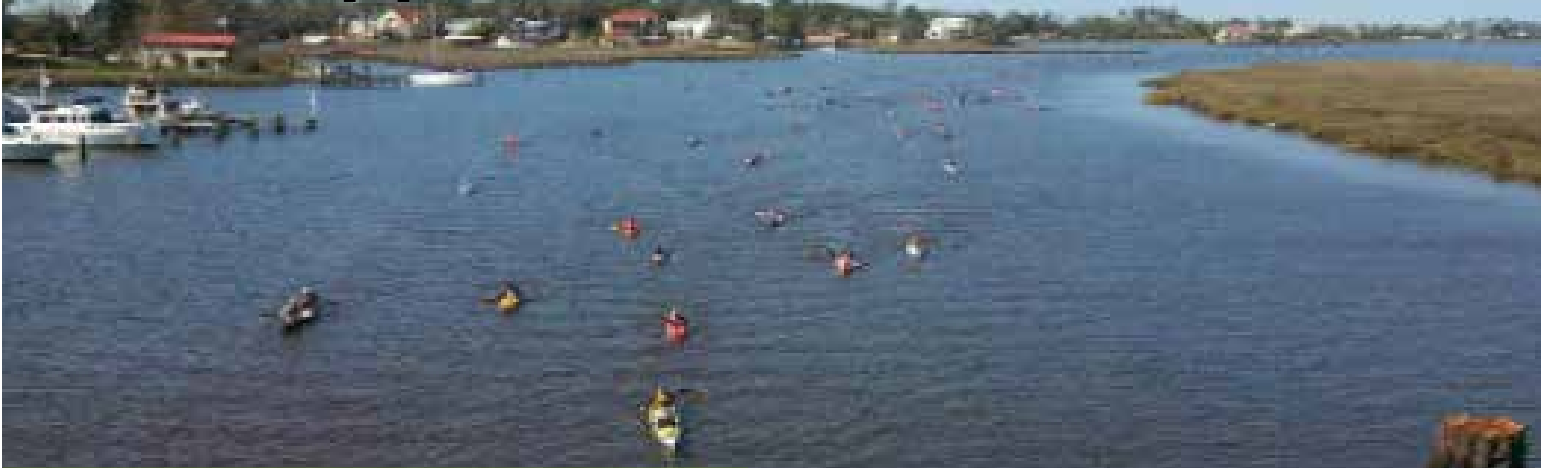
"Battle for the Bayou" kayak race.