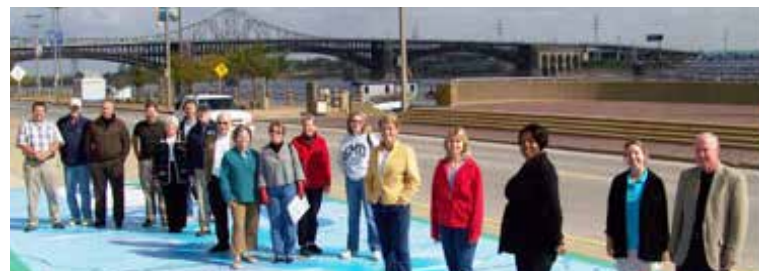
Midwest and Southeast NPS Superintendents and NPS Rivers, Trails, and Conservation Assistance program staff with partners on the Mississippi River Trail graphic on the riverfront in St. Louis, Missouri.

Provide facilitation assistance in support of the development of segments of the MRT in Mississippi through outreach and workshop planning.