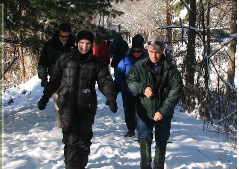
Enjoying the Northern Rail Trail. NPS Photos