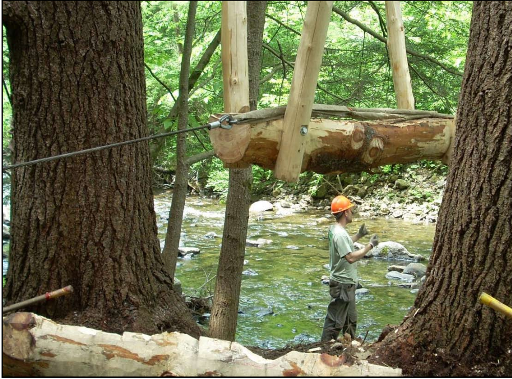
Constructing Mink Brindge

was realized in 2009 through the help of many volunteers and the expert bridge design and leadership of Tahawus Trails, Inc. The Mink Brook Bridge is shown under construction below.