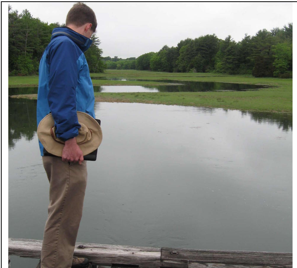
New Hampshire Seacoast Greenway

Completion of the New Hampshire Seacoast Greenway rail trail, linking the East Coast Greenway through New Hampshire.