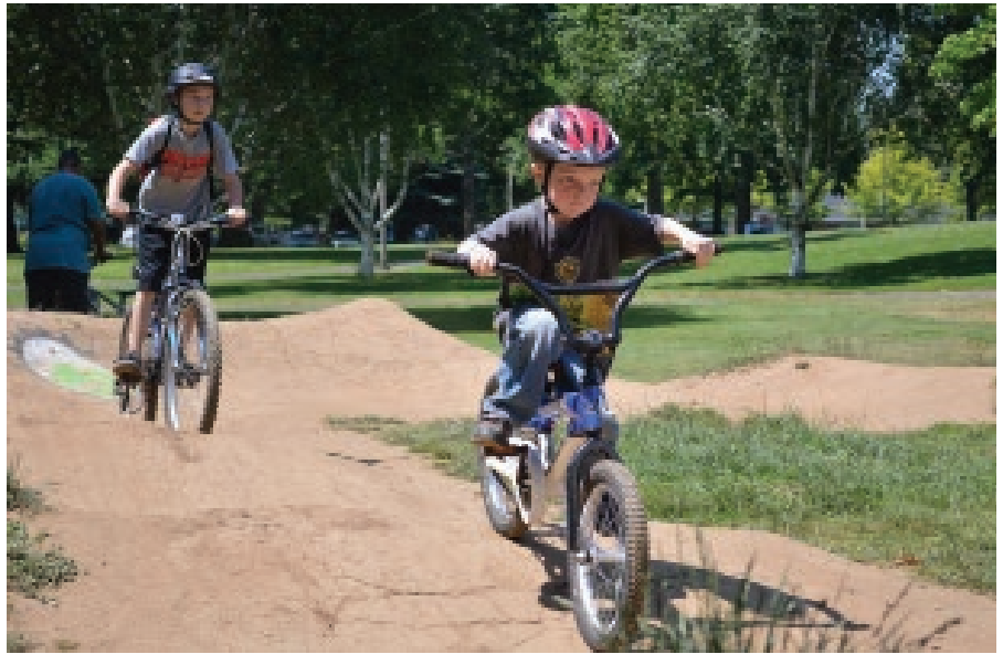
The Salem Area Trail Alliance and Oregon State Parks and Recreation want to increase close-to-home outdoor activities like this popular Ventura Pump Track in Portland.

Sweet Home envisions a community trails plan that will serve as a blueprint for reconnecting the community to its forests and rivers, providing more ways for people in Sweet Home to get outdoors, be active, and connect with nature. RTCA is helping project partners reach out to stakeholders and the overall community to get input for the trails plan.