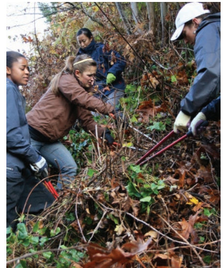
Students at Lewis & Clark College volunteering along the Springwater Corridor Trail.

In 2008, RTCA worked with key partners, including the Urban Greenspaces Institute, Portland's Metro Regional Government, and Vancouver-Clark Parks & Recreation to develop the first Bi-State Regional Trails Plan. The planning effort took nearly two years, focusing on the region's backbone of keystone trails, and recommending 37 new trails that provide critical connections to the existing system. Since the plan's completion, regional stakeholders have formed a quarterly trails group, secured over $75,000 to develop an interactive trails website, generated regional trail sign standards, held trail counts, created over seven master plans, and developed ten new regional trails. For more info, check out www.theintertwine.org .