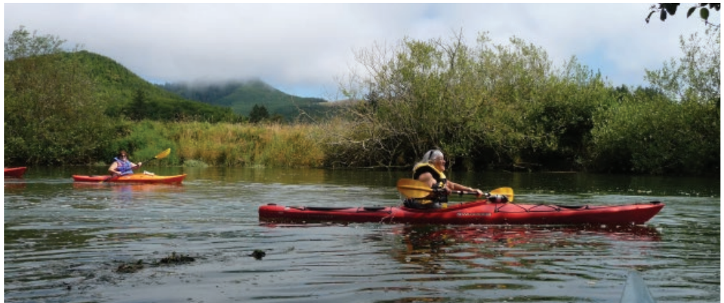
Paddlers enjoy a ride on the Nestucca River as part of a celebration paddle for the Tillamook County Water Trail and their new status as National Recreation Trail.

Eight years ago the Tillamook Estuary Partnership championed the development of a non-motorized water trail system that integrates over 250 miles of paddling opportunities in five coastal watersheds. Since then, water trail partners have garnered over $60,000 in grants, published a beautiful series of guidebooks, sponsored ongoing education and stewardship activities, and logged countless volunteer hours of support. This year the water trail won recognition as a National Recreation Trail, becoming one of more than 1200 trails across the country recognized for their exemplary standards and their local and regional significance. RTCA provided planning assistance to this water trail and an earlier success model, Hoquarten Slough. Check out the trail's Facebook page for photos of the flotilla event launched to celebrate designation.