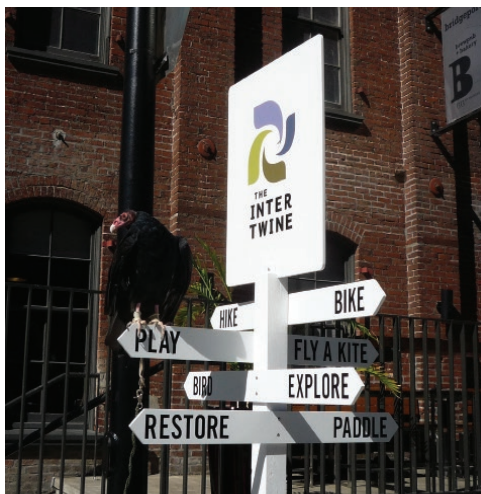
The Intertwine: adding conservation to recreation.

The Salem Area Trail Alliance is working with Oregon State