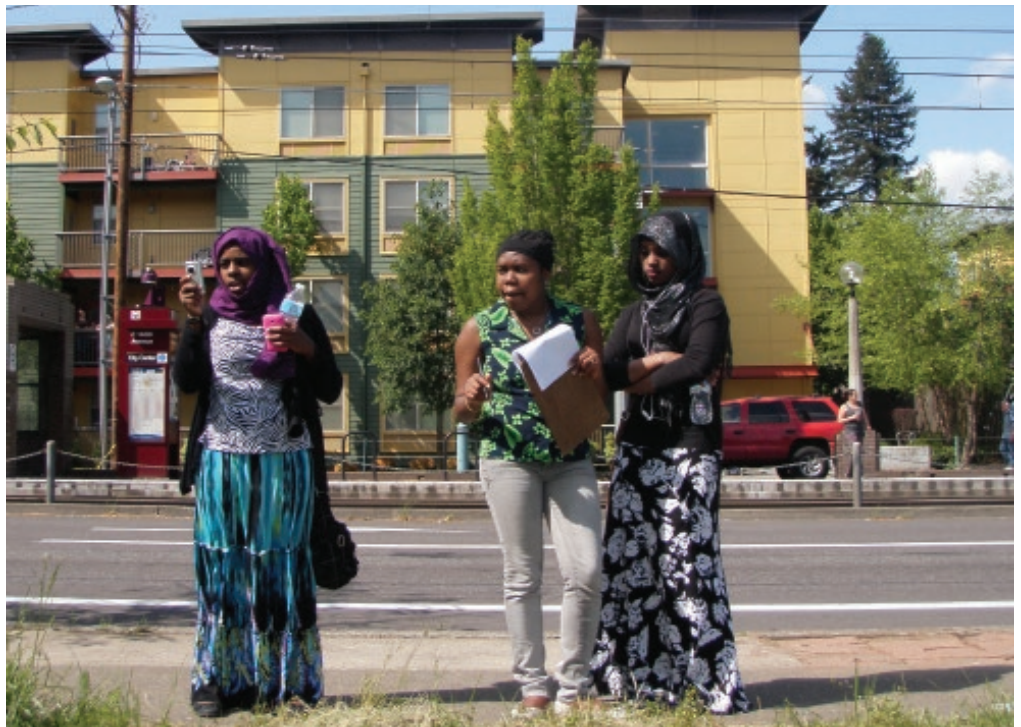
Students at David Douglas High School inventory abandoned parcels of land for redevelopment potential. A community planning process will determine the land's future use.

Groundwork Portland, a nonprofit organization dedicated to environmental justice and issues of equity in the Portland metro area, is using a community-based planning process to locate brownfields and abandoned parcels of land suitable for redevelopment in the East Portland neighborhood surrounding David Douglas High School. RTCA is helping coordinate high school students to inventory and assess potential lands around their school. NPS will then help project partners select a parcel for redevelopment and conduct the community process that will determine the land's future use.