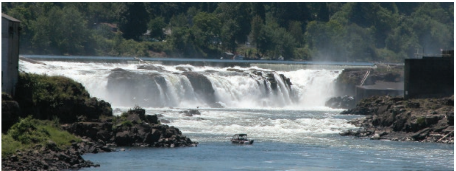
Project partners have an opportunity to envision a new use for an old industrial site located next to Willamette Falls, in downtown Oregon City.

County, and the entire region, a partnership formed to investigate potential site acquisition using funds from Metro's Natural Areas Program. RTCA is helping project partners develop a collaborative vision for the site, and then develop a concept plan to implement that vision focusing on public access, ecological restoration, cultural interpretation, and economic development.