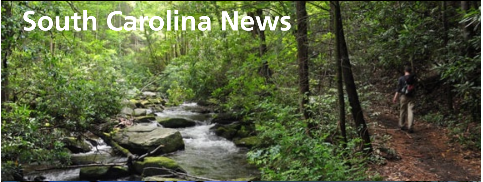
Hiking at Jones Gap State Park, South Carolina