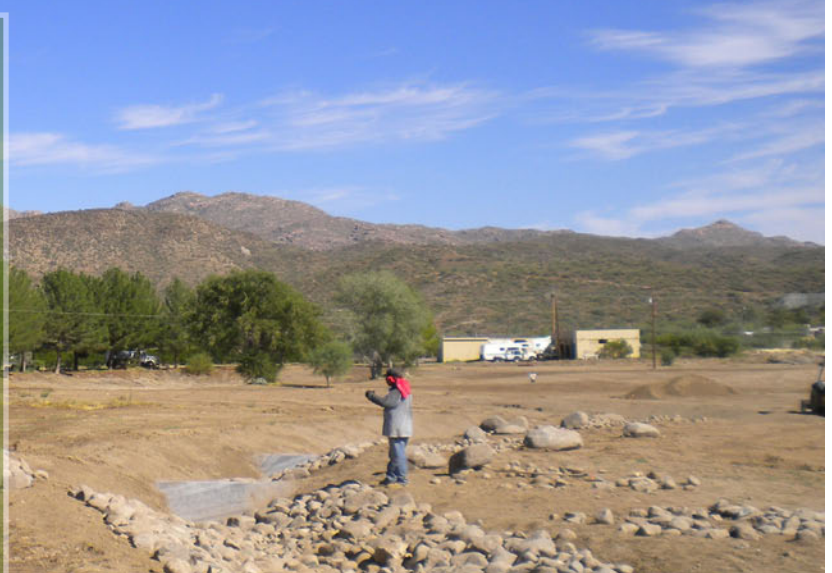
Black Canyon stream and pond construction