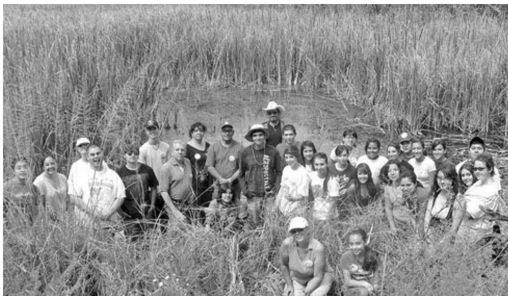
Nogales High School Science Club, volunteers from the Clean City Healthy City Program, and members of the Las Lagunas Project Team pause during work to clean up and restore Las Lagunas de Anza.