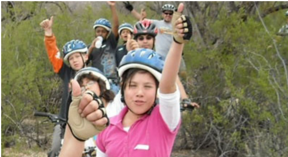
Youth on the trail in Saguaro National Park