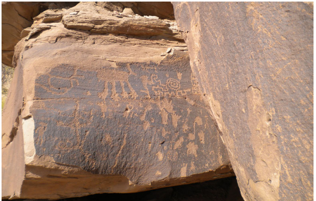
Prehistoric petroglyphs at Hidden Cove