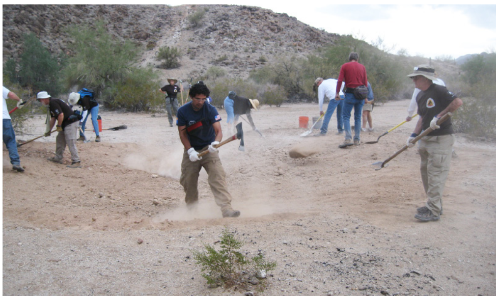
Volunteers on Anza Trail restoration project in Gila Bend

Establish a connecting trail along the Bloody Tanks Wash to link the wash to the downtown commercial area and community recreation facilities. The trail will be established on top of the new sewage line infrastructure corridor.