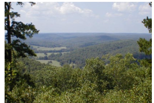
The Cherokee Ozarks