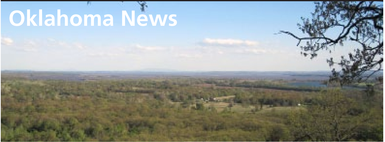
View of the Ozarks near Vian, OK