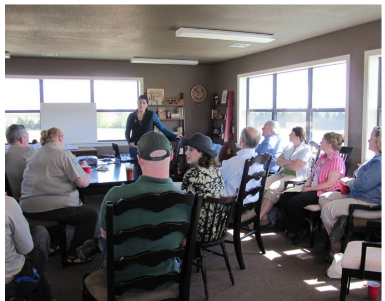
Community members discuss greenway concepts

Greenway partners have been working to craft their vision for what the greenway should be and to define what it means to be a part of the Greenway of the Cherokee Ozarks. Representatives from local non-profit organizations, municipalities, the Cherokee Nation, state and federal land management agencies, local governments, as well as community members are exploring possibilities for a greenway collaboration that will enhance habitat, protect natural resources, create close-to-home recreational opportunities, and interpret and protect natural, cultural, and historic resources.