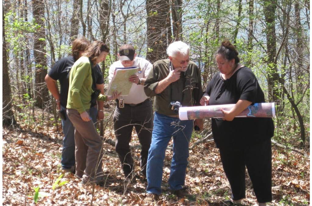
Greenway of the Cherokee Ozarks Planning Group exploring options in the field - in Dahlenegah Park, Adair County, OK