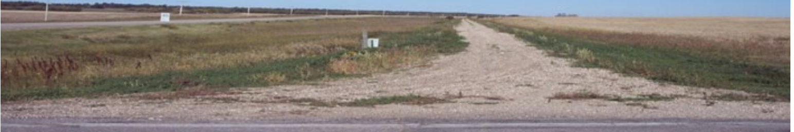
Wakopa Trail