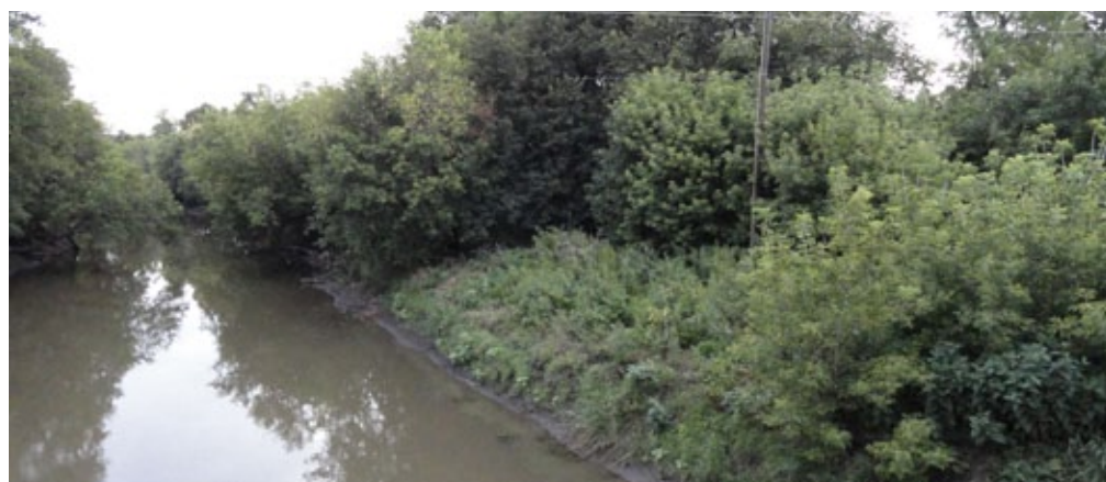
Turtle River awaits a new trail from the Manvel Matters Project.