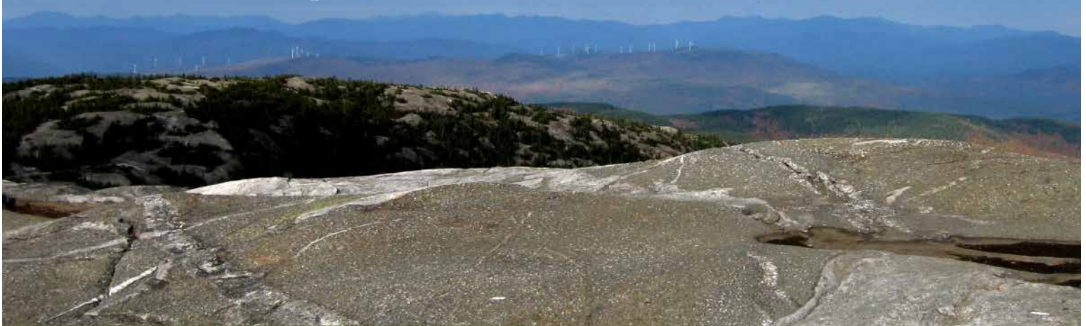
Mt. Cardigan: Terminus of the Quabbin to Cardigan Trail.