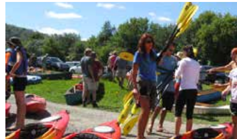
A busy launch site on the Connecticut River.

Develop a trail through Merrimack which connects the middle and high school, conservation land, and the downtown. The trail will be along the river where a dam has been removed.