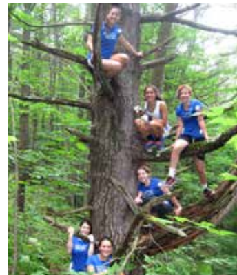
Members of the Upper Valley High School Trail Corps.

In the summer of 2013, ten high school girls from five different towns in New Hampshire and Vermont, experienced what it is like to work in the outdoor recreation sector as members of