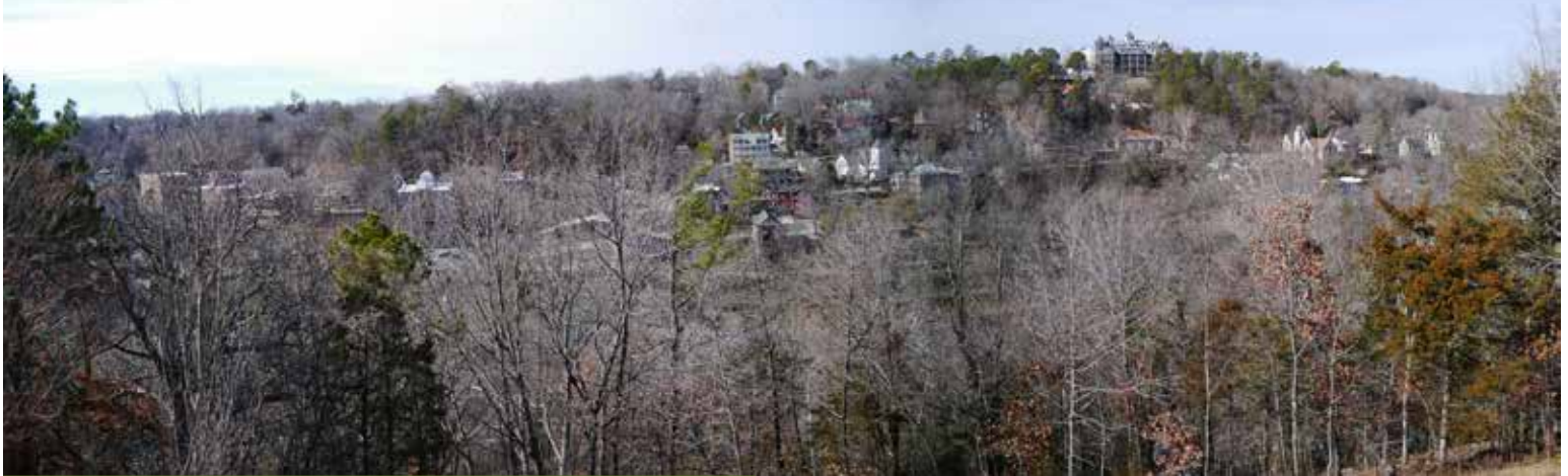
Historic District of Eureka Springs, Arkansas.