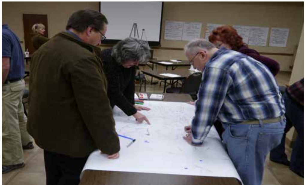
Stakeholders participate in a trail planning meeting for the Eureka Springs Historic District.

Assist in the development of a master trail plan, help plan and facilitate public meetings, work to engage civic leaders, and assist with finding funding resources for the project.