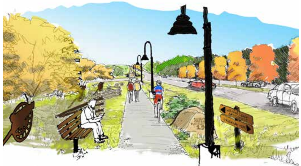
Sketch illustrating trail concept for approach to Wilson's Creek National Battlefield.

Assist the town's planning department in the area assessment for the selected trail development. Help search for potential funding resources and provide conceptual planning, organizational development, and capacity building guidance and expertise.