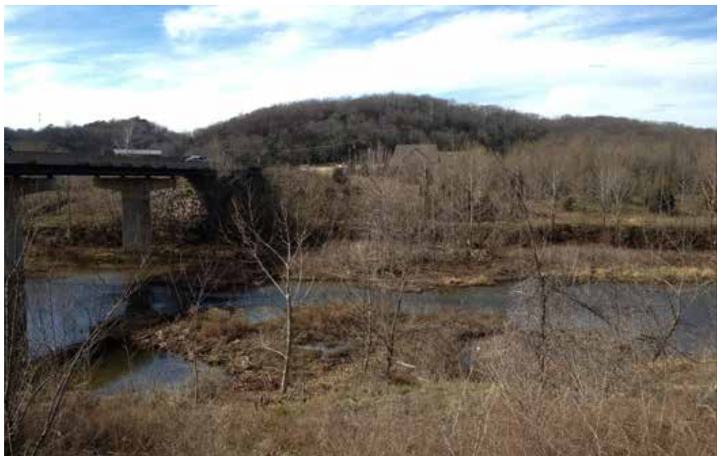
Little Sugar Creek located in Bella Vista, Arkansas.