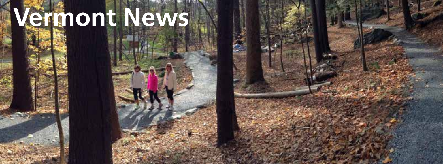
Peak to Peak celebration of Woodstock's trails.