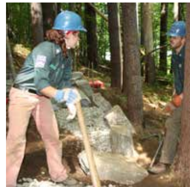
VYCC crew rebuilding the Faulkner Trail

This past year, the fearless Vermont youth crews wrestled huge rocks into perfect position to hold up new tread for the 75-year old Faulkner Trail. Along with trail restoration specialists from Peter Jensen and Associates, youth crews worked to restore the