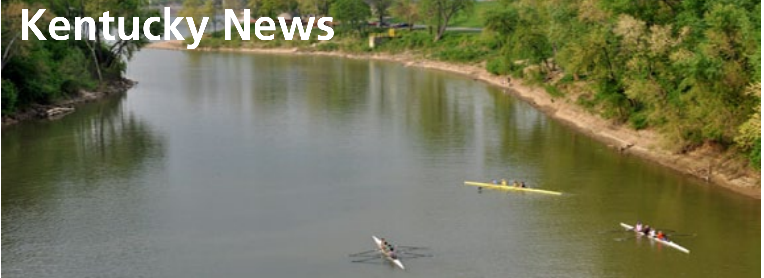
Kayakers row through the Licking River, Kentucky