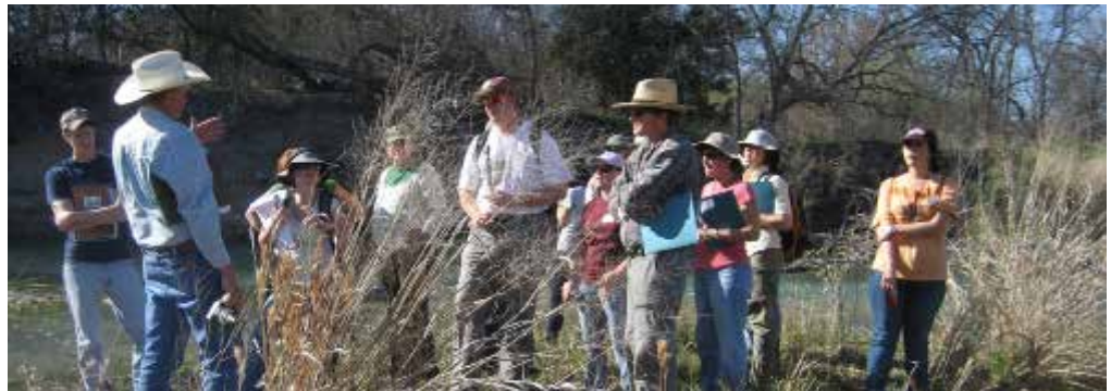
Llano River Field Station hosts groups learning about riparian areas.

In October 2013, the TTU-LRFS was awarded a $230,000 Innovative Energy Demonstration Grant from the Office of the Texas State Comptroller's Energy Conservation Office. This grant will help fund the installation of solar panels and a wind turbine. This project makes two buildings at the TTU-LRFS the first in the entire Texas Tech University system to run on renewable energy using sun and wind.