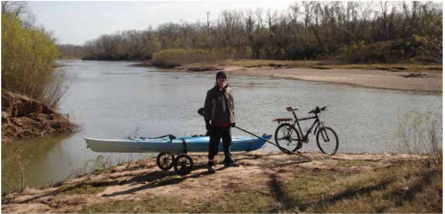
Brazos River bike-kayaker.