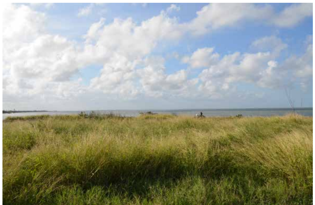
Future site of the proposed Arturo Galvan Coastal Park in Port Isabel, Texas.

The Franklin - Organ Mountains Landscape Conservation Collaborative