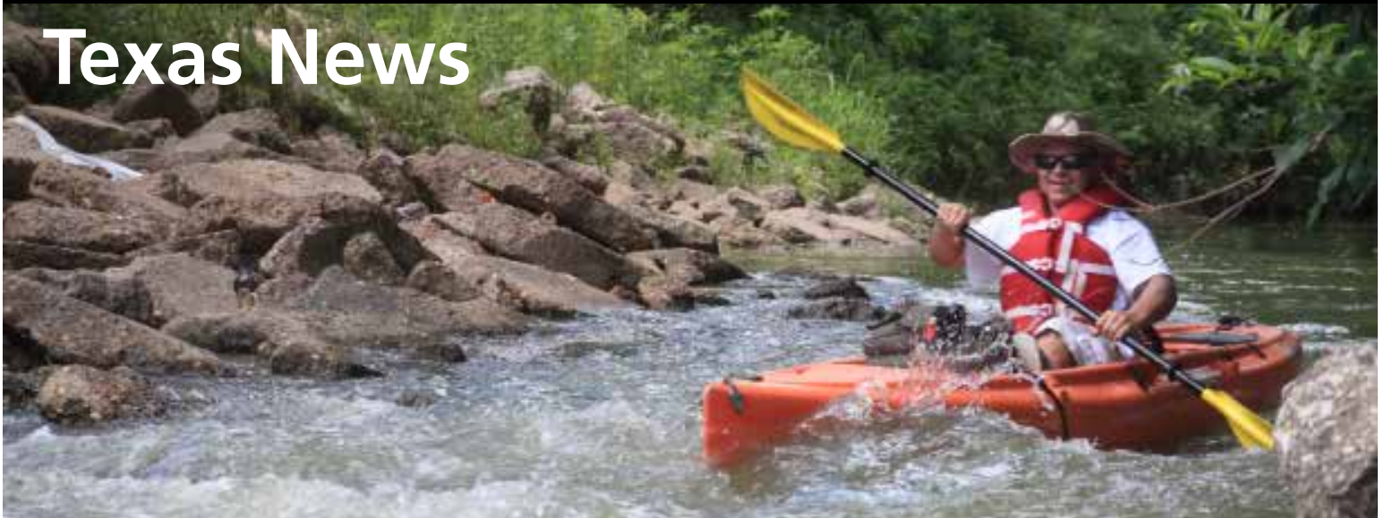
Experiencing Greens Bayou paddle trail.