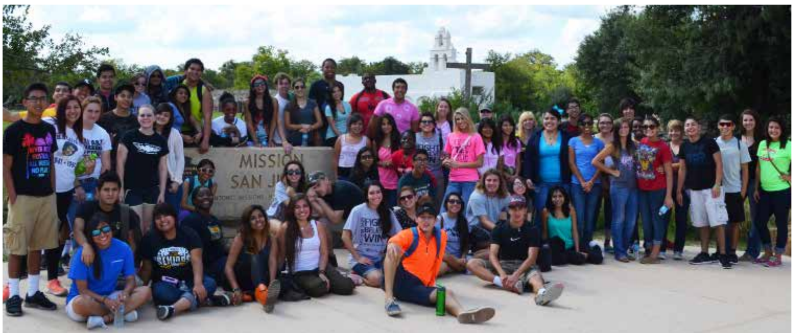
Students participating in a partnership developed education program at San Antonio Missions National Historical Park.

Provide support and technical assistance as needed for project development and partner coordination.