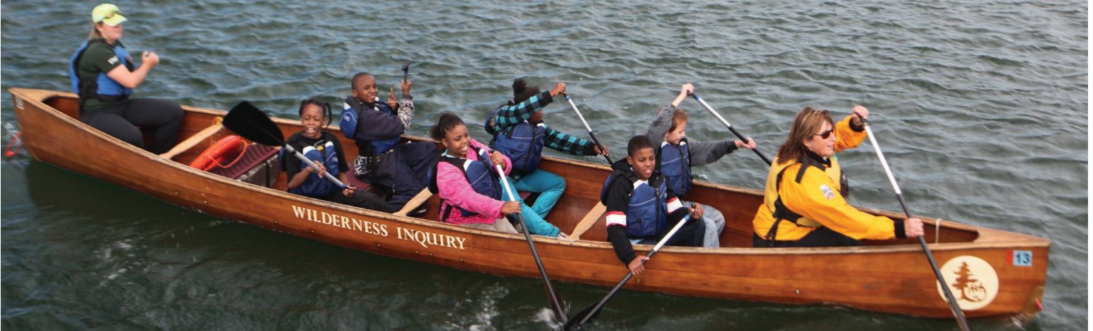
Wilderness Inquiry youth paddling event!