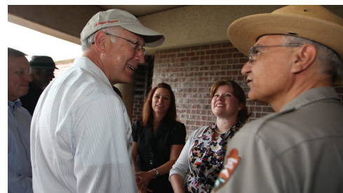
Department of Interior Secretary, Ken Salazar visits with partners at Indiana Dunes National Lakeshore.

Help the community and county develop a county-wide connectivity plan with strategies for implementation. RTCA will define and facilitate public outreach, work with city, county, and other primary stakeholders including Saint Joseph's College, Jasper County Hospital, private industry (Donalson's, Con Agra), local businesses, and community members.