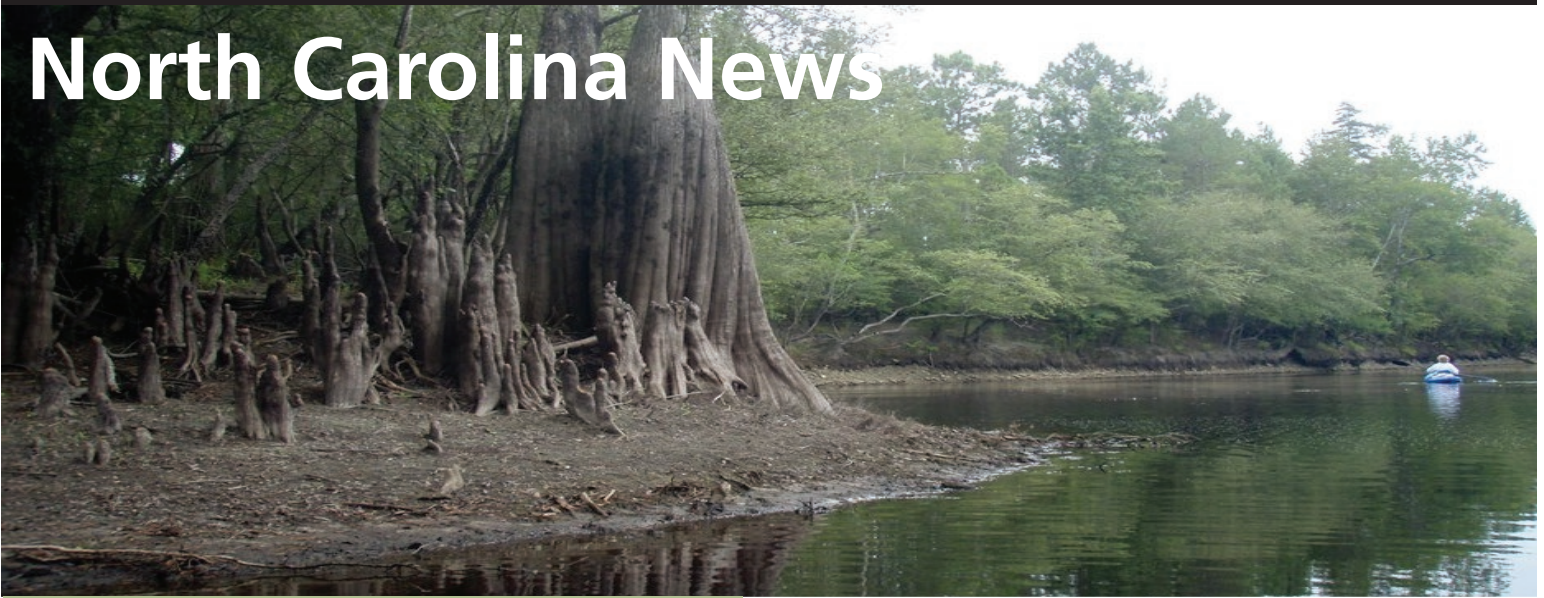
Bald Cypress Knees along the Waccamaw River.