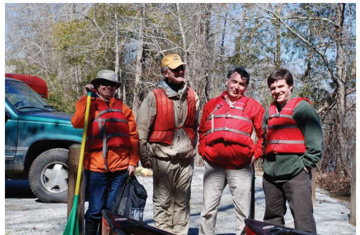
Waccamaw River Blue Trail planning team.

Selected as a Department of Interior's America's Great Outdoors Project, the Waccamaw River Blue Trail continues to move forward in creating a recreation and conservation plan. Working in partnership with NC Department of Transportation, NC Wildlife Resources Commission, and the Waccamaw Riverkeeper, the partners have identified three public and private access points. The newest access point being located adjacent to Juniper Creek. Future plans include developing a paddle guide and hosting an annual "Paddle Fest" in 2013.