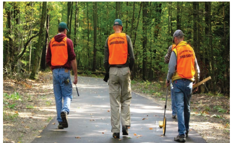
Friends of Sleeping Bear Dunes Trail Ambassadors.

The first 4.5 miles of the 27 Sleeping Bear Heritage Trail, through Sleeping Bear Dunes National Lakeshore, officially opened in June 2012. Many partners have been involved in trail planning and development but now that the trail is open the Friends of Sleeping Bear Dunes and the National Lakeshore are primarily responsible for trail management and maintenance. The Friends worked with NPS RTCA to submit a successful grant application to the National Parks Foundation Active Trails program to create the "Trail Ambassador" program, conduct a trail use survey and analysis, and fabricate and install trail signage.