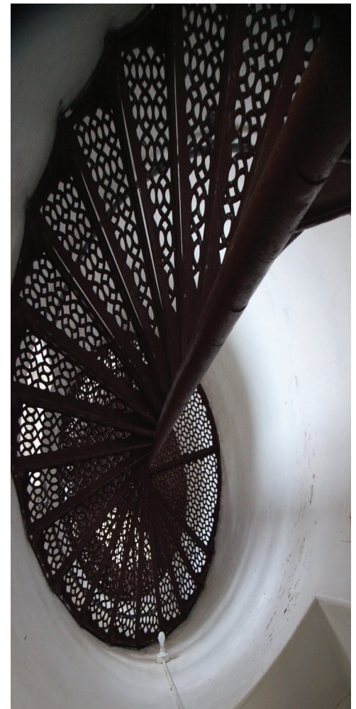
Michigan Maritime Heritage Resource Study.

Work with City of Cadillac, MDNR and other partners to identify alternatives for extending the White Pine Trail into downtown Cadillac, determine best alternative, trail concept plan, and funding strategy.