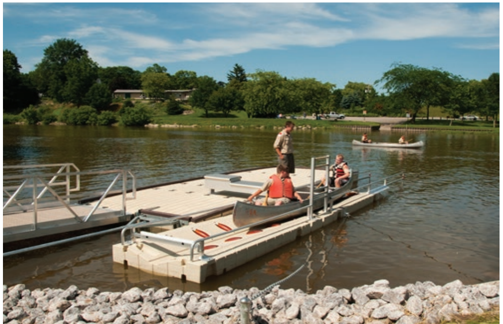
Cass River Water Trail ADA accessible launch in Frankenmuth, MI.

Create a planning team, planning committee, and facilitate the partnership and master planning process for the Copper Heritage Trail.