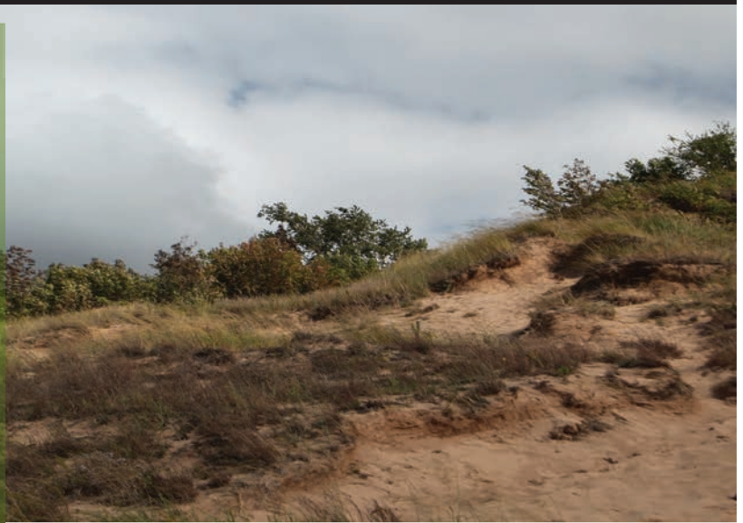
Sleeping Bear Dunes on Lake Michigan.