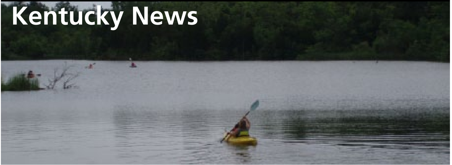
Kayakers along the Kentucky River