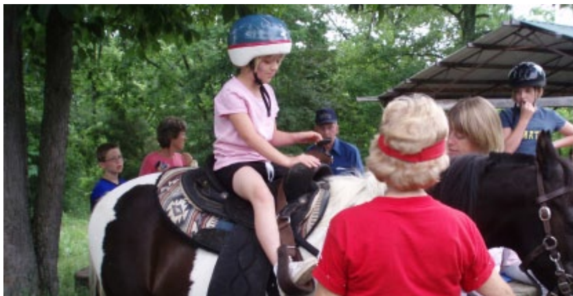
RTCA staff and volunteers help kids get ready to ride around the Eagle's Nest Equestrian Trails Preserve

Assisting Kentucky Riverkeeper in trail designs and facilitating and conducting meetings with various project partners along the area.