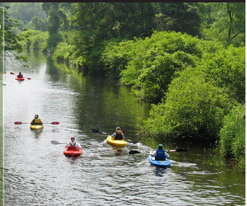
Willimantic River Water Trail