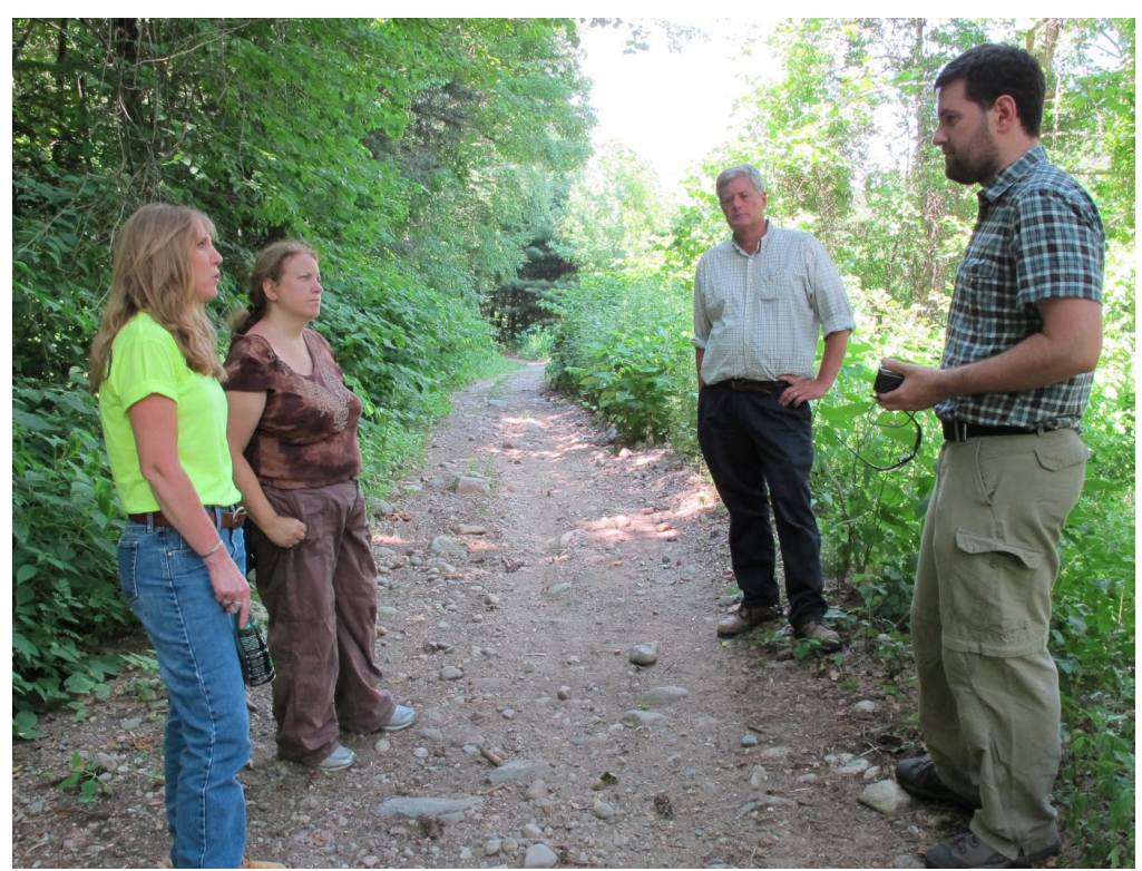
Sometimes, scouting a new greenway is just plain beautiful. The Naugatuck River valley is better know for its industrial history, but the future will be shaped by nature and recreation.

Advise the Town Engineer and Steele Brook Rangers, a fledgling volunteer group that is complementing town staff by organizing public events and mobilizing citizens who want to help.