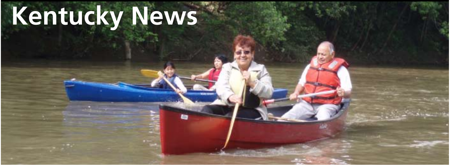
Canoers paddle down the Big Sandy River, KY