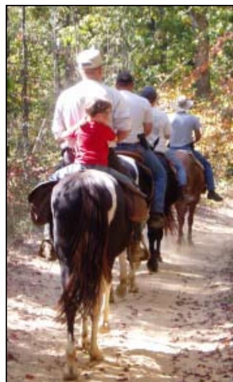
Equestrian ride through one of Kentucky's many horse trails

Assisting Jessamine County to design an overall trail strategy; and master plan. Craft a resource assessment strategy and assess sections on the trail for further development.