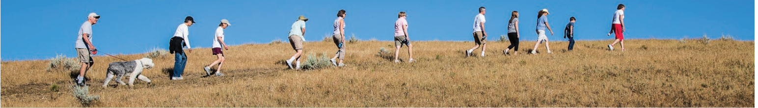
Soldier Ridge Trail Trudge, Sheridan, WY.