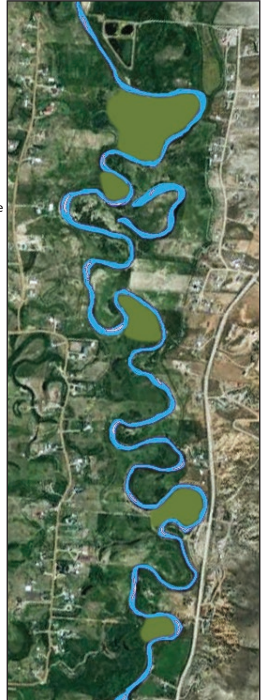
Town of Bear River founders preserved over 50 acres of parkland along the Bear River.

Assist in determining partners interested in river bank stabilization and compile a list of funding sources available for implementation. Work with the City to develop a trail and park committee, facilitate public participation meetings, and complete a park concept plan.