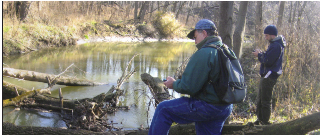
Planning a watertrail

Build a partnership organization to work on the Lake Michigan Water Trail that will work to provide access to Lake Michigan in four states through numerous landings and access points