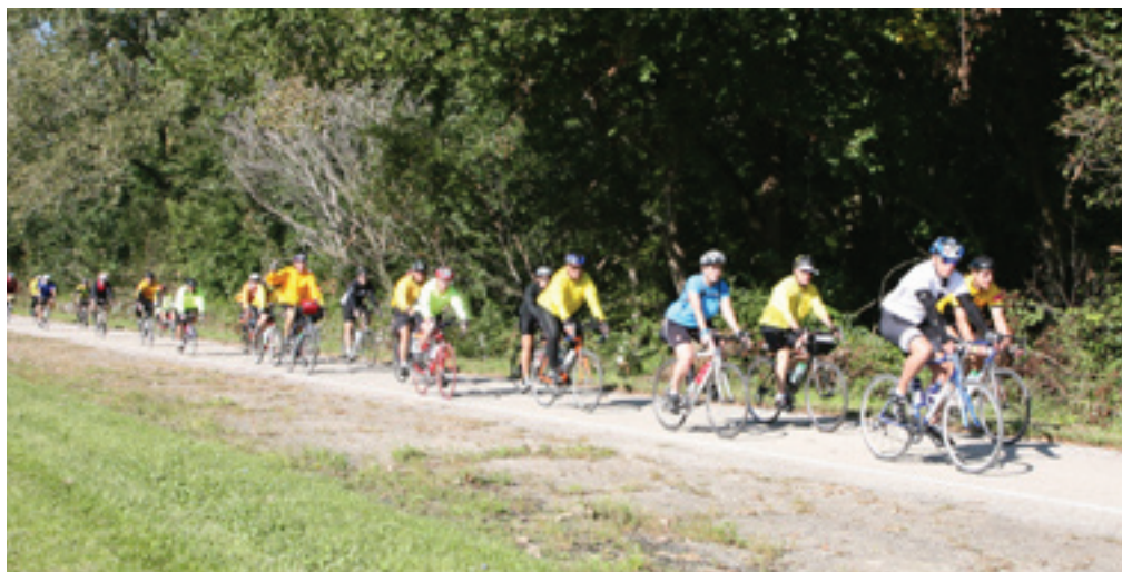
Route 66 Publicity Bike Ride, September 2009

Work with multi-state group to find appropriate bike route through Illinois, both on road and off.