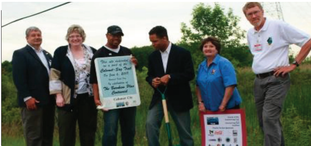
Calumet-Sag Trail Burnham Centennial Dedication