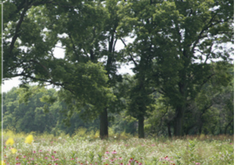
Forest Preserve District of Will County Nature Preserve