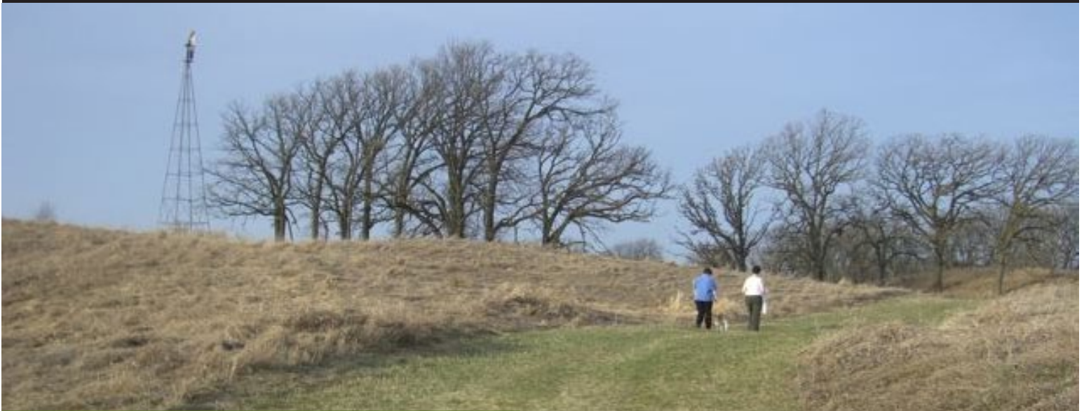
Taking a healthy stroll in the hills.