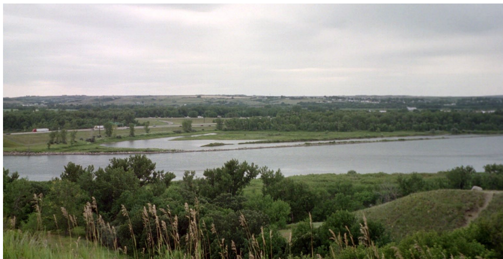
Missouri River in North Dakota

RTCA will assist with project guidance and identifying funding strategies for the trail expansion.