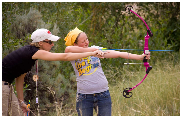
Girl at archery class

The Rivers, Trails, and Conservation Assistance (RTCA) Program is the community assistance arm of the National Park Service. RTCA staff provide technical assistance to community groups and local, state, and federal government agencies working to protect natural areas and water resources and enhance close-to-home outdoor recreation opportunities. We help communities plan, organize partnerships, and achieve on-the-ground success on projects they initiate.