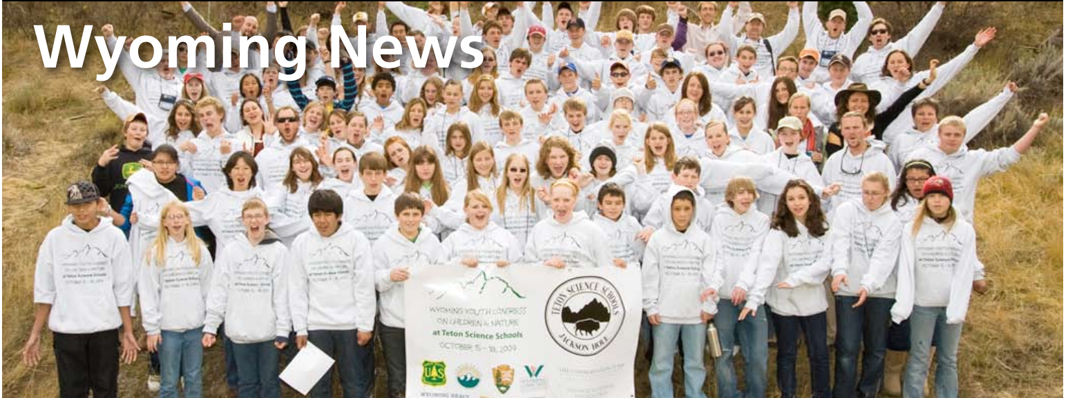
Wyoming Youth Congress, Photo credit: Neal Henderson