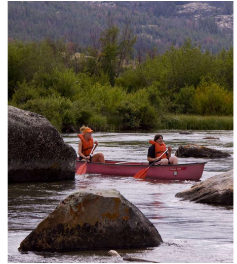
Young canoers