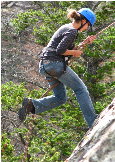
Girl rappelling

This project will result in programs and partnerships that enhance the state and national parks' connection with the youth of Wyoming. The new programs and facilities will make the parks more relevant to younger and future generations. The hoped-for results will get more young people to the parks to learn of, appreciate, and help protect the resources of the parks. Other benefits are increased levels of physical activities to help reduce current levels of childhood obesity and diabetes. RTCA has led the strategic planning sessions that resulted in the creation of WY Outside, a group of agency representatives and other interested parties. WY Outside works to make experiencing the natural world more attractive and relevant to the young people of Wyoming and their families.