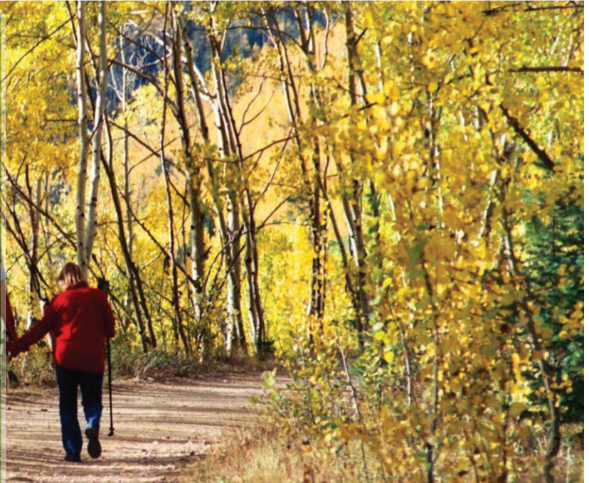
The Spotsylvania Greenways Initiative (SGI) is working to connect people to the outdoors and the history of the region.