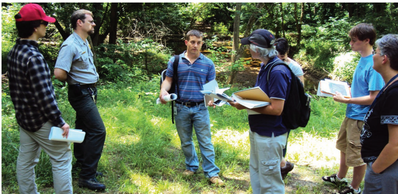
Trail planners discuss options at a workshop for the Deep Run Greenway, a project of the Spotsylvania Greenway Initiative.

Enhance trail connectivity within the National Heritage District and increase understanding and appreciation of historic features, while protecting battlefield resources and landscapes.