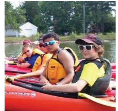
Partners provide opportunities for youth to learn and explore local waterways by kayak.