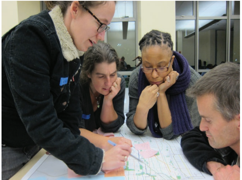
Mapping good places for walking and biking in Rainier Valley.

With help from RTCA, health advocates and local jurisdictions in Cowlitz County will look at ways to connect the cities of Kalama and Kelso with a trail, and explore the potential for a 14-mile rail-trail in the vicinity of Mount Saint Helens.