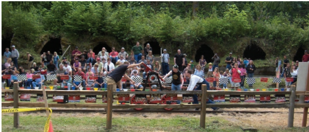
Hand car races in front of historic coke ovens during annual ‘Wilkeson Days’ celebration.

RTCA will help partners in the Rainier Valley engage the community in mapping routes for pedestrians and bicyclists that safely connect transit hubs, businesses and community destinations in one of Seattle’s most diverse and underserved neighborhoods. The project is part of