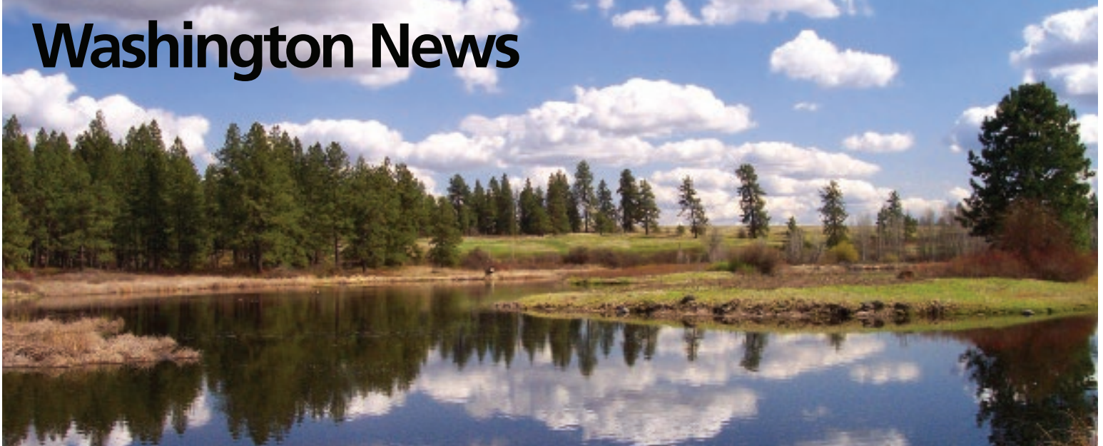
Turnbull Marsh is part of the City of Cheney's proposed new Scabland Recreation Zone.