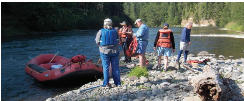
Rafters prepare to launch at the confluence of the Mashel and Nisqually Rivers at future Nisqually State Park along the Pioneer Trek Trail.

Lead Partner: Pathways 2020 Congressional District: WA - 3