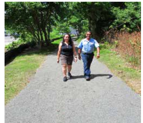
Two Siemon Company employees enjoy a lunchtime walk on the Steele Brook Greenway.