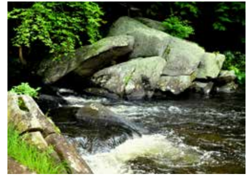
The Naugatuck River flows through Torrington, Connecticut.