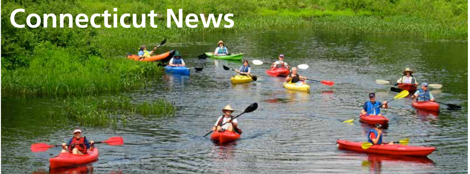
Paddlers approach a bridge on the Willimantic River in Mansfield, Connecticut.