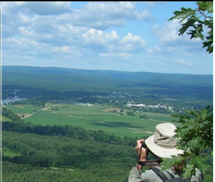
New England Trail