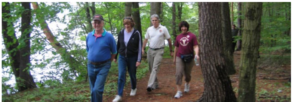
Seaconcke Area Trails

The Seekonk Area Trails group made great strides to realize their vision for an interstate network of land and water multi-use trails connected to key community hubs. Spearheaded by the Y of Providence - Seekonk Branch, the missing links on a 2.5 mile trail circling Turner Reservoir Loop have been constructed, the planning and permitting for a 0.5 mile fully accessible trail connecting the Y rehabilitation facility in Seekonk to the Town Hall and a proposed Senior Citizen Center have been completed, and improvements have been made to nearby rail trails including the East Bay Rail Trail.