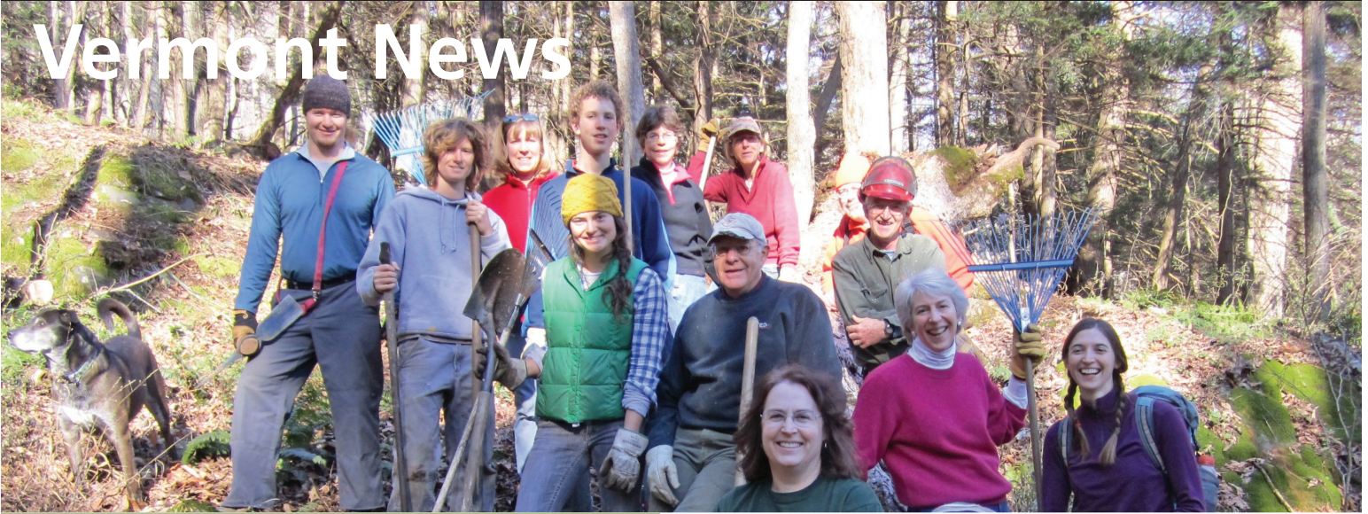
Woodstock Trails Partnership volunteers and RTCA staff celebrate a job well done.