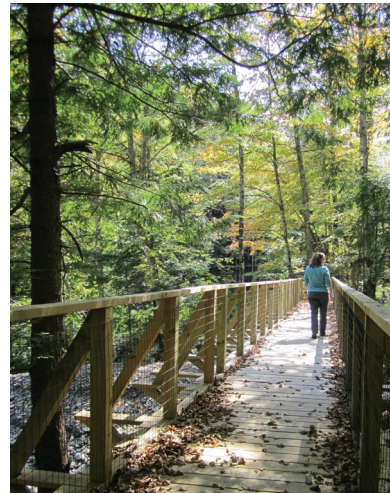
A hiker enjoys the new pedestrian bridge along the Kingsbury Bridge Greenway.

Thanks to a new trails partnership, the Mad River Valley of Vermont is enjoying a growing network of well-managed trails linking public lands and community parks. In just two short years, this group of recreation, conservation, and business groups has