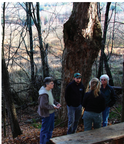
Bakersfield Town Park Trail construction.

Create a strategy for a mountain bike loop trail; continue public involvement, construct a kiosk at the town recreation center; build partner capacity and a long term strategy for maintenance and management.