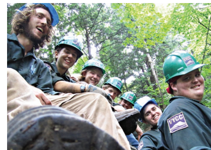
A Vermont Youth Conservation Corps helped to restore the Faulkner Trail.