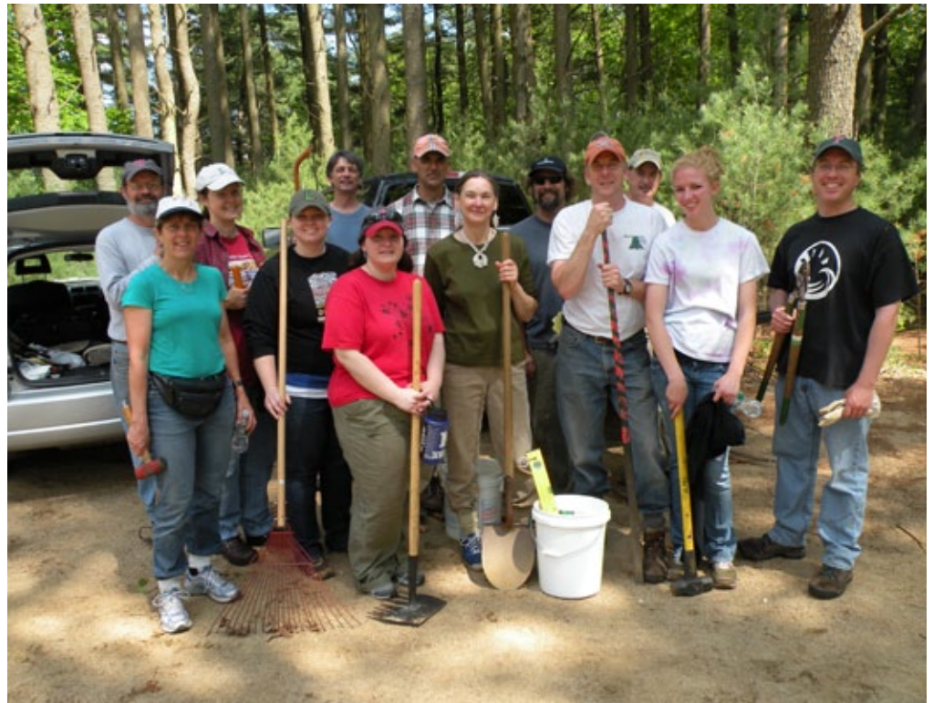
The smiling trail crew of the Tillinghast Pond Management Area Trails

Conduct a trails assessment and train local volunteers in the process. Develop a trail improvement plan including trail closures, improvements, and signage. Build the capacity of the citizen advisory committee to support the town and work with Y to develop trail-based programs for after-school and summer-camp kids. Help to organize and facilitate two public workshops to build public awareness and gain input for desired trail and park uses.