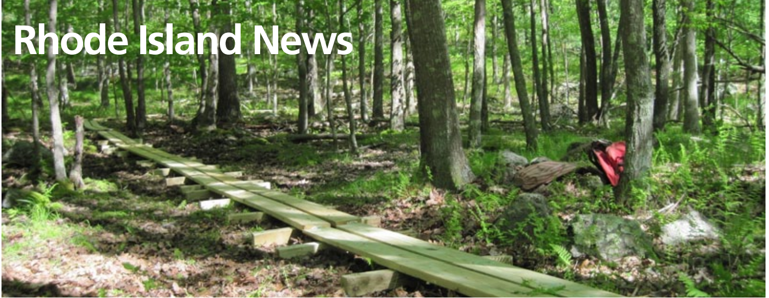
Tillinghast Pond Management Area Trails