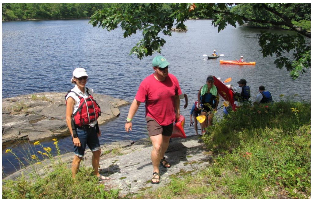
Androscoggin River Source to the Sea Canoe Trek.