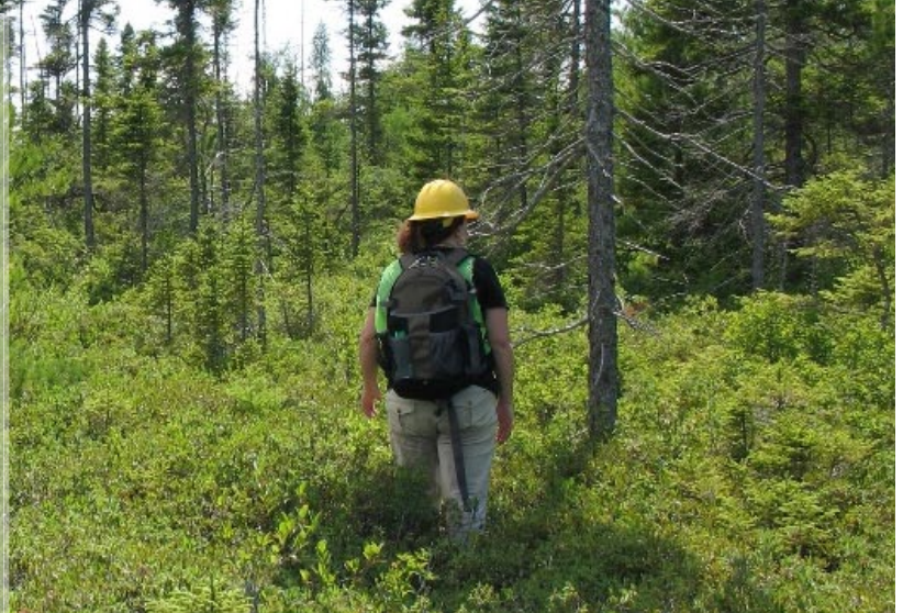
Exploring the heath in Trenton, a possible site for an educational boardwalk.