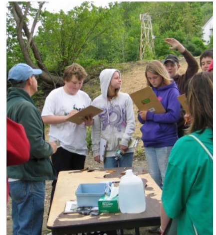
On National Trails Day, all seventh graders in Jay and Livermore Falls participated in educational activities about the Androscoggin River.

Just two years after this group formed, the 3-mile Riverfront School Trail is well on its way. The State Department of Conservation finalized a deal with Pan Am to purchase a critical rail right-of-way that will extend the Whistle Stop Trail into the heart of downtown. A successful grant application has resulted in engineering for another section of the trail. Otis Mill, at the center of the Riverfront School Trail, is hosting a pedestrian riverside trail as well as a railside ATV and snowmobile trail. The mill owners have also created a hand-carry boat launch and hosted several community paddling events. For the first time in many years, people are returning to the Androscoggin River.