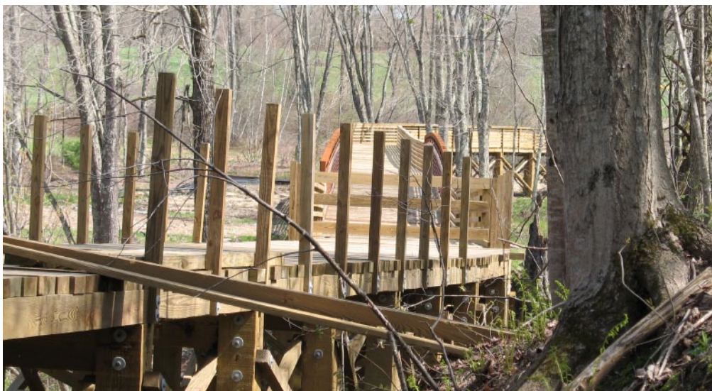
The new bicycle and pedestrian bridge over Sandy Stream, shown here under construction, connects Unity Village with Unity College.

Assist with youth engagement, trail planning, conference organization, fundraising, and building organizational capacity.