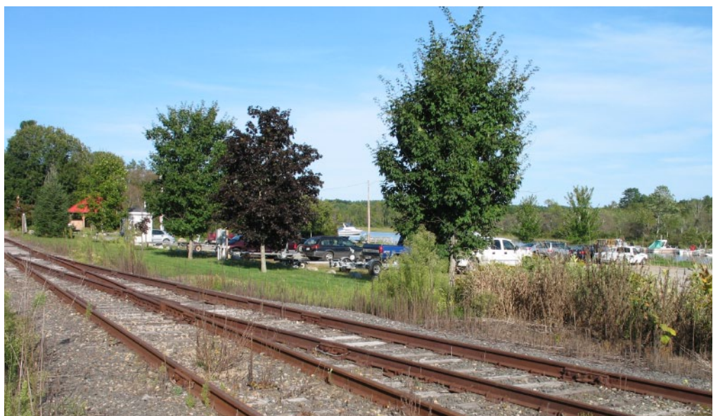
The proposed route of the Merrymeeting Trail will pass beside these railroad tracks in Bowdoinham.

Cultivate in Maine colleges and universities an institutionalized