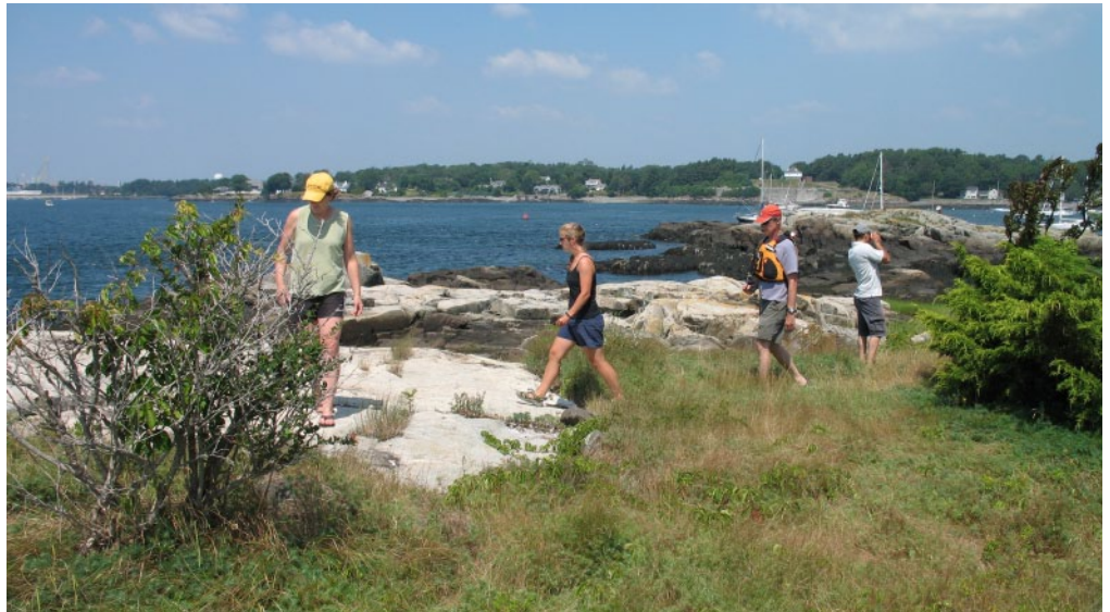
Maine Island Trail Association volunteers and staff visit an island on Maine's southern coast.

A trail system that provides access to 217 acres of conservation land in Trenton and connects it to the Acadia Gateway Center.