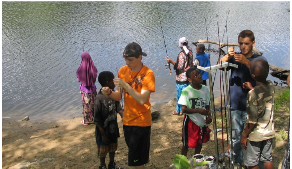
Kids Fishing Day on the Androscoggin River in downtown Lewiston

Connect in-town neighborhoods to the river through events and trail improvements.