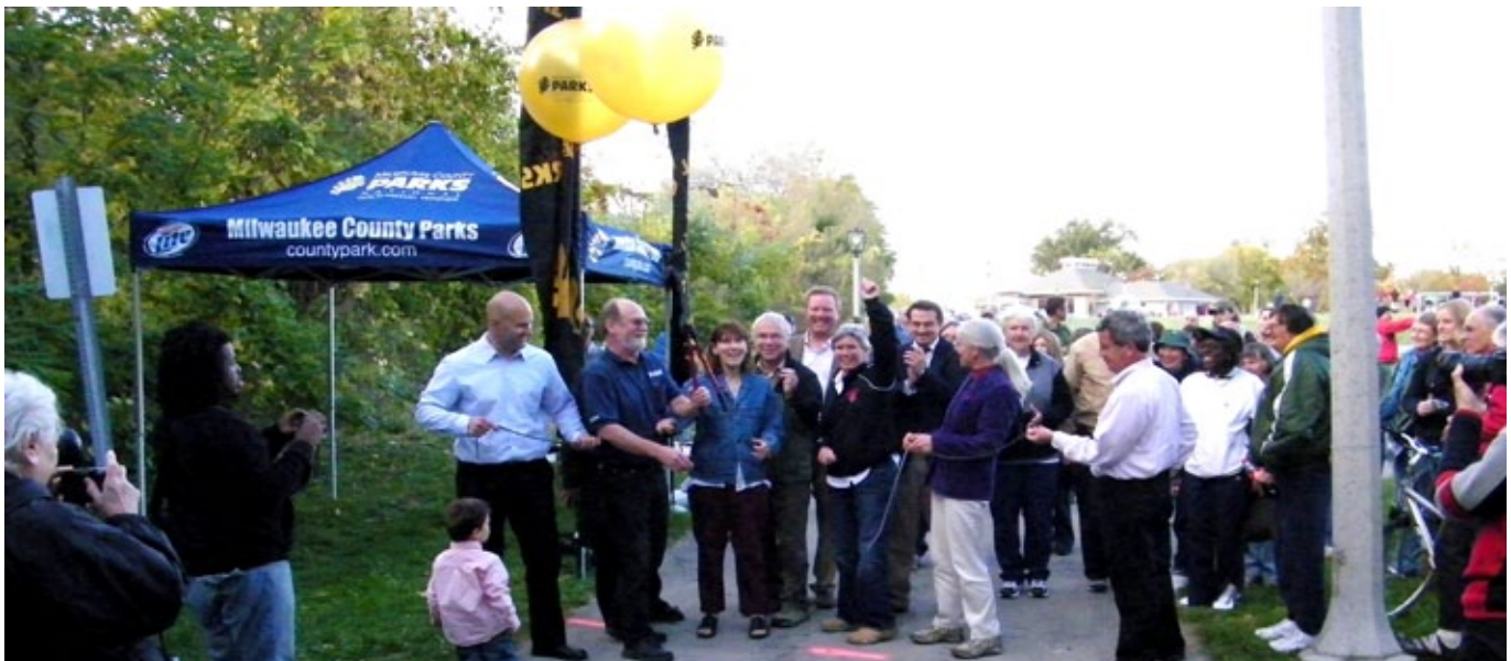
Celebrating the Beer Line Trail Opening with the Cutting of the Bike Chain!

An updated concept plan for an interconnected trail system on the county grounds. Active engagement of the various facility managers and advocacy groups in the trail planning process