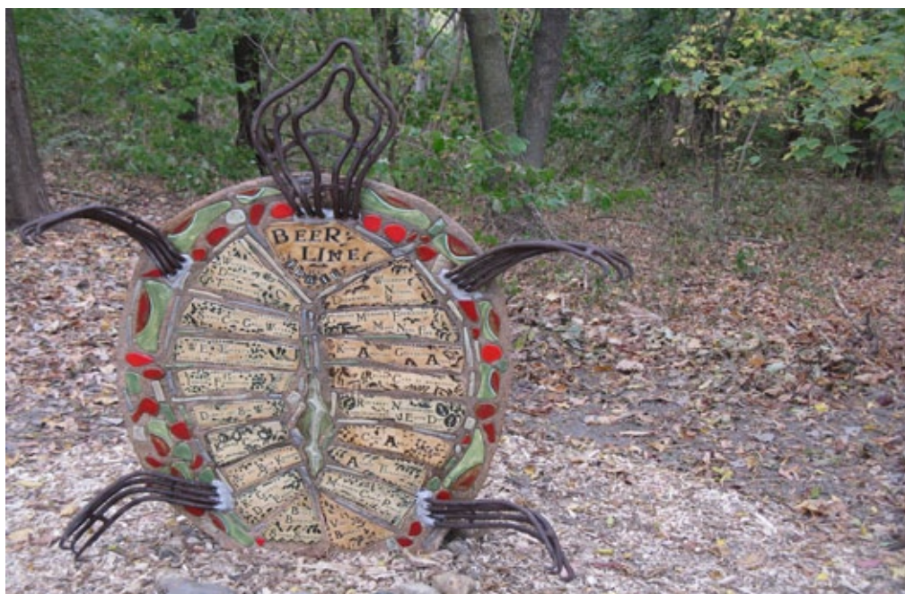
Art along the Beer Line Trails