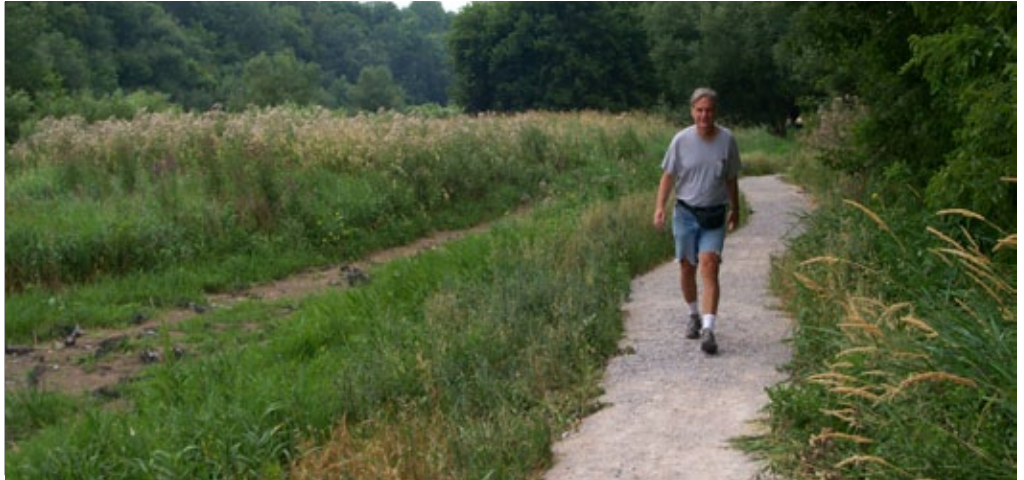
Hiking the East Bank Trail