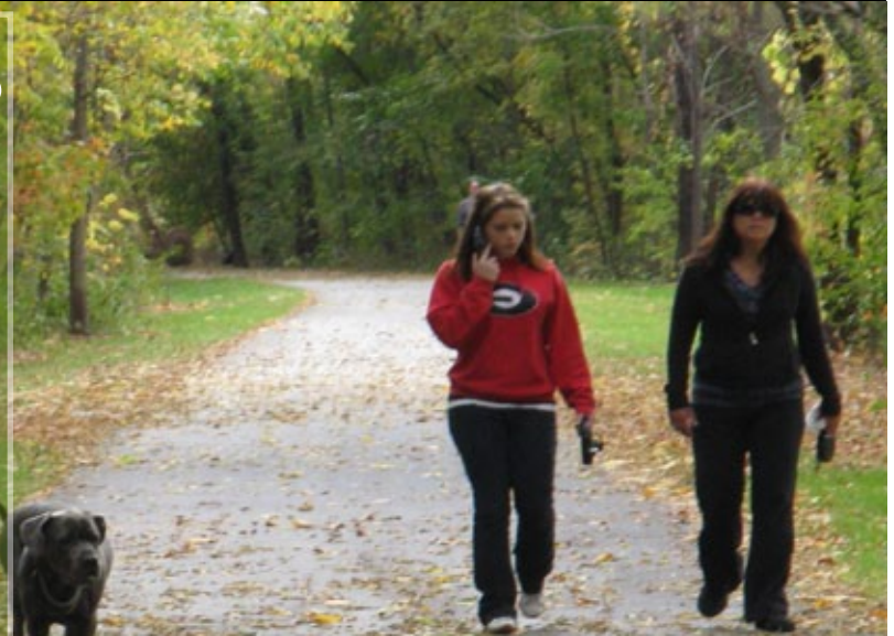
Enjoying Milwaukee's Beerline Trail