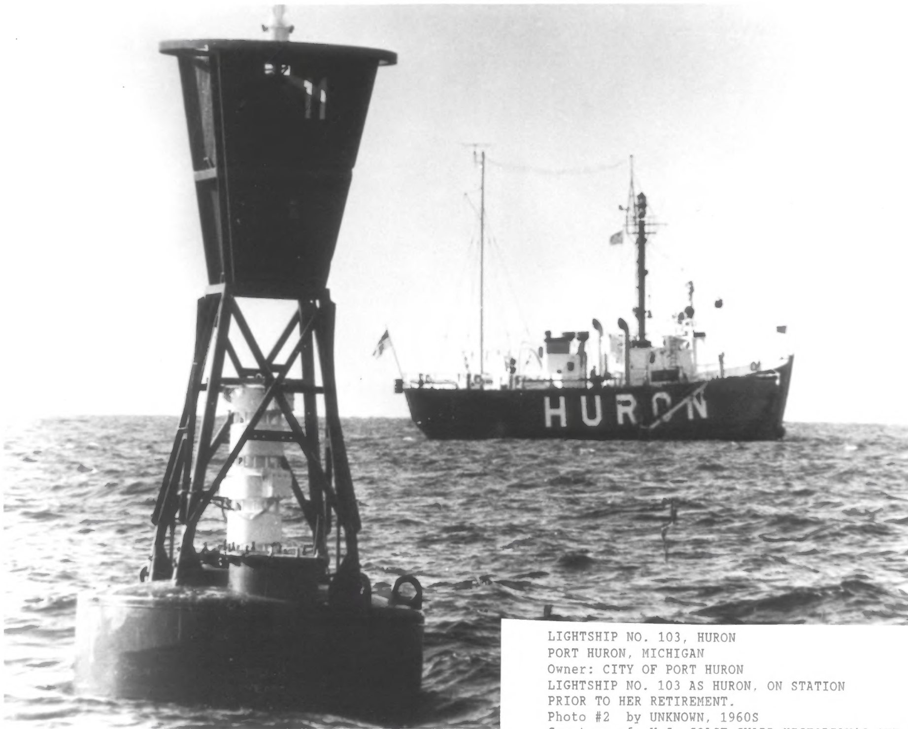
LIGHTSHIP NO. 103, HURON PORT HURON, MICHIGAN Owner: CITY OF PORT HURON LIGHTSHIP NO. 103 AS HURON, ON STATION PRIOR TO HER RETIREMENT. Photo #2 by UNKNOWN, 1960S Courtesy of: U.S. COAST GUARD HISTORIAN'S OFF