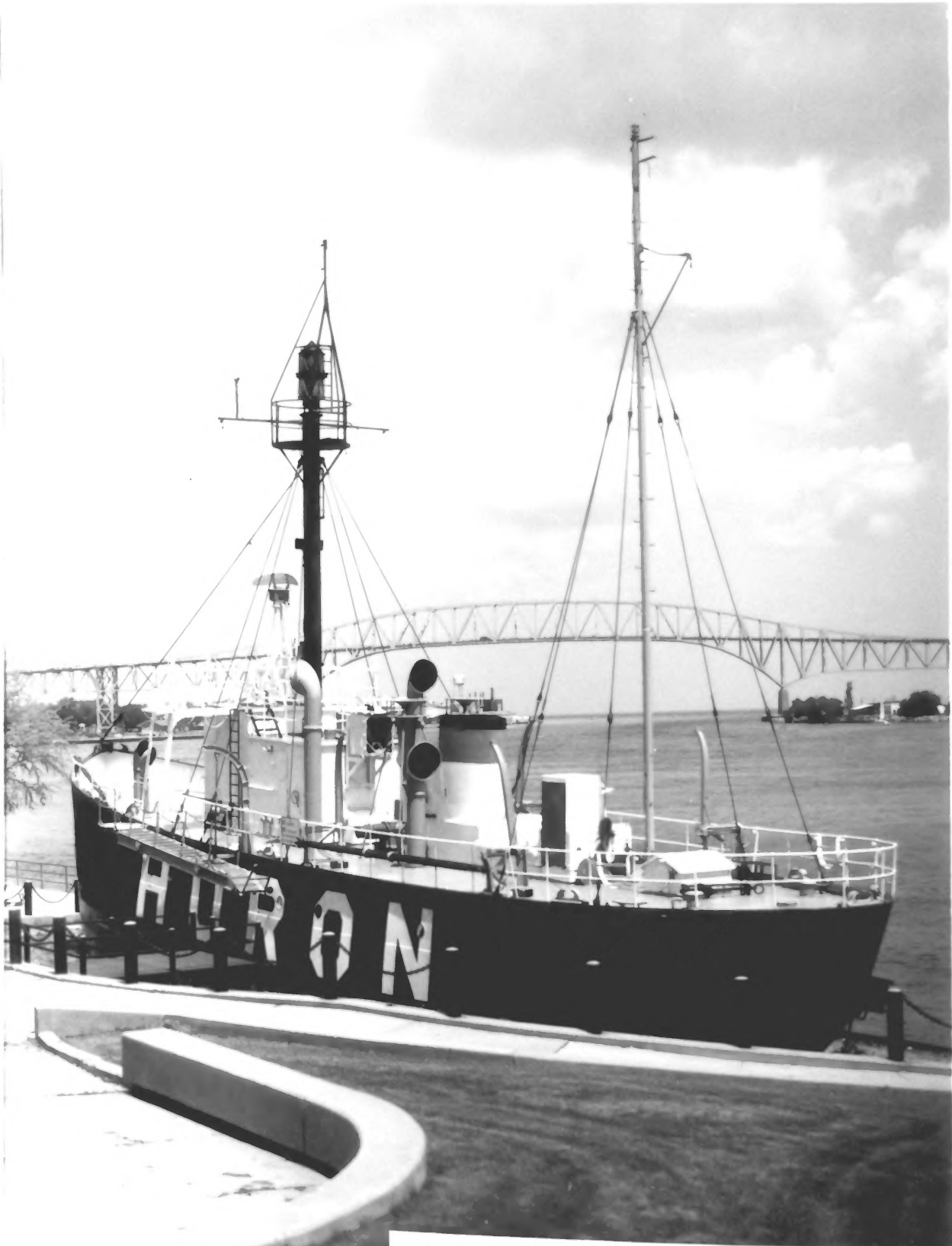
LIGHTSHIP NO. 103, HURON PORT HURON, MICHIGAN Owner: CITY OF PORT HURON LIGHTSHIP NO. 103 IN HER DRY BERTH ON THE BANKS OF THE ST. CLAIR RIVER. Photo #3 by JAMES P. DELGADO, 1989 Courtesy of: NATIONAL PARK SERVICE