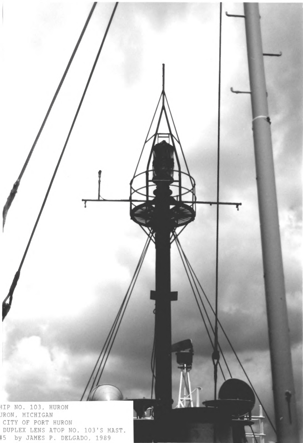
LIGHTSHIP NO. 103, HURON PORT HURON, MICHIGAN Owner: CITY OF PORT HURON 375-MM DUPLEX LENS ATOP NO. 103'S MAST. Photo #5 by JAMES P. DELGADO, 1989 Courtesy of: NATIONAL PARK SERVICE