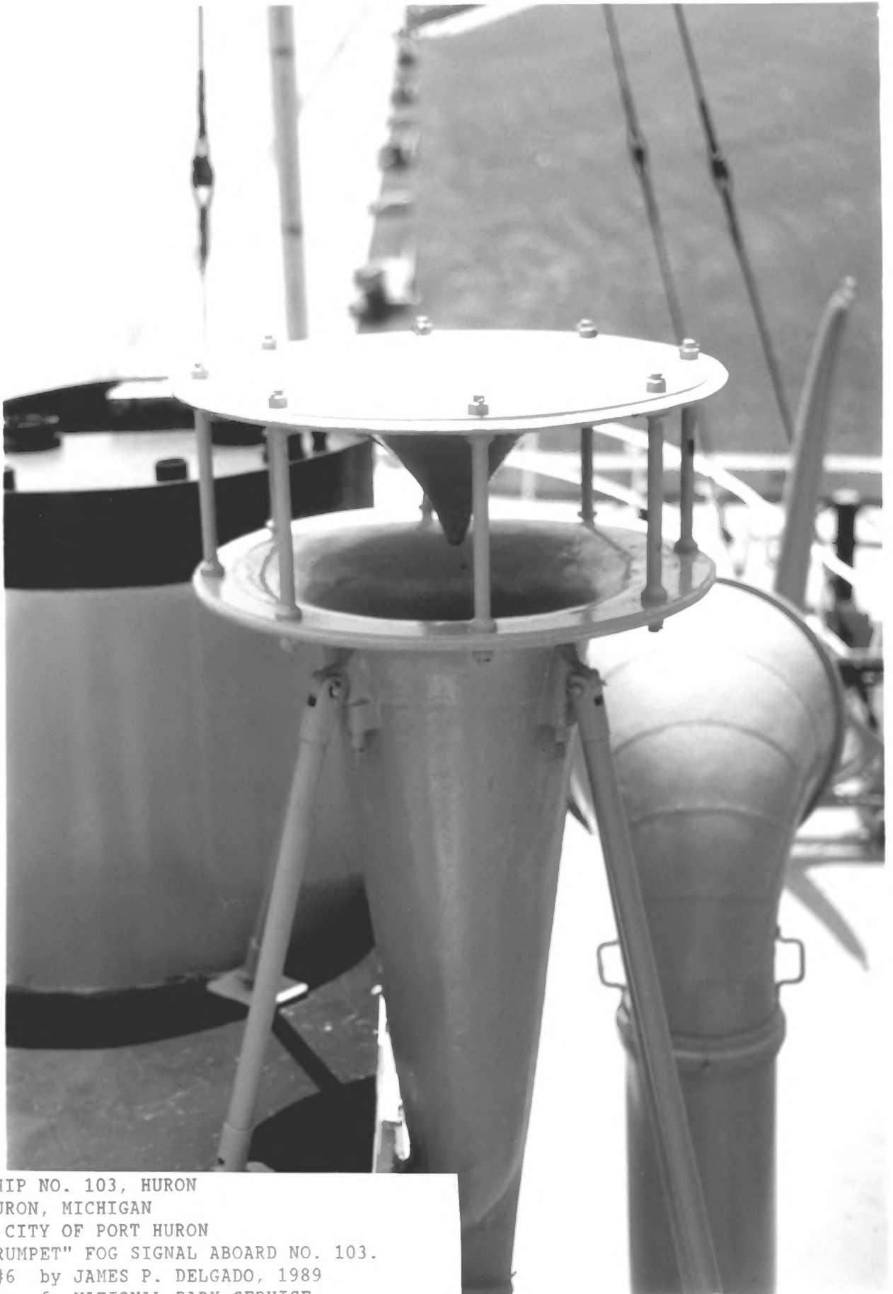
LIGHTSHIP NO. 103, HURON PORT HURON, MICHIGAN Owner: CITY OF PORT HURON F2T "TRUMPET" FOG SIGNAL ABOARD NO. 103. Photo #6 by JAMES P. DELGADO, 1989 Courtesy of: NATIONAL PARK SERVICE