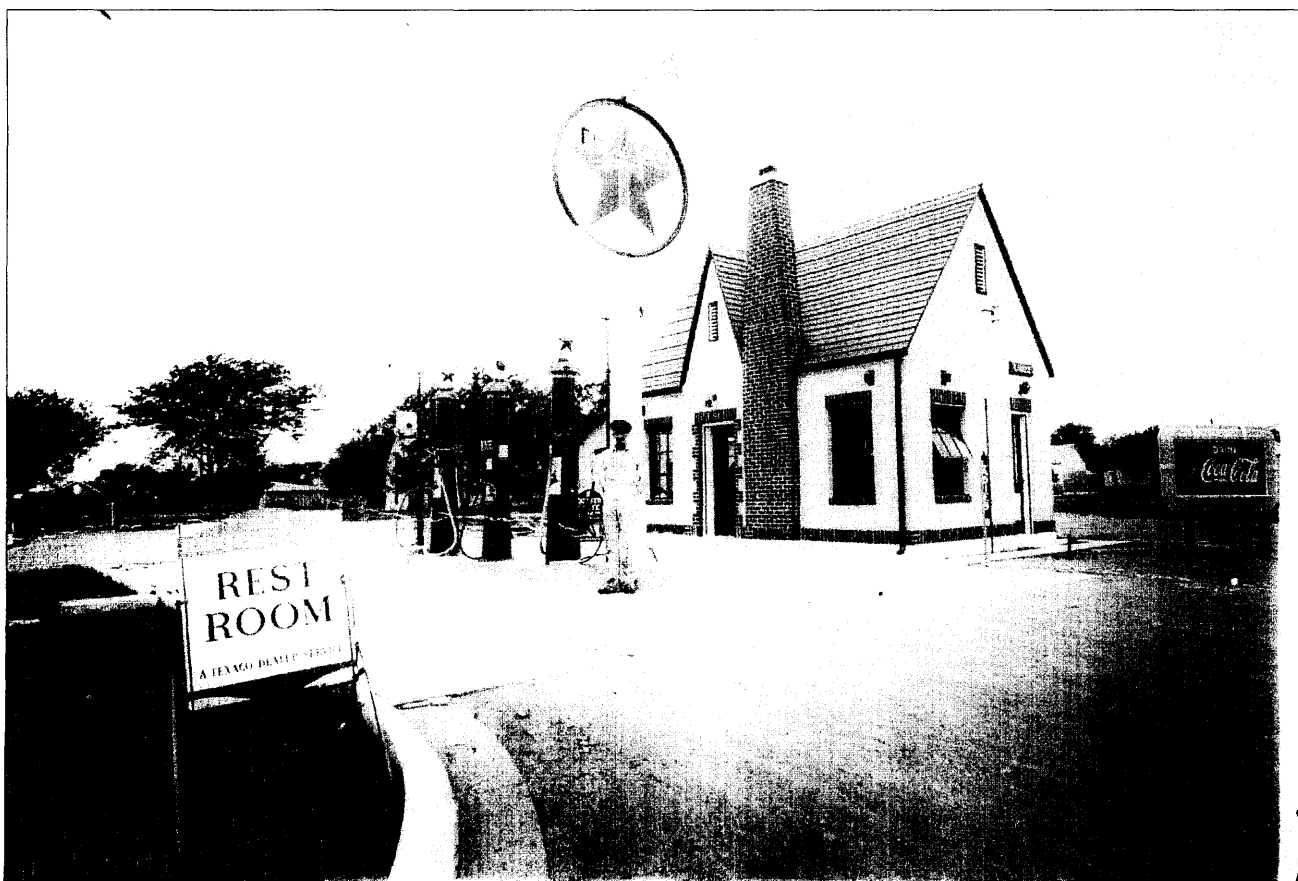
Deerfield Texaco Service Station, 1930s

Deerfield Texaco Service Station Deerfield, Kearny County, Kansas