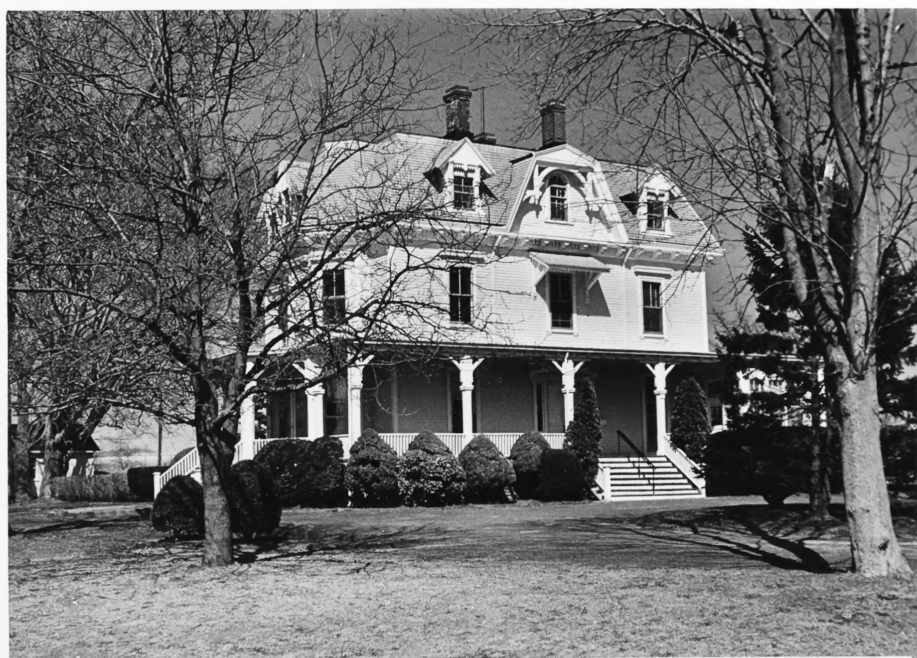
Commanding Officer's Quarters, Fort Adams Historic District Newport, Rhode Island