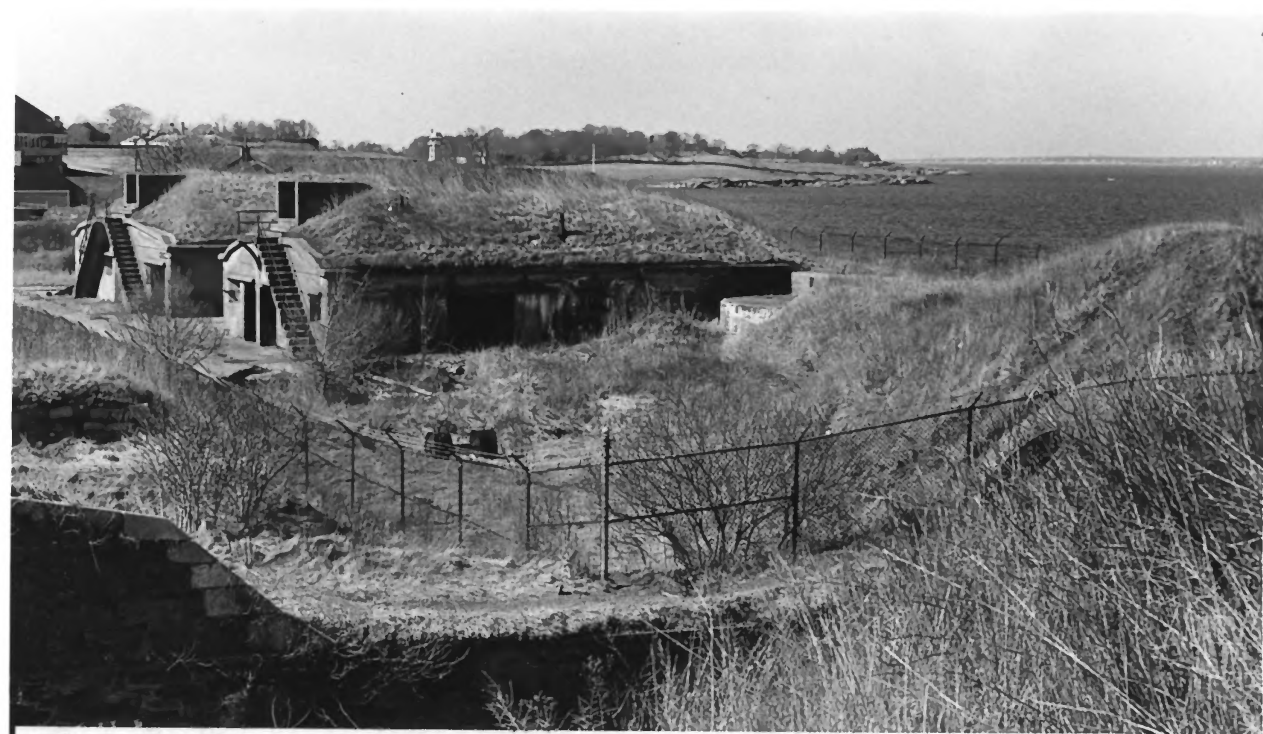
Battery Bankhead, Fort Adams Historic District