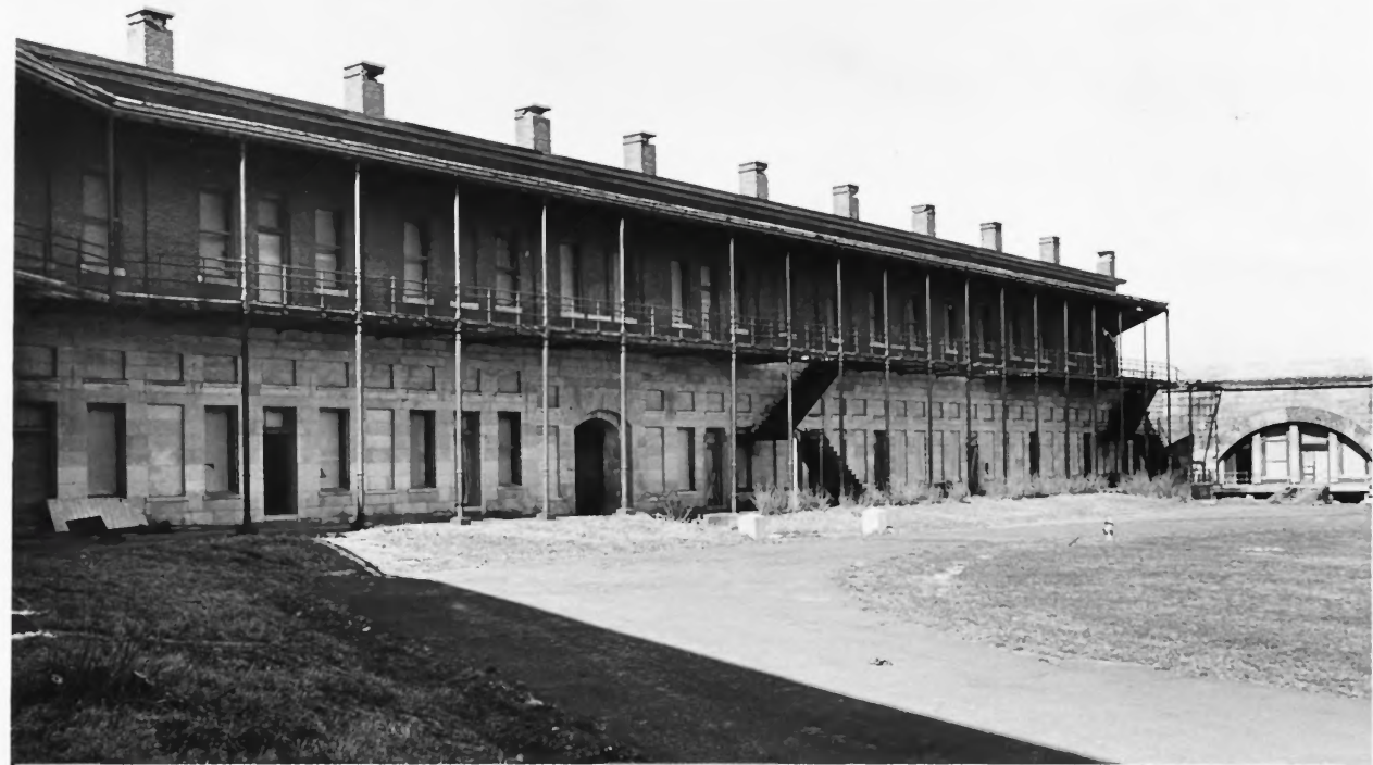
Main Work, Fort Adams Newport, Rhode Island