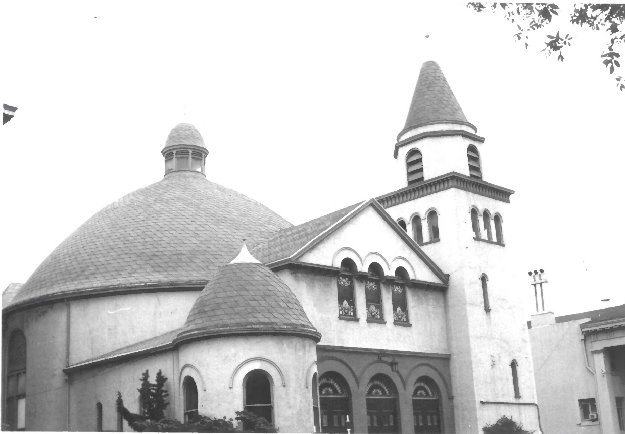
First Baptist Church, San Jose