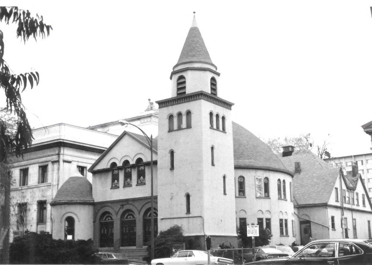
First United Methodist Church, San Jose