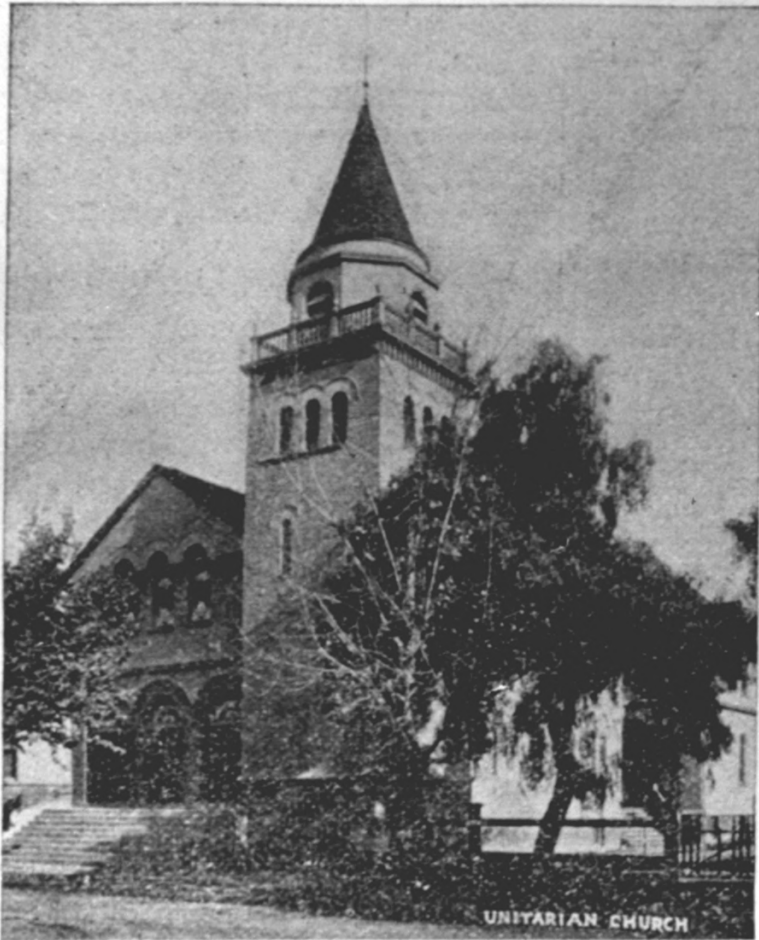
FIRST UNITARIAN CHURCH, SAN JOSE, CAL.