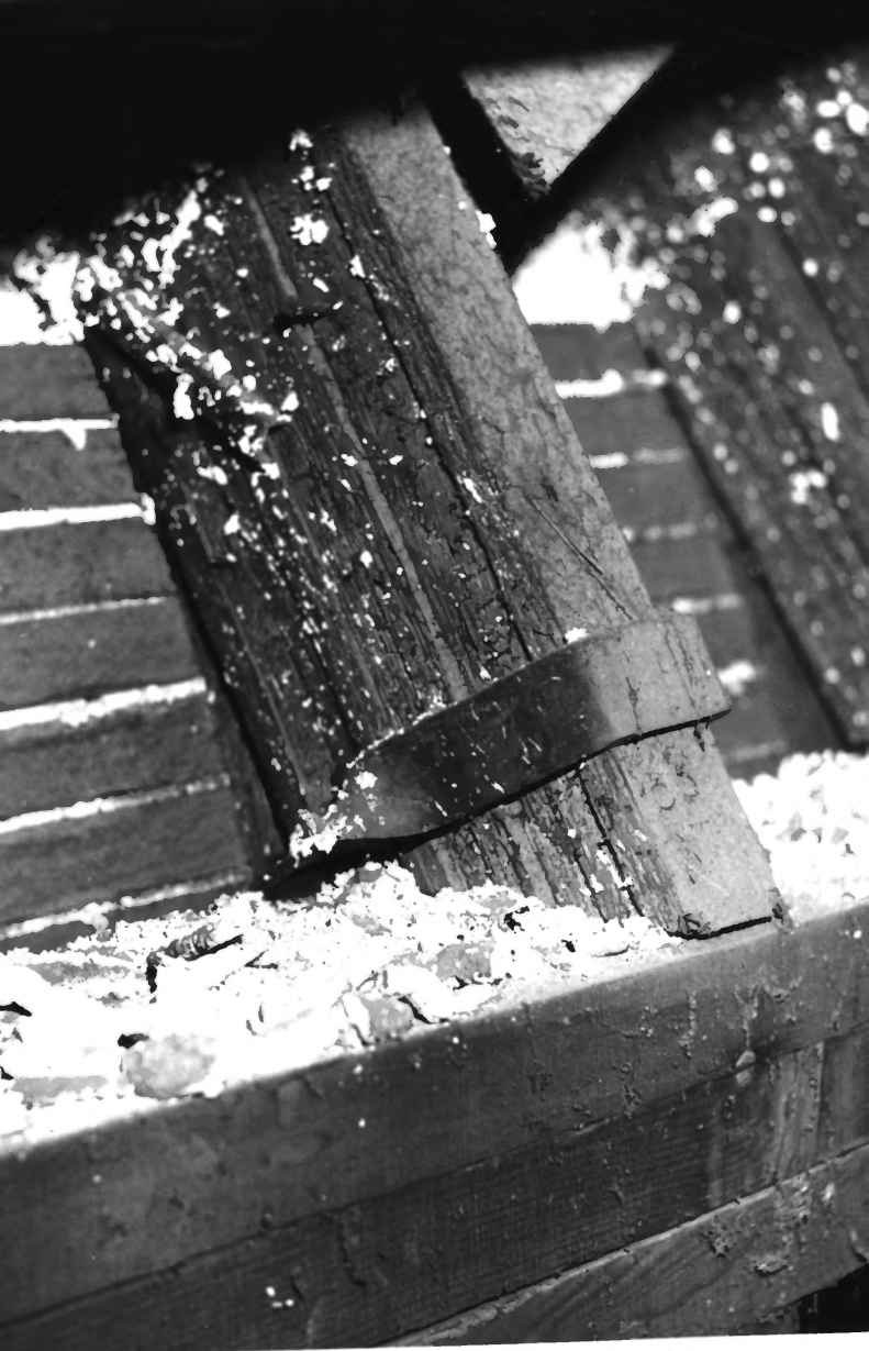
First Unitarian Church of San Jose