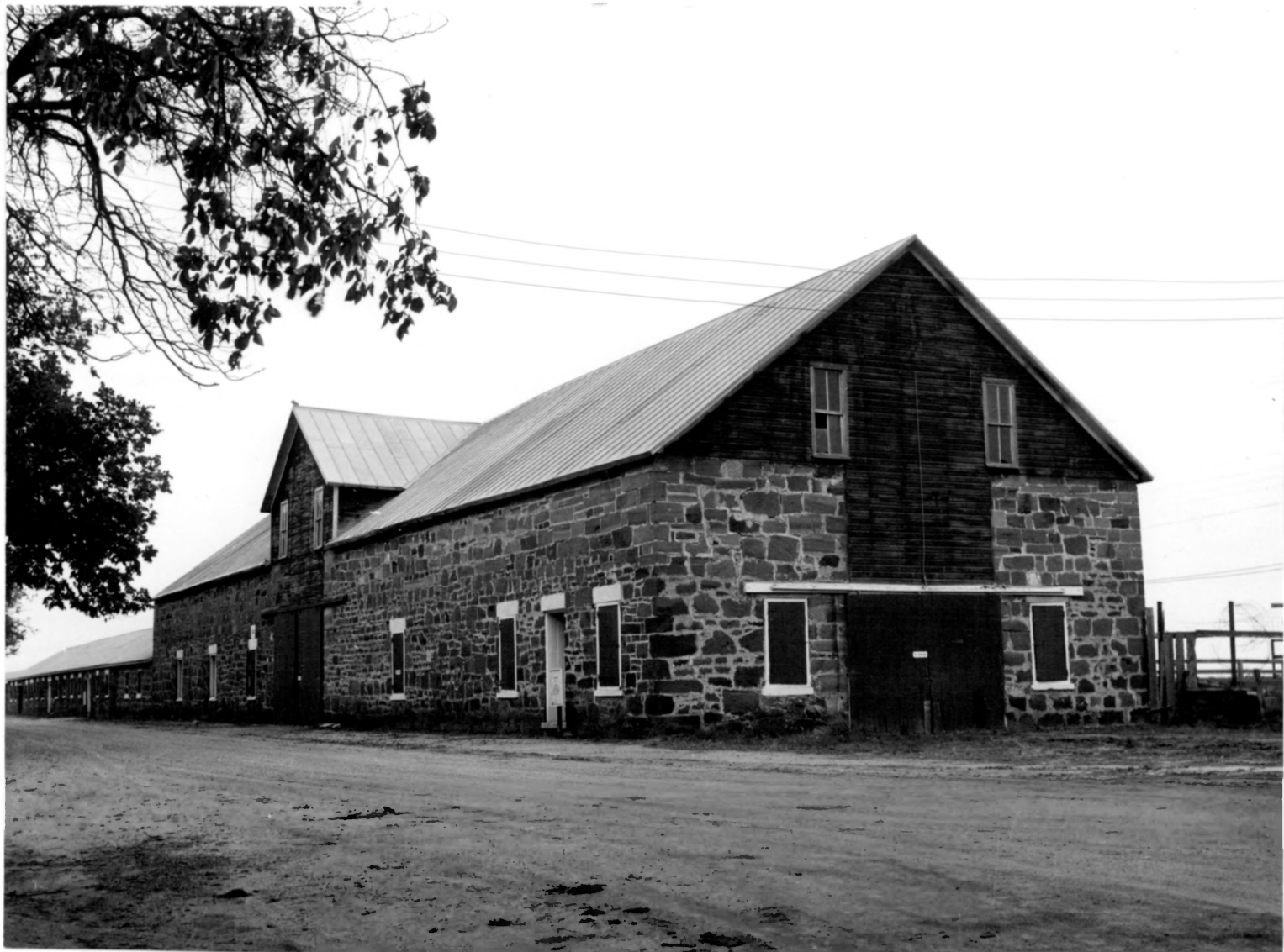
BARN at FORT LARNED. This structure has been converted from the old commissary storehouse at the post.