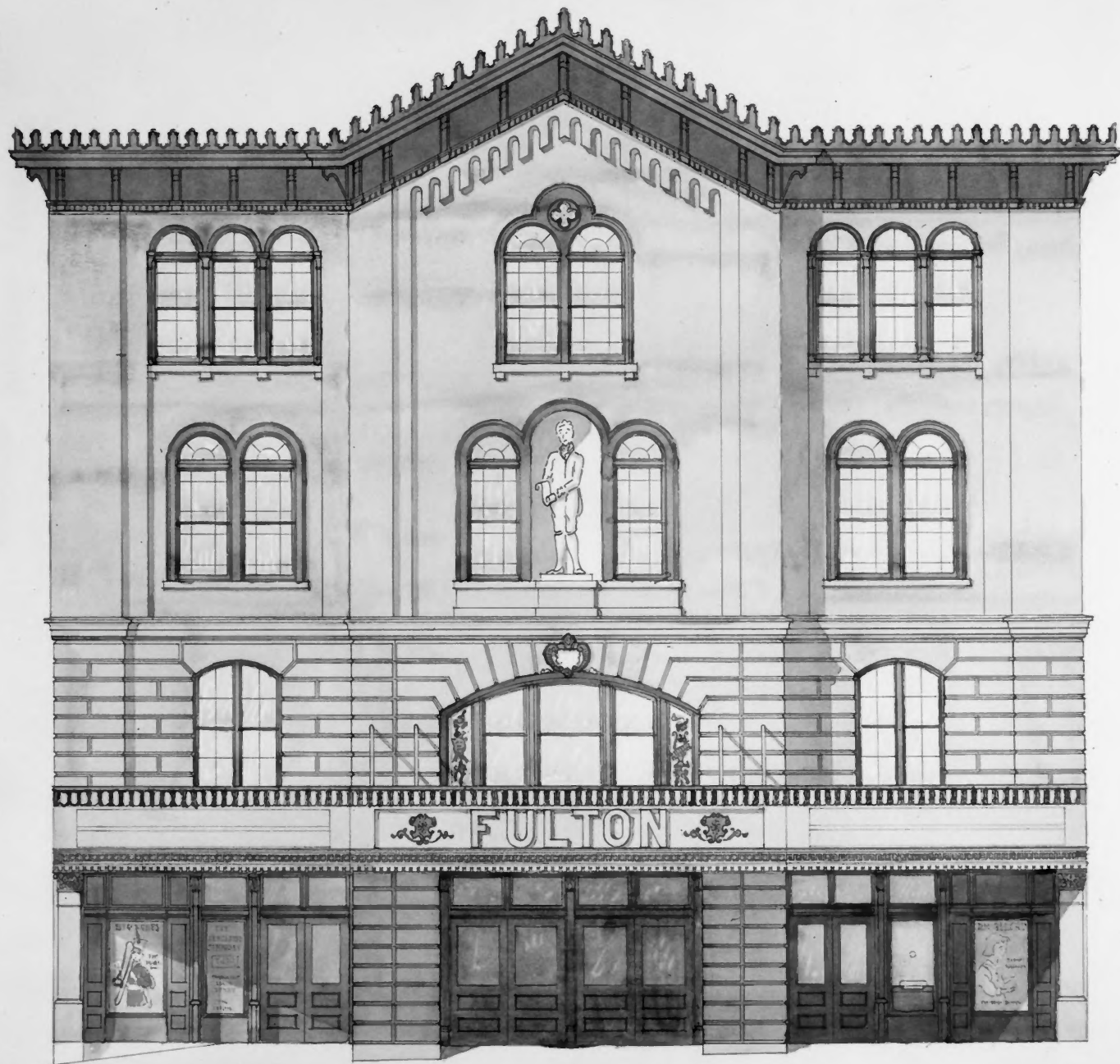
· FACADE · RENOVATIONS · · FULTON · OPERA · HOUSE ·