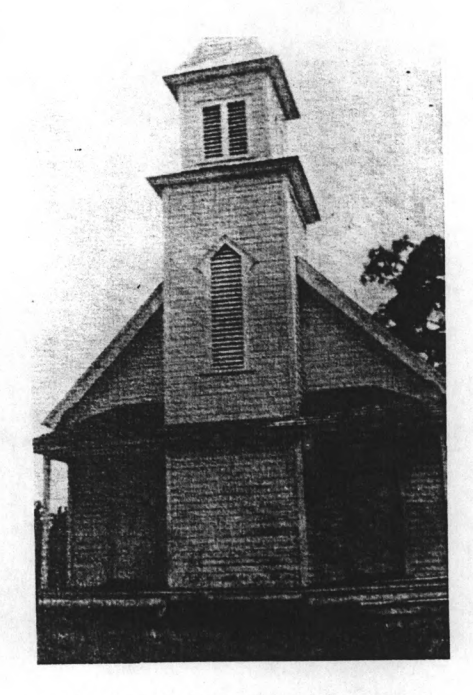
Woodbine Methodist Church, built in 1896.

Woodbine Historic District Woodbine, Camden County, Georgia