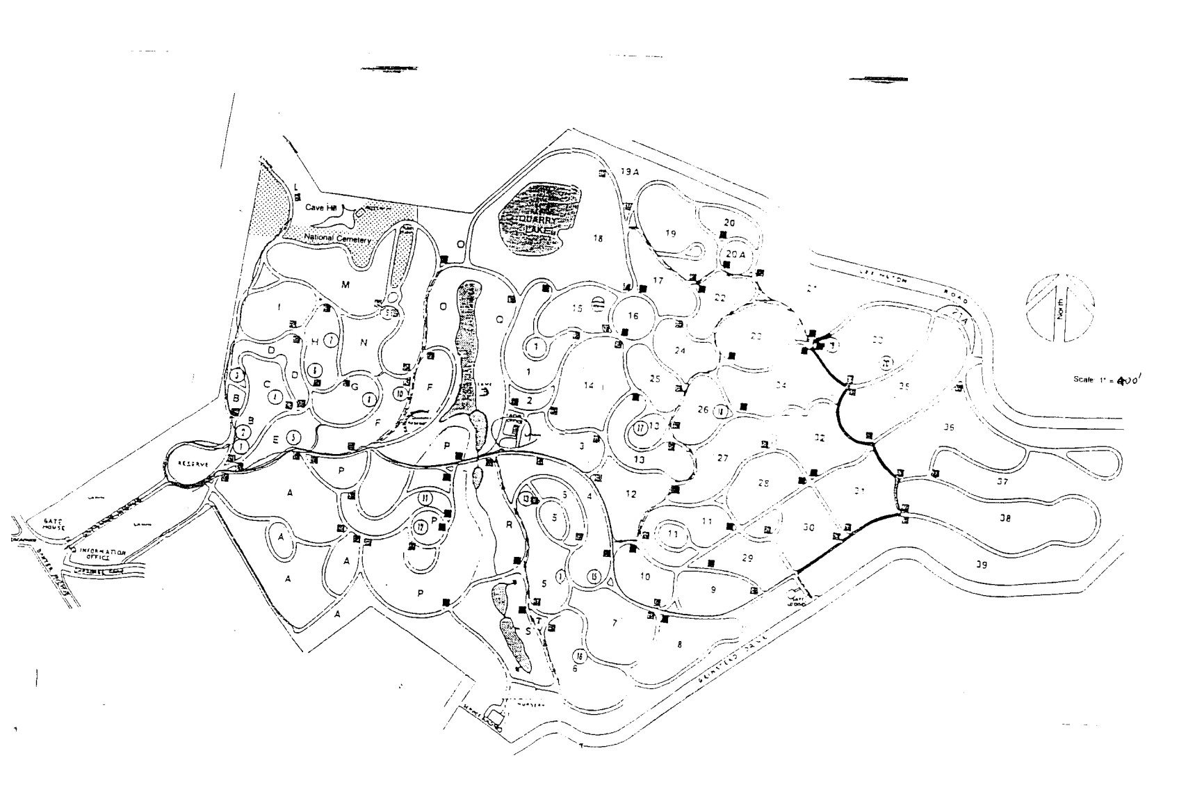
Base Map Cave Hill National Cemetery Jefferson County, Kentucky