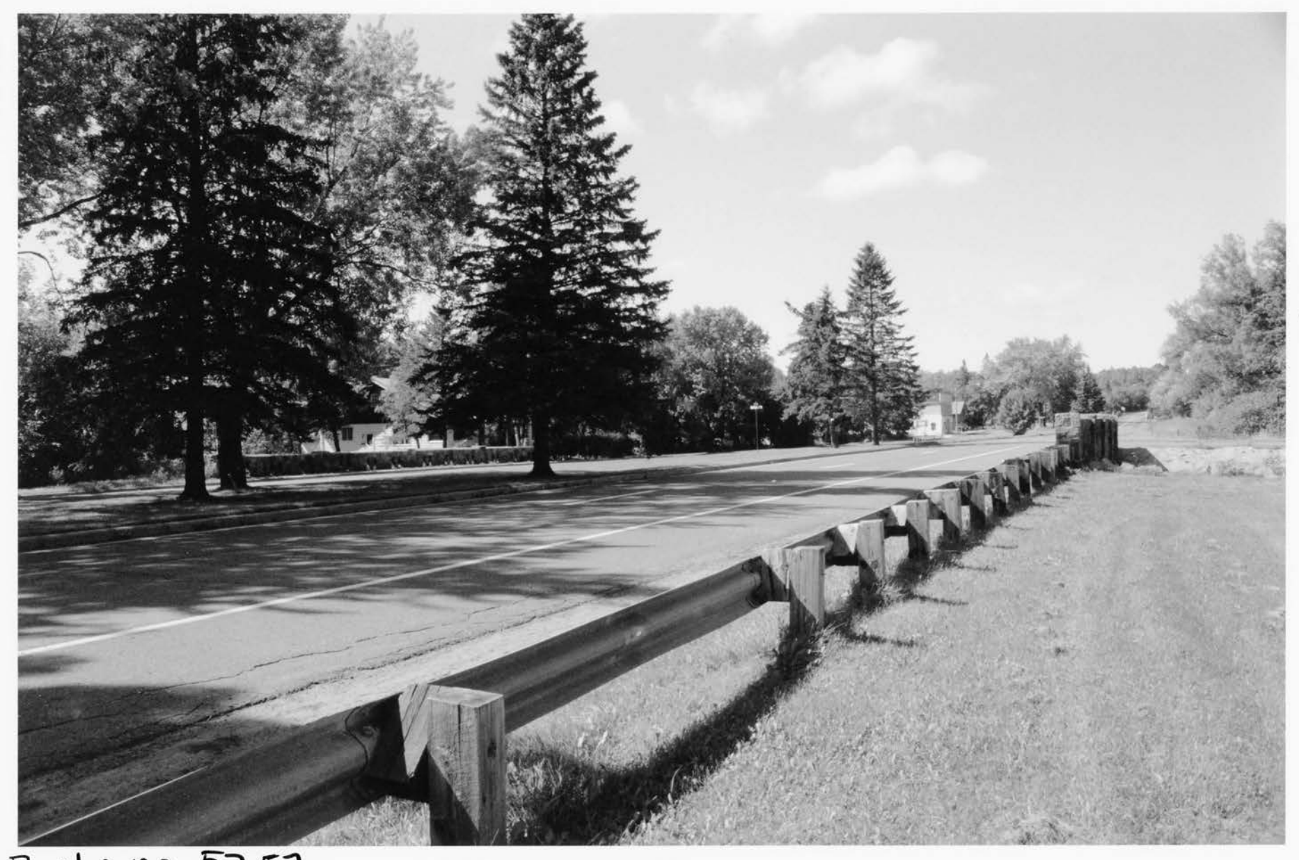
Bridge no. 5757 Mn Hwy. 23 over mission Creek, Daluth 5t. Louis Co., Mn 013072-8