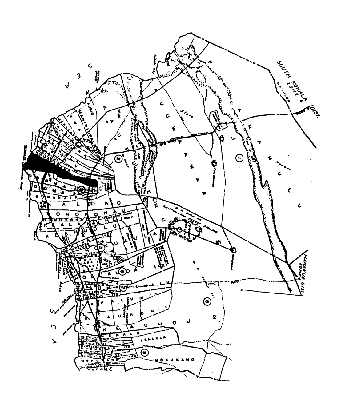
Figure 2. Map of North Kona District, with its constituent community (ahupua'a) lands. Kalaoa ahupua'a is shaded black.