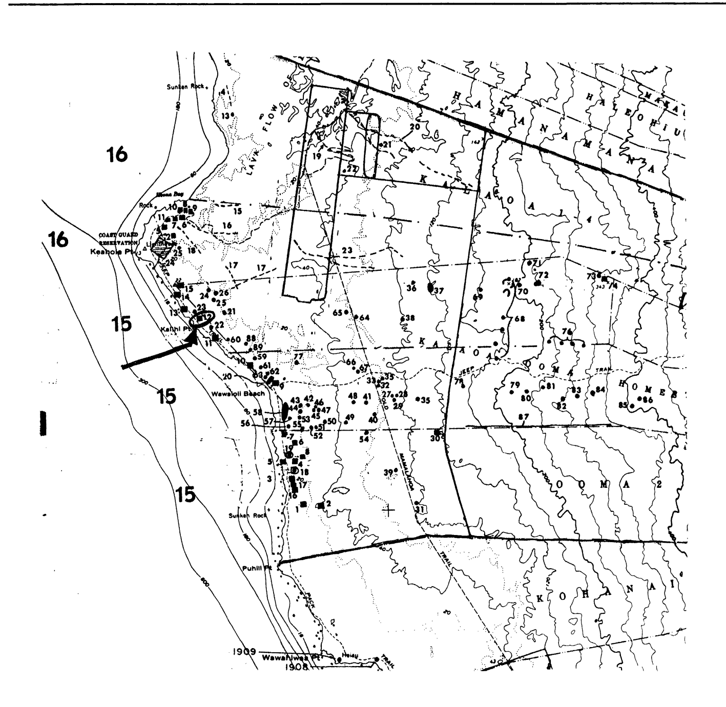
Figure 3. Map of Kalaoa and 'O'oma Ahupua'a, showing the site's location.