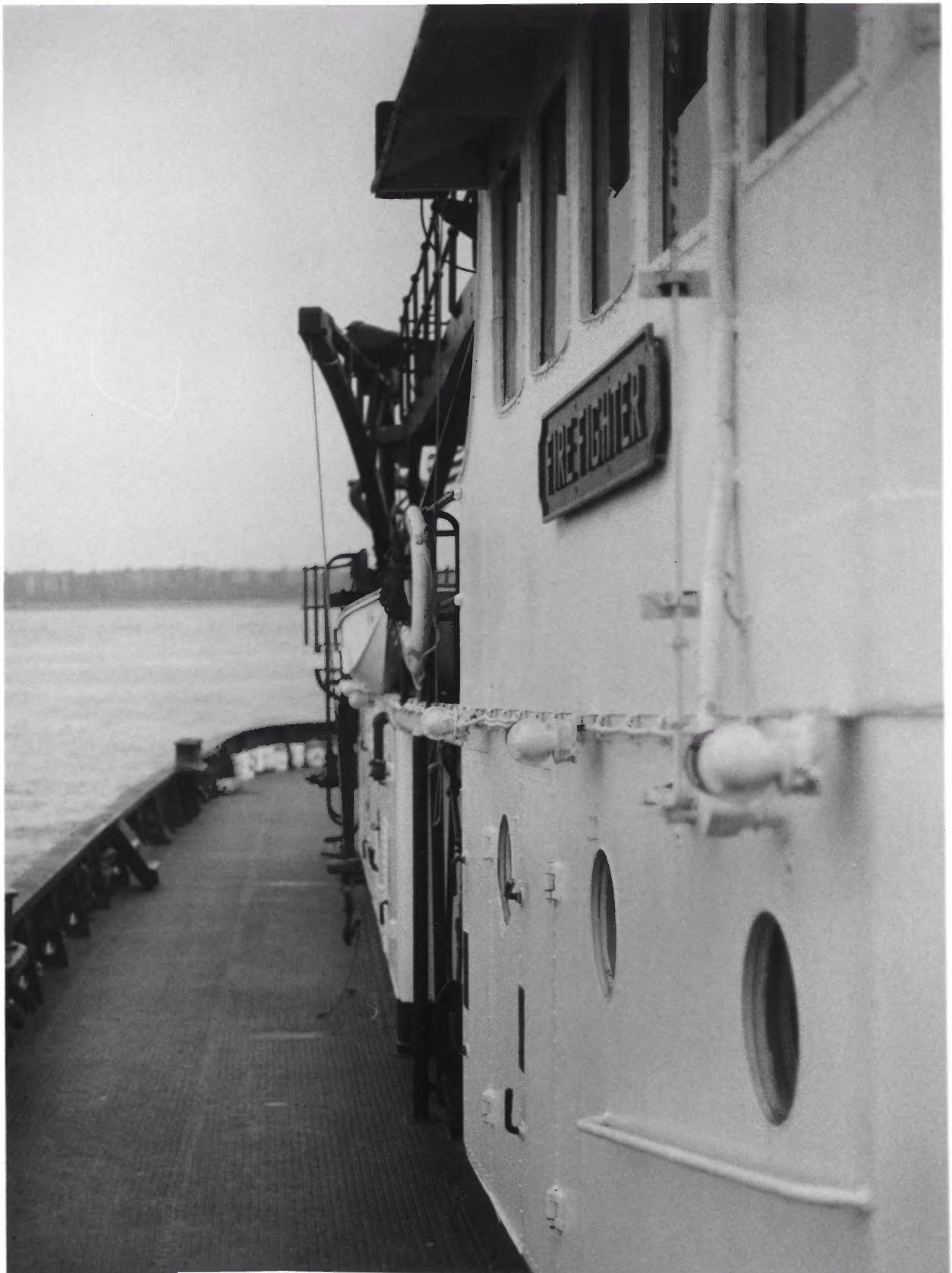
FIREBOAT FIRE FIGHTER NEW YORK, NEW YORK Owner: FIRE DEPARTMENT OF NEW YORK VIEW AFT ON MAIN DECK, STARBOARD BEAM. Photo #4 by JAMES P. DELGADO, 1988 Courtesy of: NATIONAL PARK SERVICE