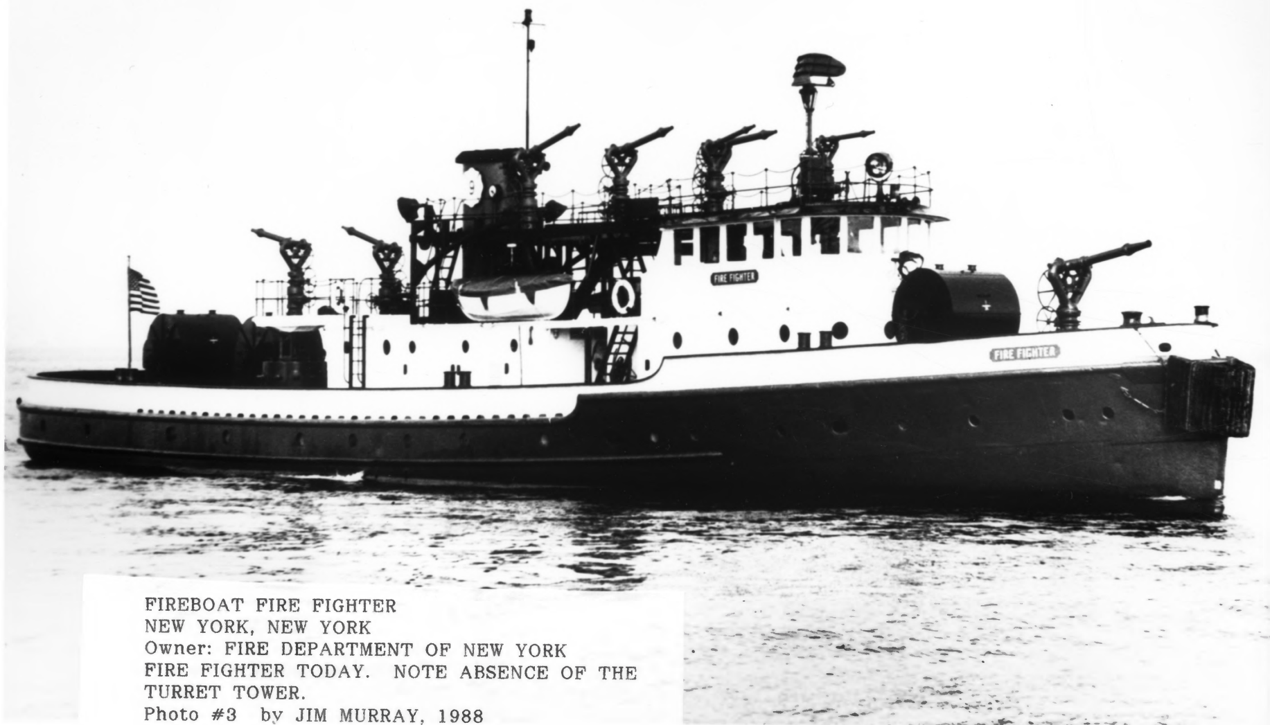
FIREBOAT FIRE FIGHTER NEW YORK, NEW YORK Owner: FIRE DEPARTMENT OF NEW YORK FIRE FIGHTER TODAY. NOTE ABSENCE OF THE TURRET TOWER. Photo #3