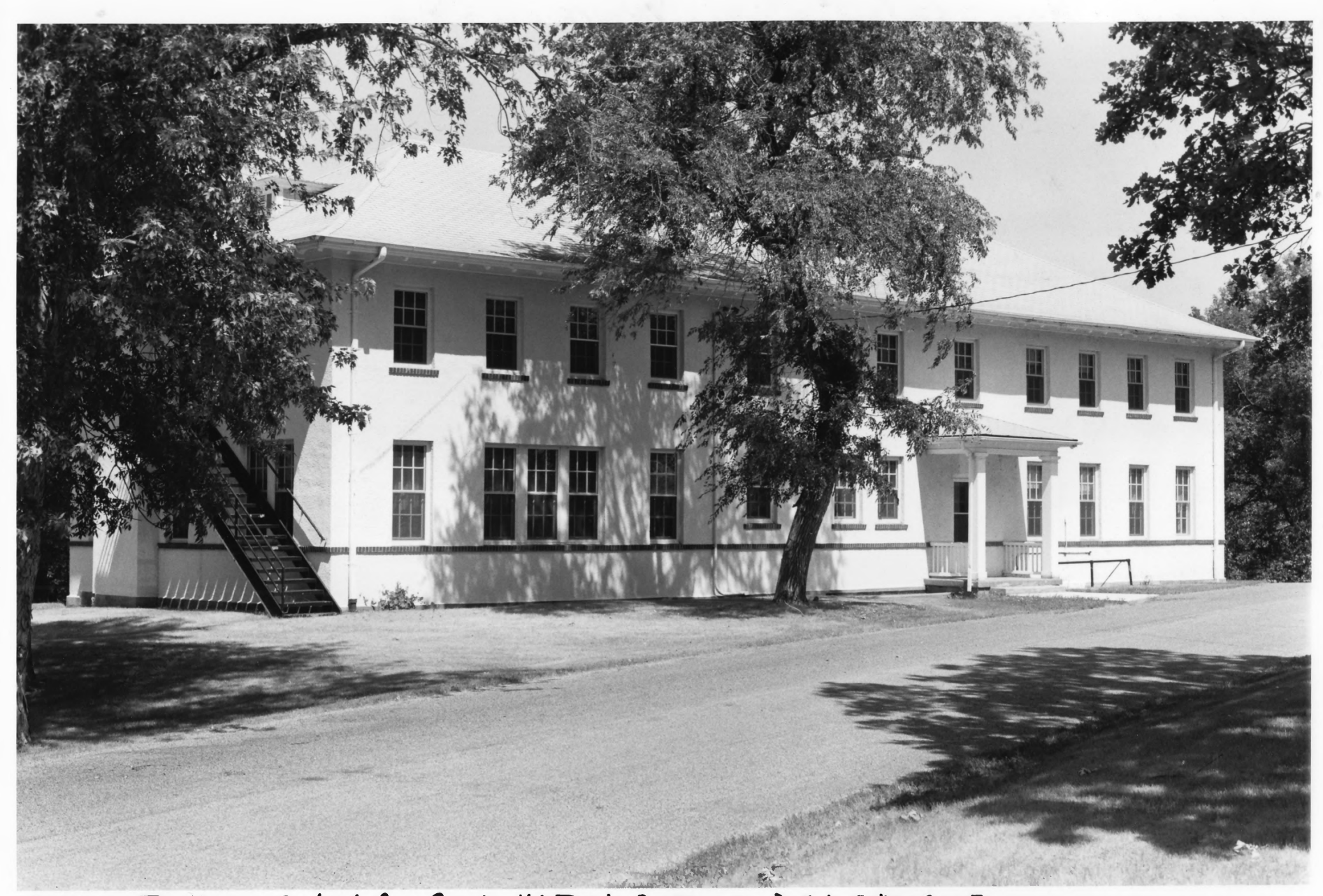
MinnesoTA Home School for Girls Historic District - Petit Cottage -15 STEARNS County, MN. 09909-12