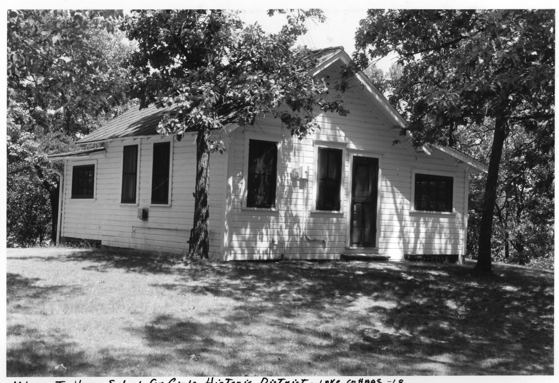
MinnesoTA Home School for Girls HisToric DisTrict - LAKE COHAGE -18 STEARNS, COUNTY, MN. 09906-10