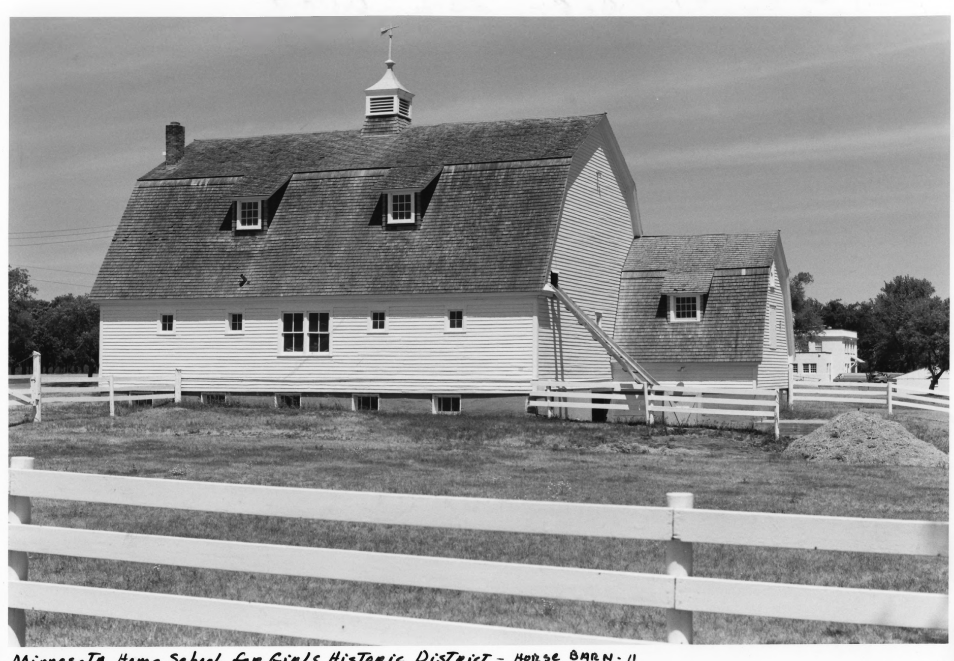
MinnesoTA Home School for Girls HisToric DisTrict - Horse BARN. 11 STEARNS COUNTY, MN. 09909-22