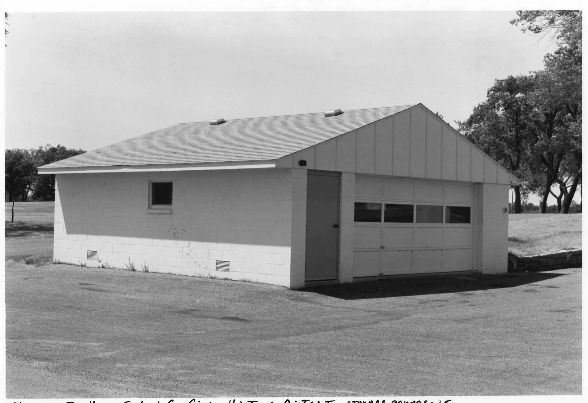
Minnesota Home School for Girls Historic District - Storage garage - 25 STEARNS County, MN. 09909-18