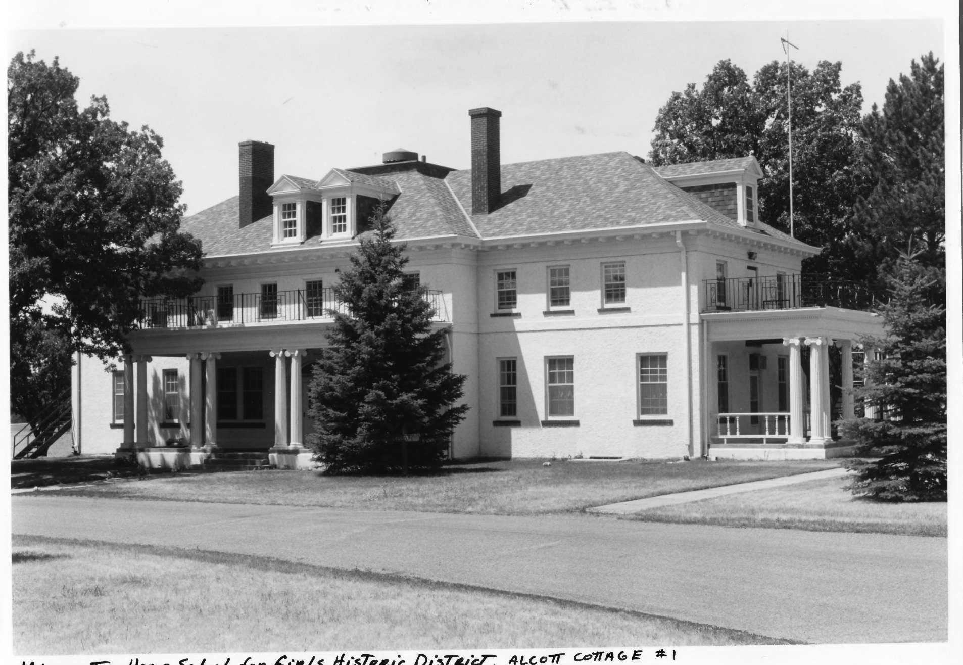
MinnesoTA Home School for Girls HisToric DisTrict, ALCOTT COTTAGE #1 STEAR AS COUNTY, MN. 09906-4