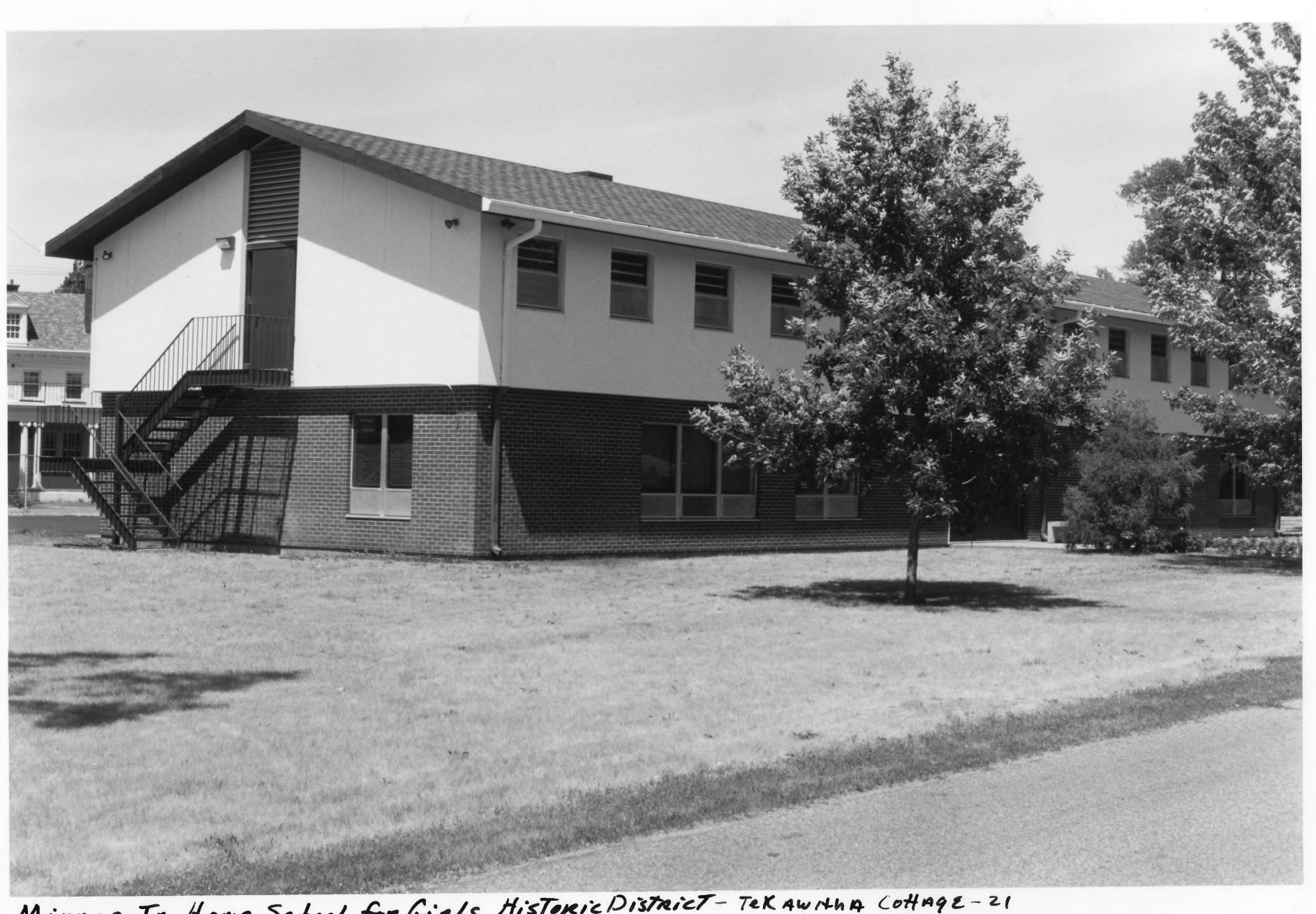
MinnesoTA Home School for Gials HisToric District - Tek AWAHA COHAGE-21 STEARNS County, MN. 09906-2