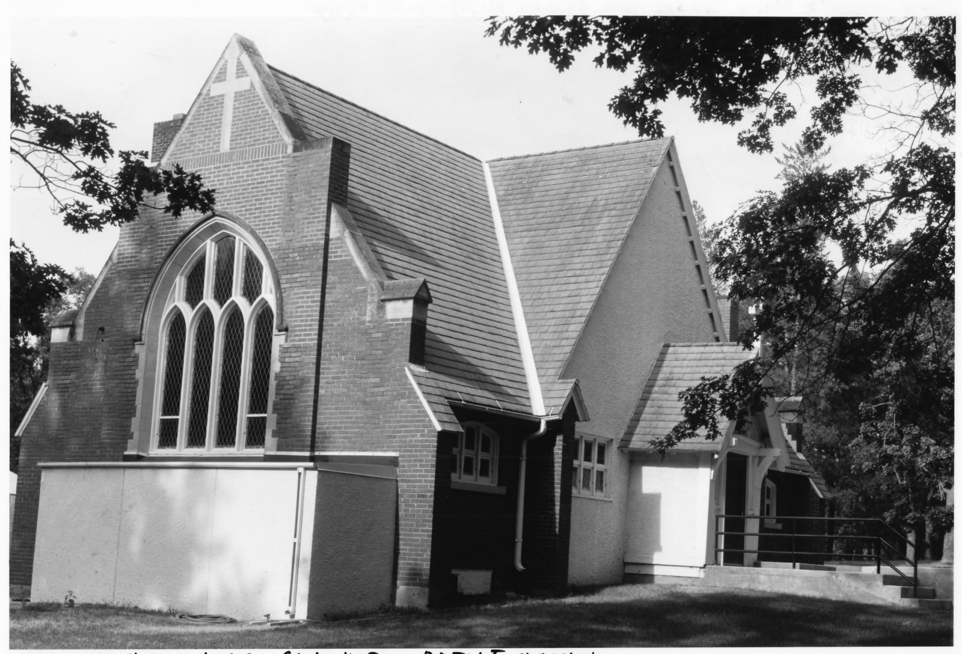
MimnesoTA Home School for Girls HisToric DisTrict - Chapel-4 STEARNS County, MN. 09906-23