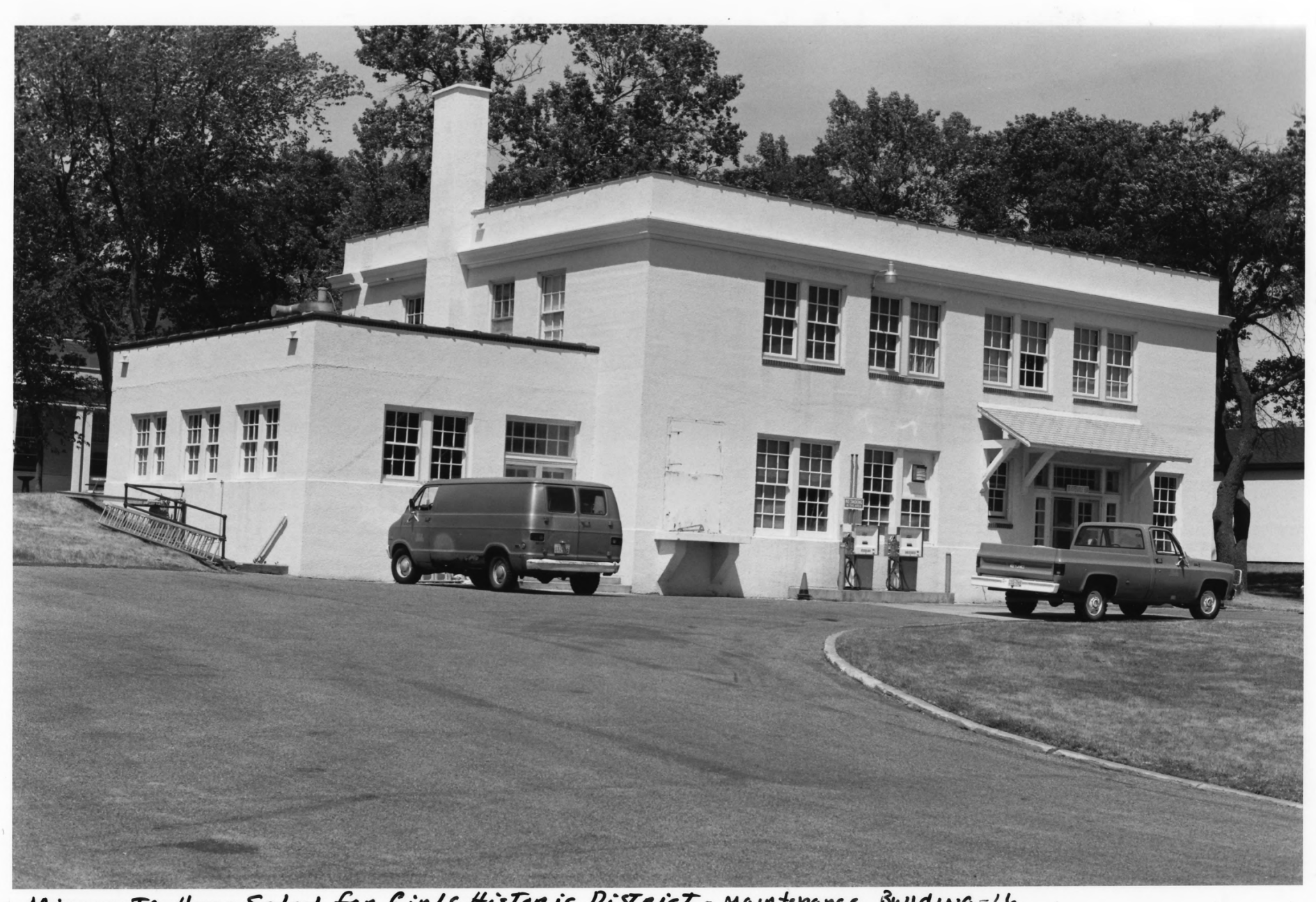
MinnesoTA Home School for Girls Historic District - Maintenance Building-16 STEARNS County, M.D. 09109-16