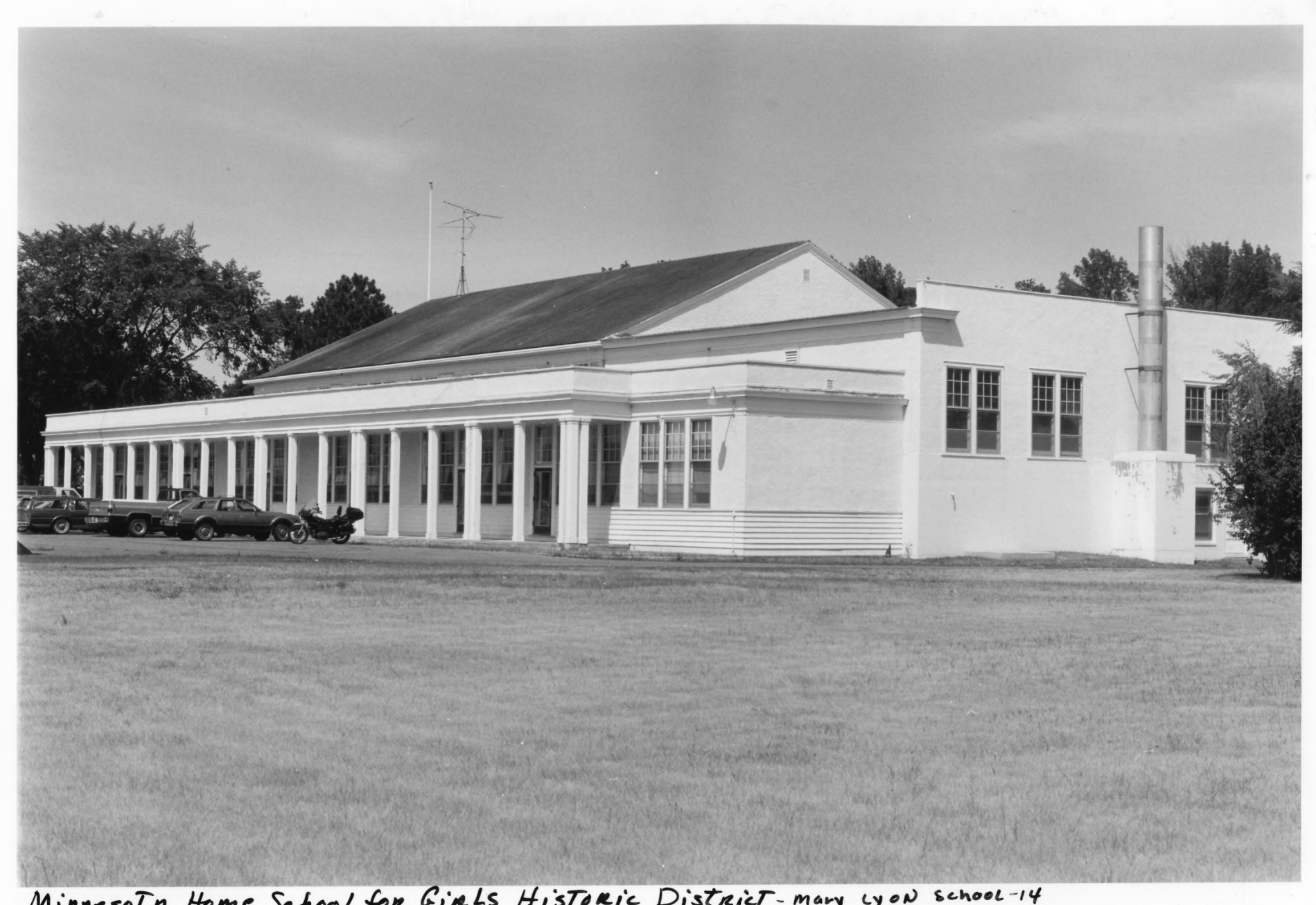
MinnesoTA Home School for Girls Historic District-many Lyon school-14 STEARNS County, MN. 09906-15