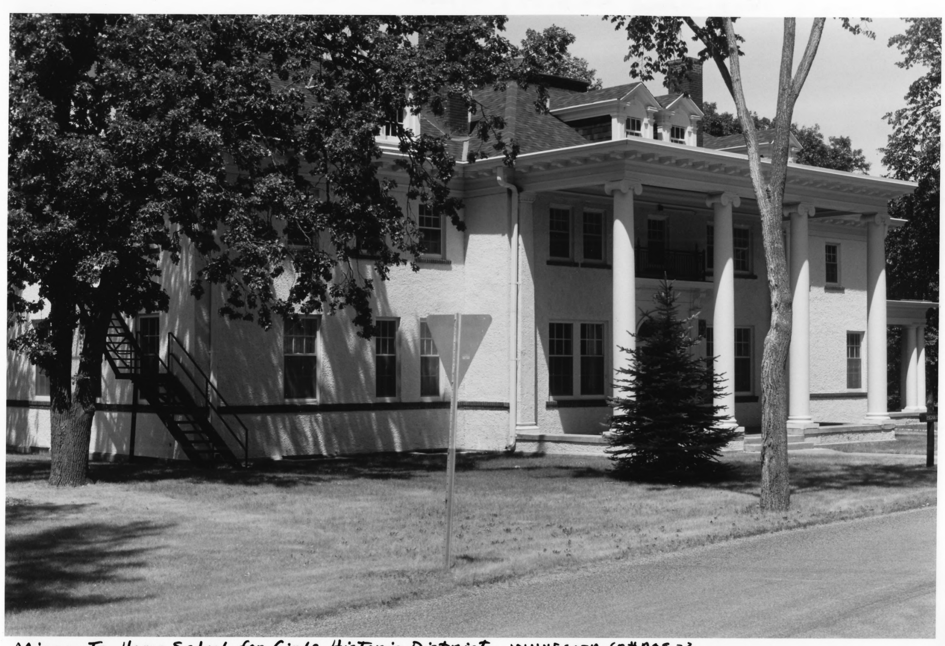
MinnesoTA Home School for Girls Historic District - MINNESOTA COHAGE - 2 STEARNS COUNTY, MN. 09906-6