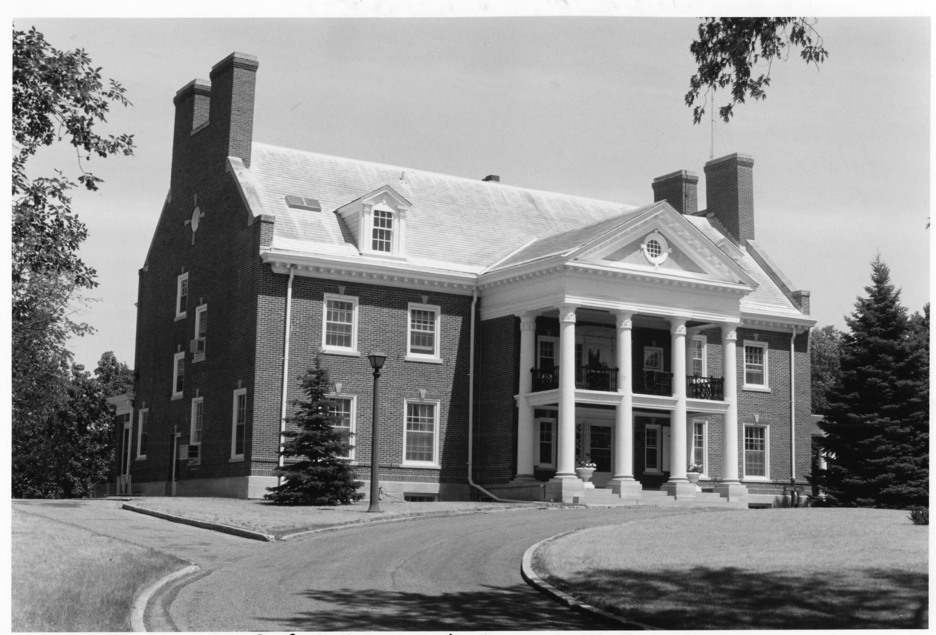
MinnesoTA Home School for Girls Historic District - MORSE HALL -5 STEARNS COUNTY, MV. 09906-7