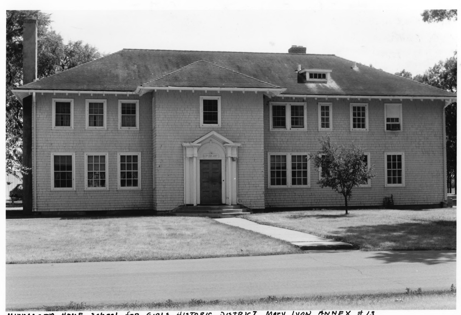
MINNESOTA HOME School for GIRLS HISTORIC DISTRICT, MANY LYON ANNEX # 13 STEARDS CO., MN 09906-17