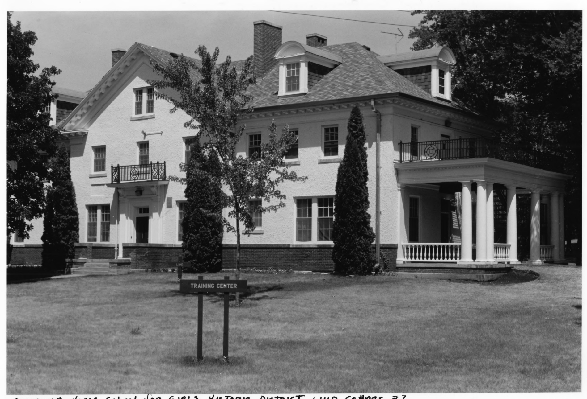
MINNESOTA HOME SCHOOL FOR GIRLS HISTORIC DISTRICT, LIND COMAGE #7 STEARNS CO., MN 09906 #11