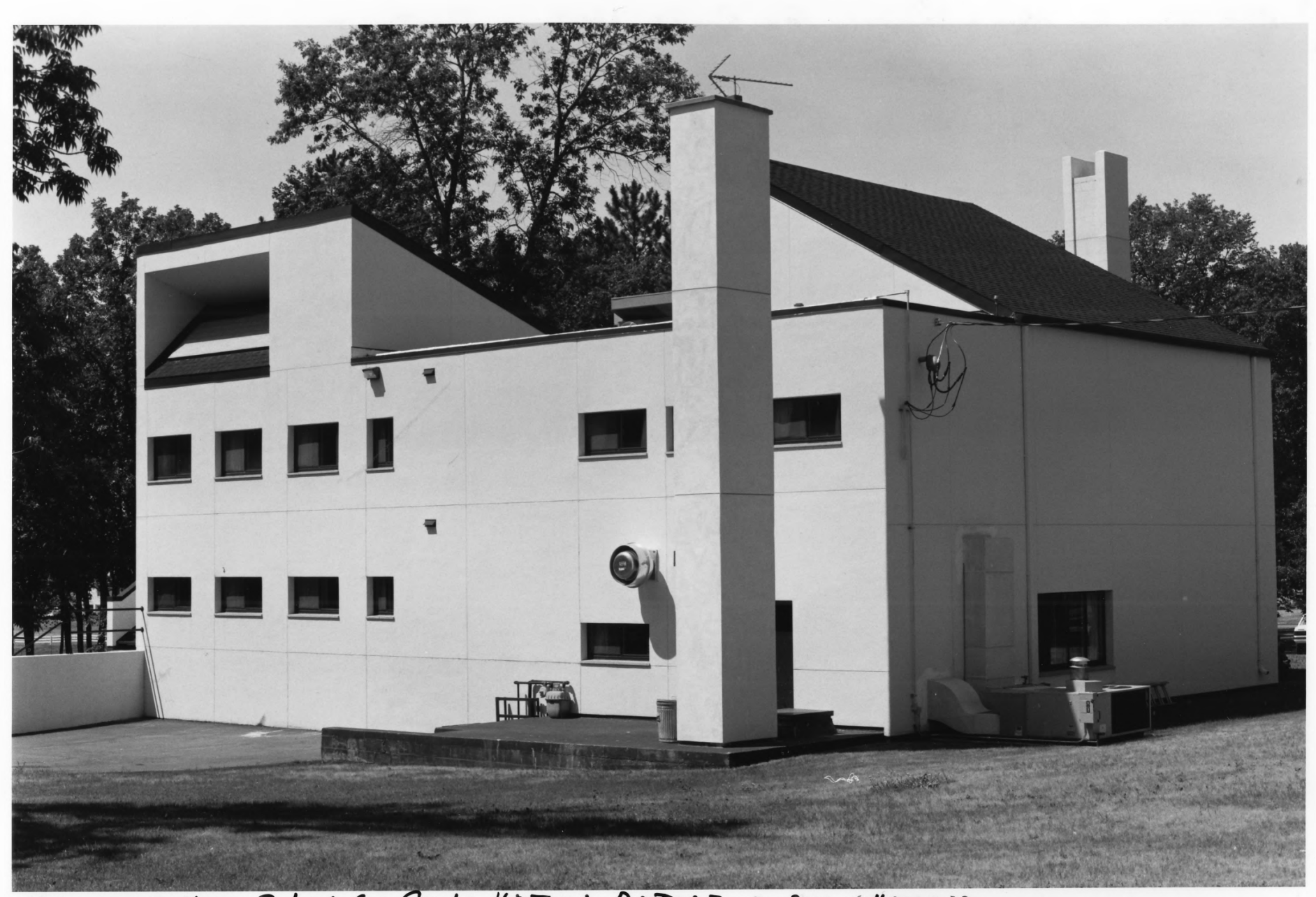
MinnesoTA Home School for Ginls Historie District - Du Bois Cottage - 22 STEARNS County, MN. 09909-13