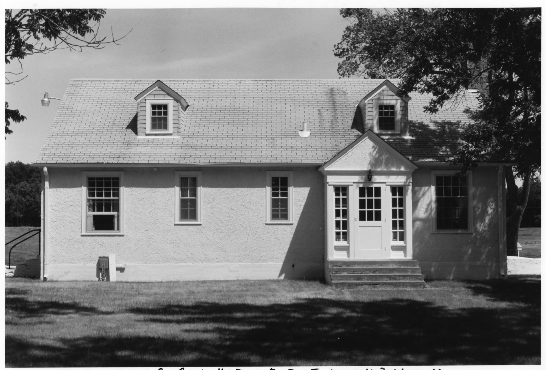
MinnesoTA Home School for Girls Historic District - Fine Arts Building -20 STEARNS COUNTY. MN. 09906-14