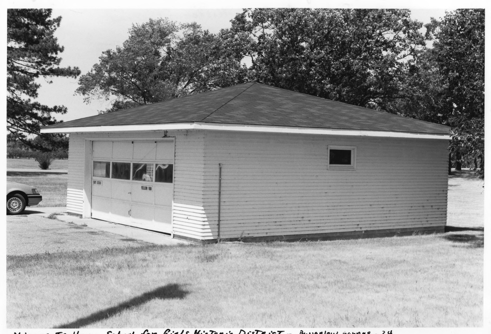
MinnesoTA Home School for Girls HisToric DisTricT - Bungalow garage - 24 STEARAS County, MN. 09909-23