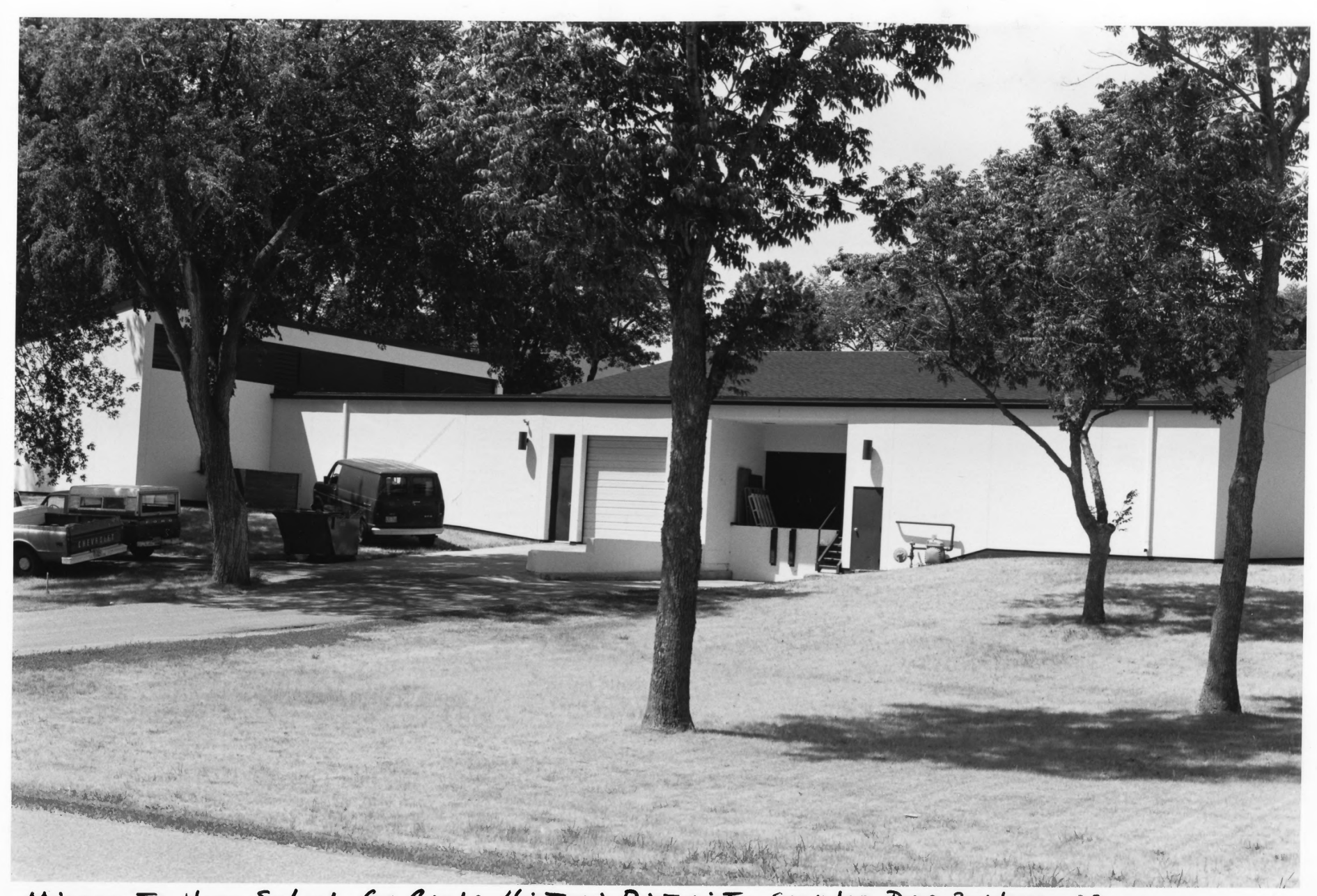
MinnesoTA Home School for Girls Historic District - Schutor Popp Building - 23 STEARNS COUNTY, MN. 09909-15