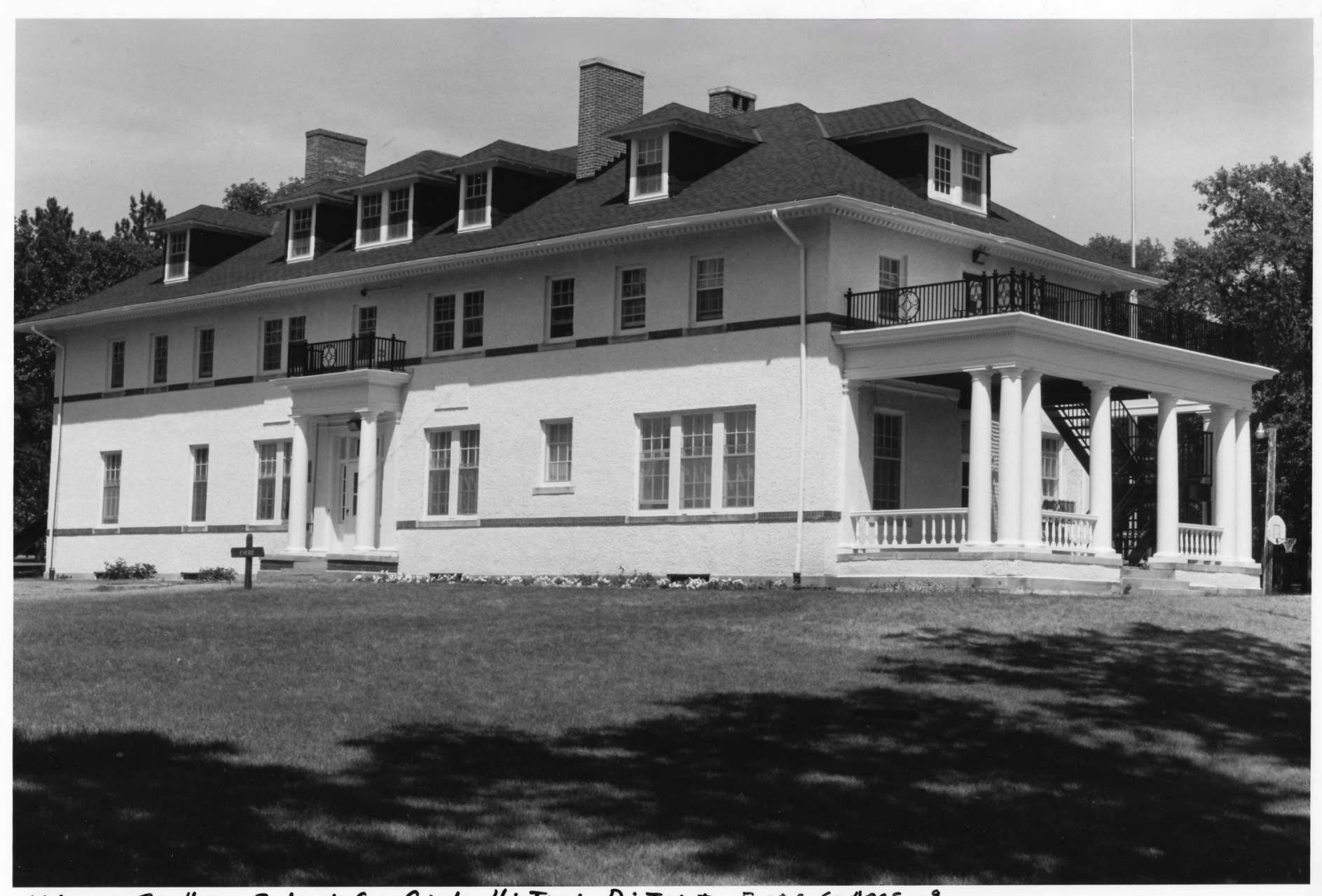
Minnesota Home School for Girls Historic District - Evers Co HAGE -9 STEARNS County, MN. 09906-13