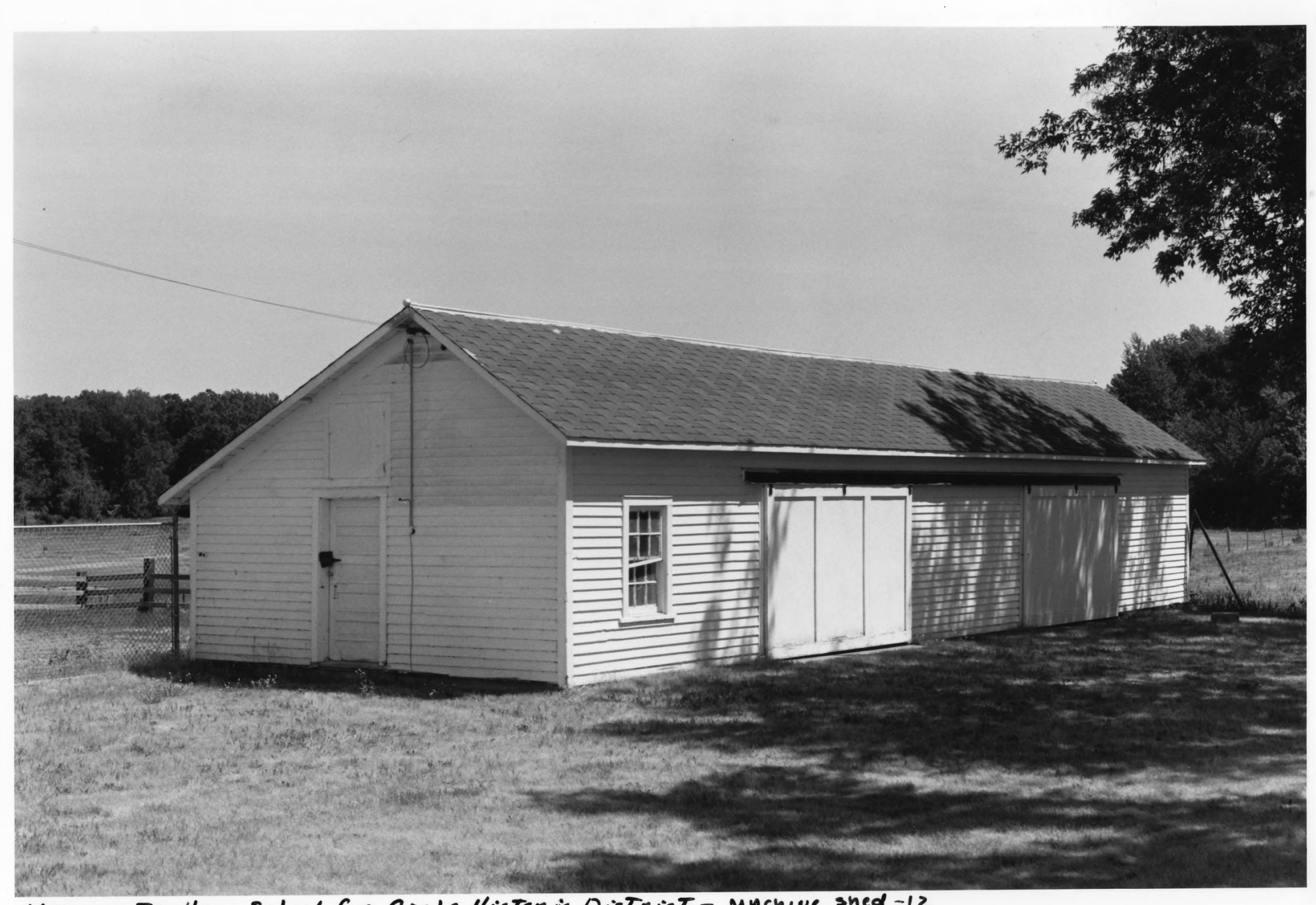
Minnesota Home School for Girls Historic District - Mychine shed-12 STEARNS County, MN. 09909-19