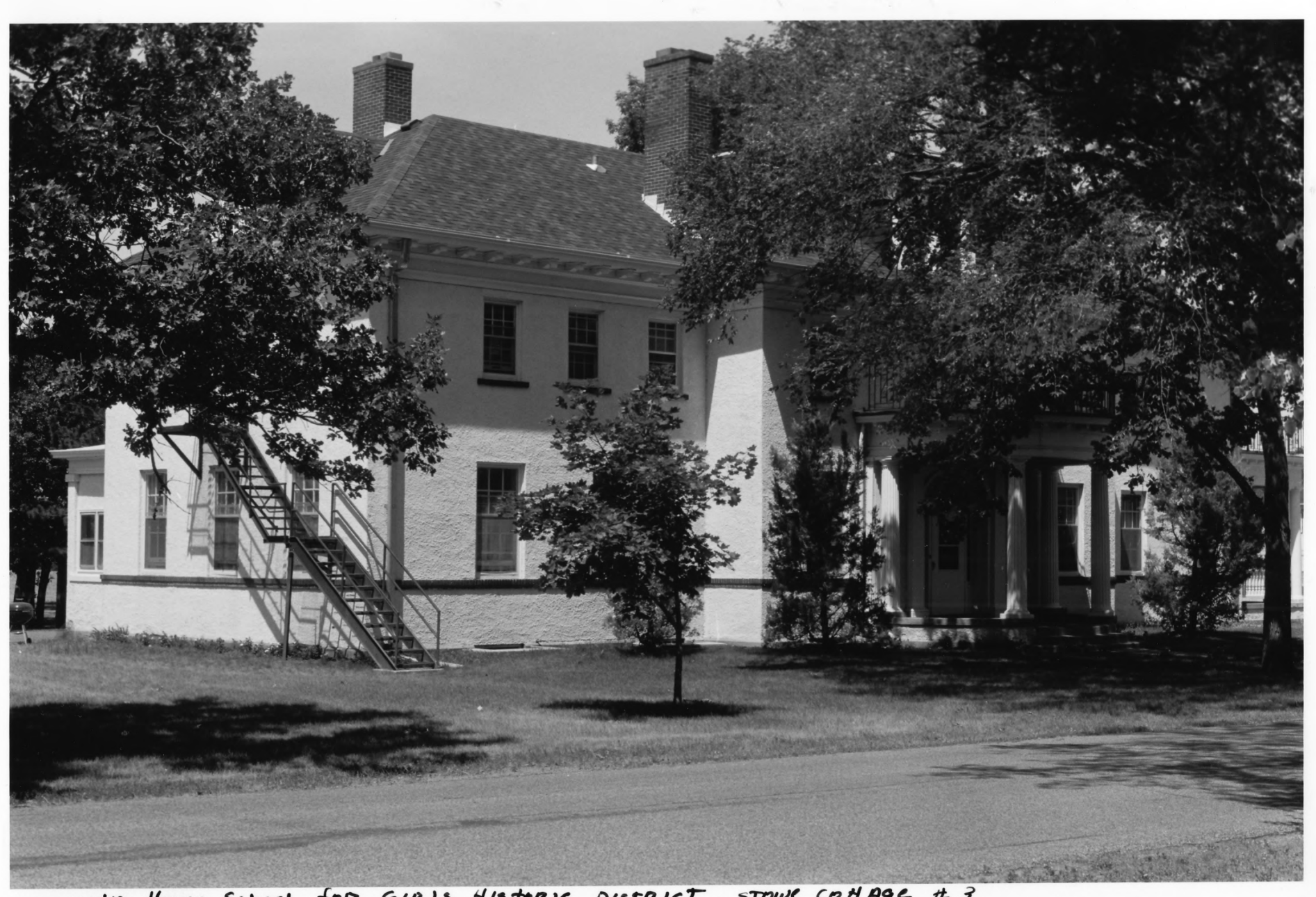
MINNESOTA HOME SCHOOL FOR GIRLS HISTORIC DISTRICT, STOWL COHAGE # 3 STEARNS, CO., MN 09906 # 1