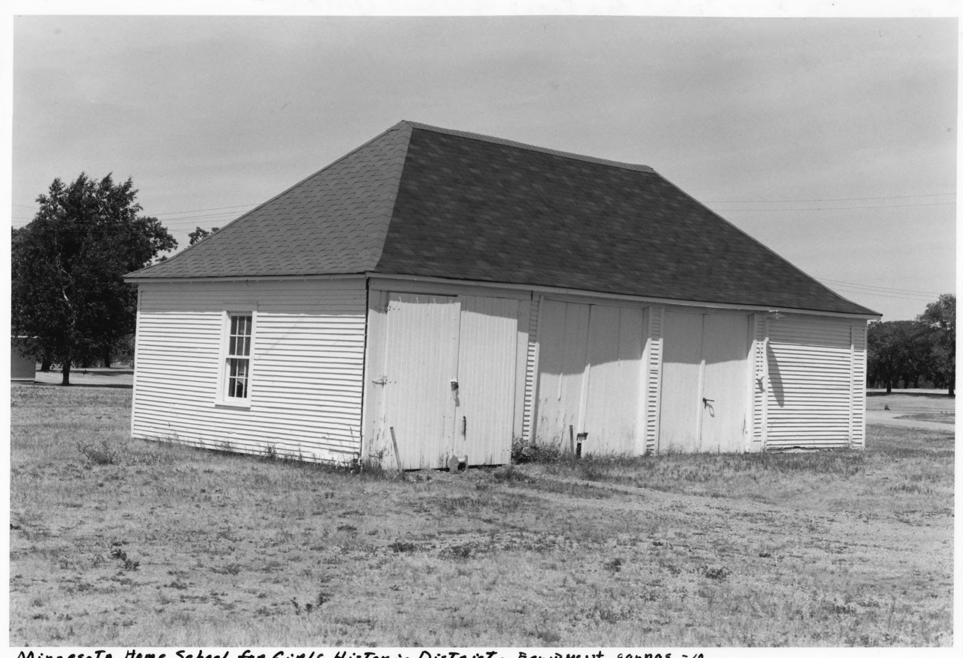
MinnesoTA Home School for Girls Historic District - Equipment garage -10 STEARNS County, MN. 09909-20