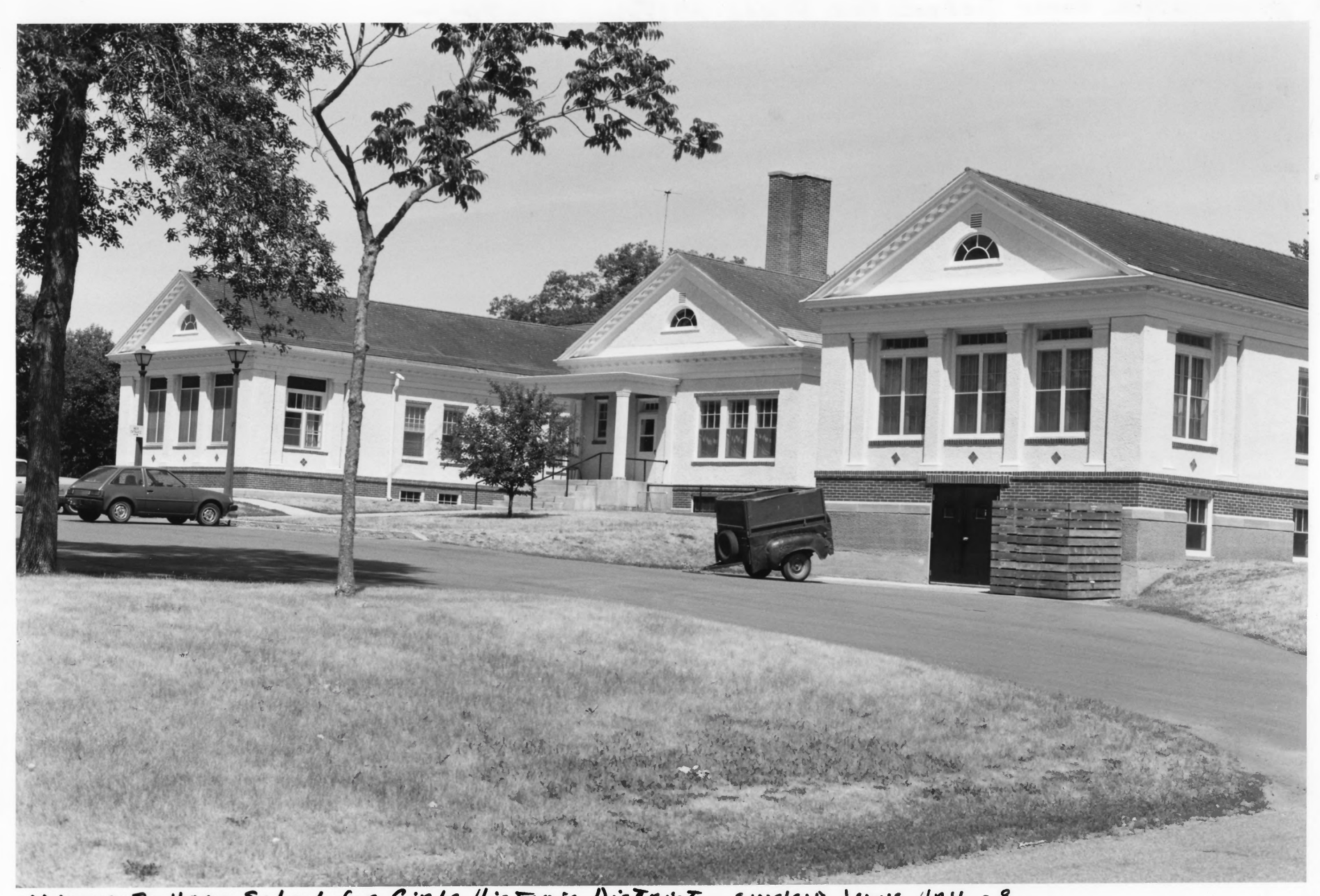
MinnesoTA Home School for Girls Historic DisTrict - SINCLOIR LEWIS HALL - 8 STEARNS COUNTY, MN. 09909-10