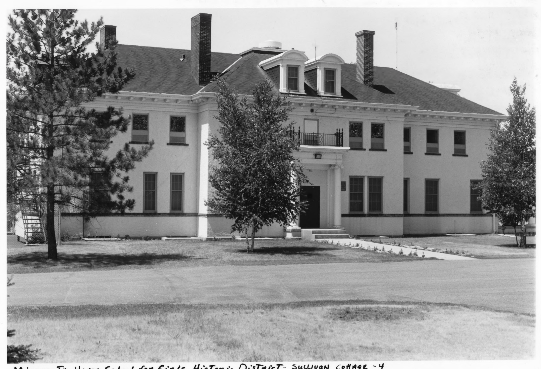
MinnesoTA Home School for Girls Historic DisTrict - SULLIVAN COHAGE -4 STEARNS COUNTY, MN. 09906-5