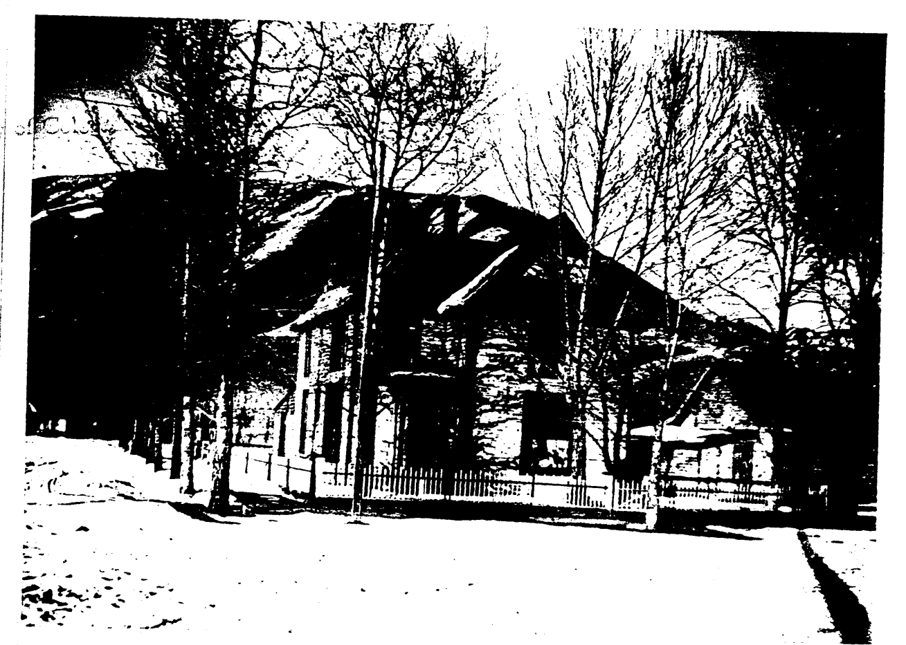
The Davis Waite House, 234 West Francis Street, photo ca. 1940s