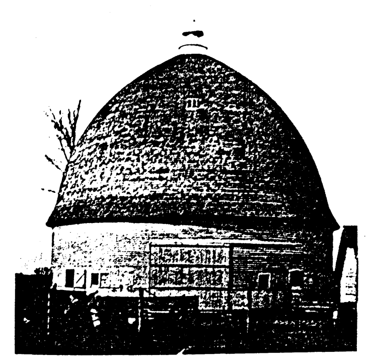
Fig. 25. Round barn