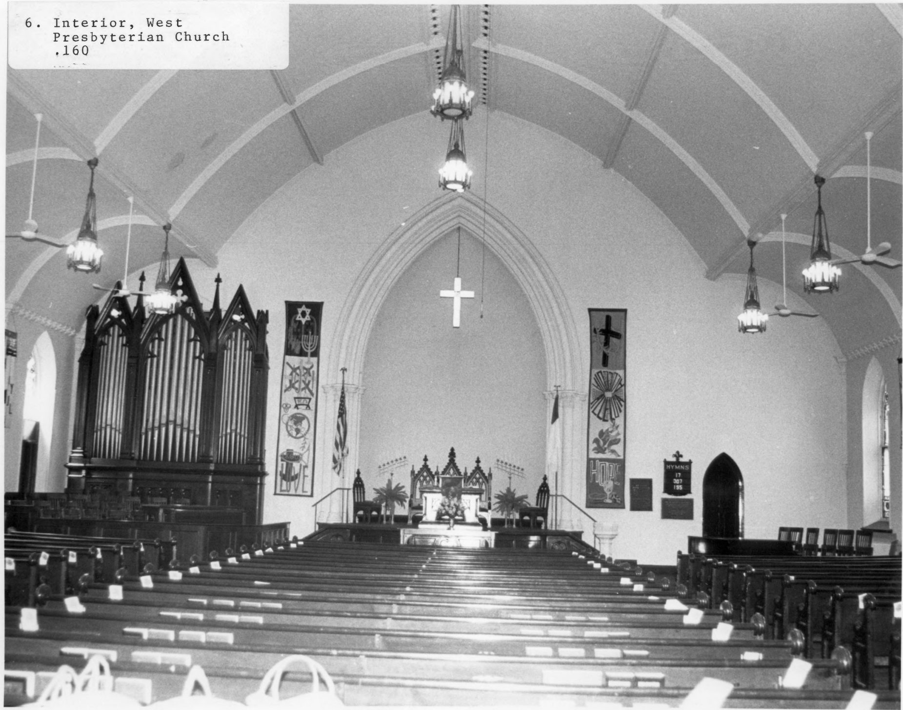
6. Interior, West Presbyterian Church .160