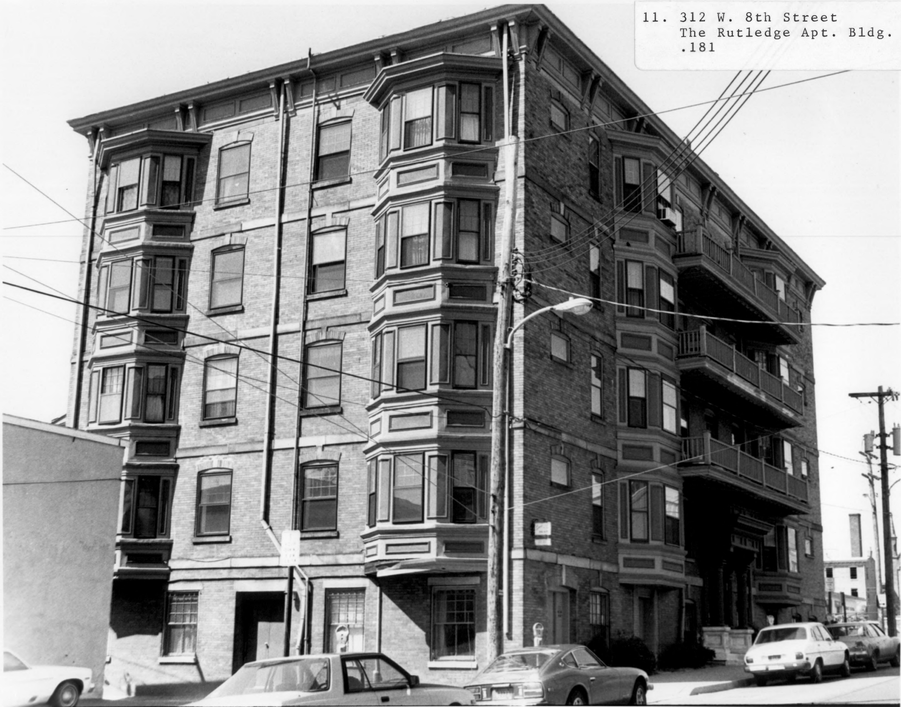
11. 312 W. 8th Street The Rutledge Apt. Bldg. .181