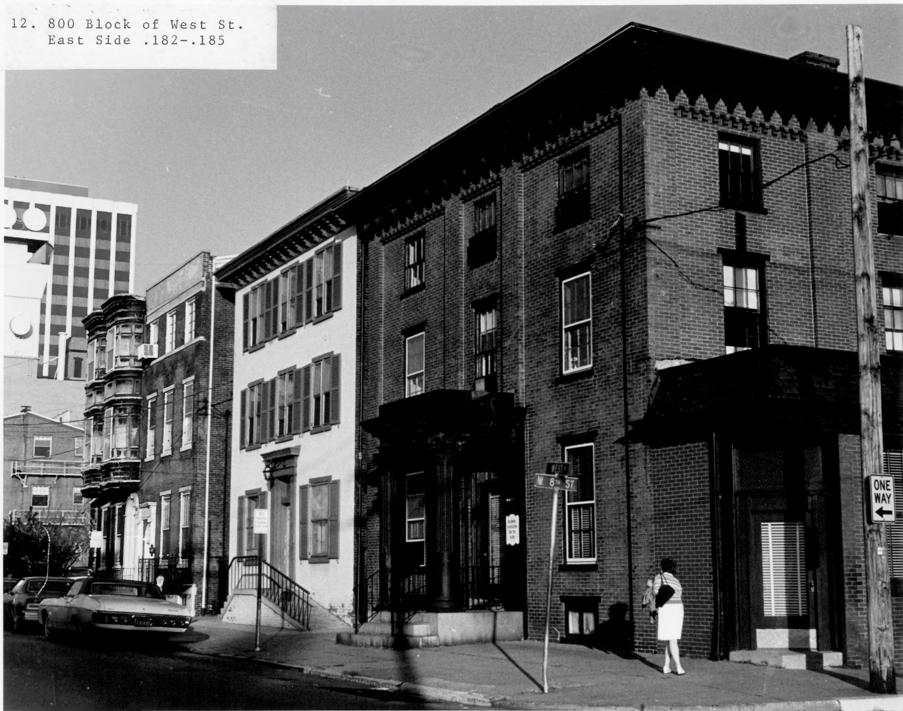
12. 800 Block of West St. East Side .182-.185